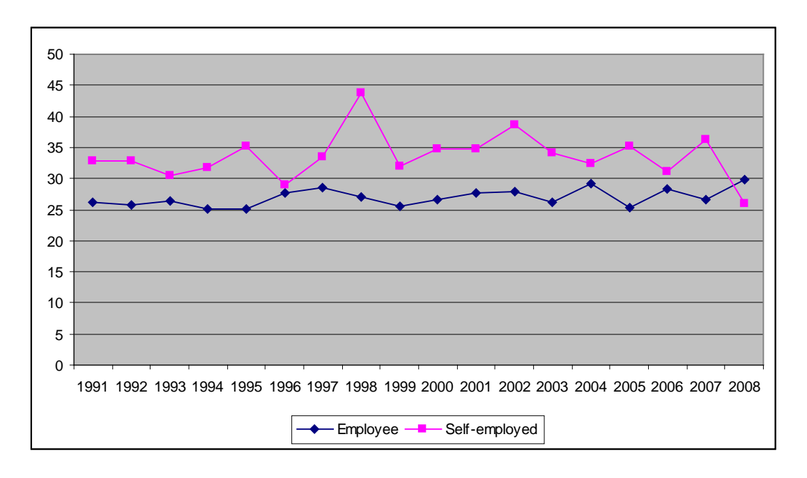
Figure 1: Average hours worked per month in second job by men (BHPS)

Approximately 12.3% of the BHPS sample report self-employment over the period 1991-2009. Rates are higher among men (17.5% on average) than women (6.9%). Consistent proportions (9%) of both self-employed men and women report holding a second job. Consistent with existing literature (Lee et al, 2007; Hundley, 2001), working hours among the self-employed are much lengthier among men (45.3 hours per week) than women (30.6 hours). Among those who moonlight, hours of self-employment (main job equivalent) are lower, but remain lengthy for men at around 40 hours. Figure 1, further, indicates that self-employed men worked considerably more hours in their second job per month than moonlighting male employees.