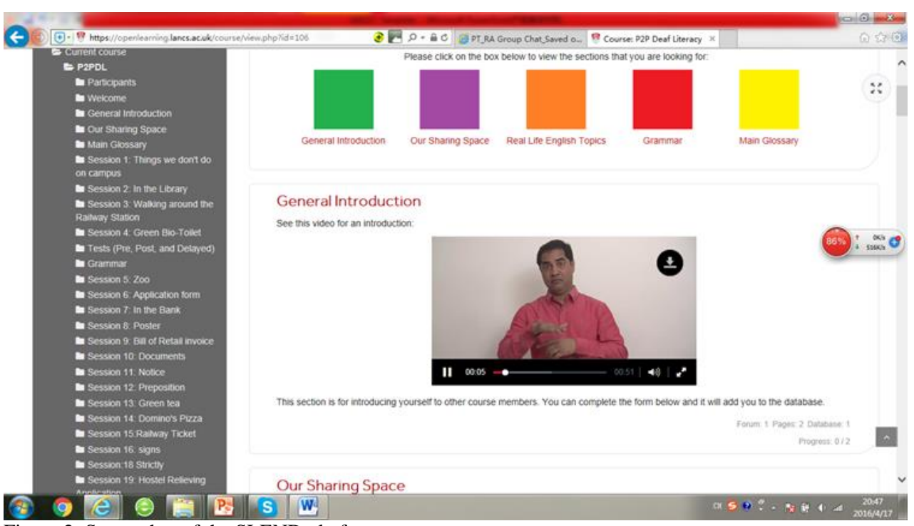
Figure 2: Screenshot of the SLEND platform

RQ3 – We collected copious qualitative data for analysis using Atlas-ti, with subheadings and entries coded under 16 main themes (e.g. student experience, tools, problems, etc.). These data include focus groups in India, Ghana and Uganda, and interviews with learners in India (all translated from the local sign languages into English by RAs), as well as tutors' weekly report forms and RAs' observation forms. These findings from India could then be compared with the stakeholder views collected from the four workshops in Ghana and Uganda.