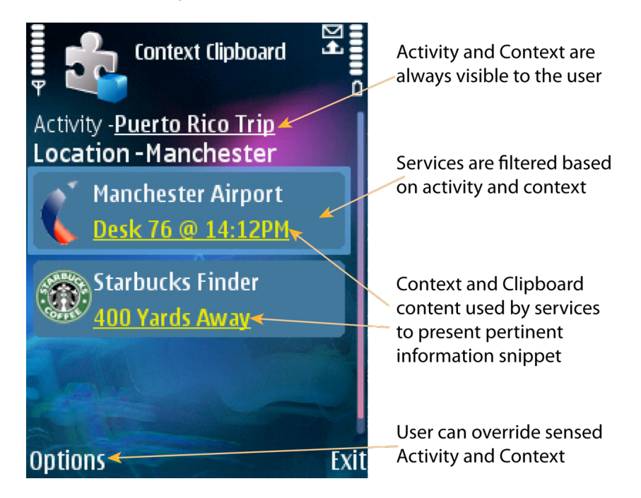
Figure 2: Most relevant services are listed first; services are automatically parameterised and offer 'at a glance' information snippets

Using the scenario from section 2 we describe how these concepts are applied in the context clipboard prototype in order to understand how user interaction with the services is affected.