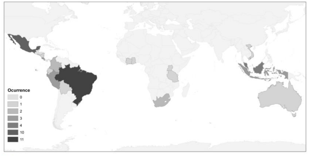
411 Fig. 1.