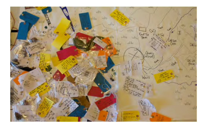
Figure 2. Data produced by the participants of the data walk.

No guidelines were given as to how they should respond and as a result a rich array of drawings, text, questions and found objects were collected.