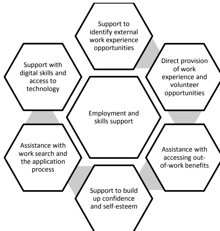
Figure 2 Employment and skills support offered by homelessness organisations (excluding literacy and numeracy support)

These are displayed in Figure 2. Each will now be considered in more detail.