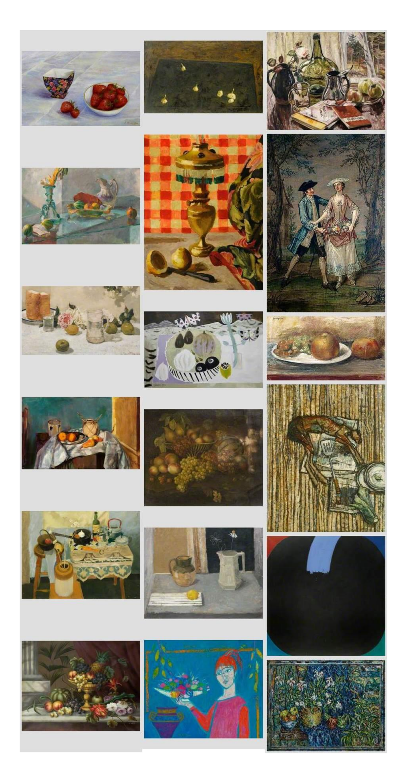
Figure 3. Left column: six images with smallest average NCD to other images tagged "Fruit and vegetables"; center: six images with middling average NCD; right: six images with largest average NCD. (For <u>details</u>, <u>credits</u> and <u>copyright</u> information, see <u>supplementary</u> <u>materials</u>).