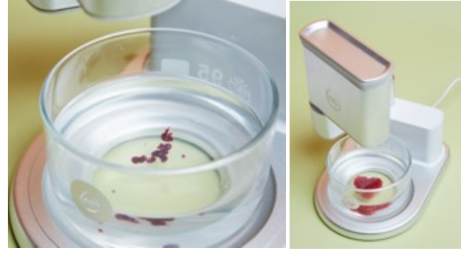
Figure 1. The XXXXXX printer during the printing phase (droplets of printed material can be seen in the bath on left)

Each submission will be assigned a DOI string to be included here.