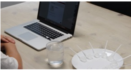
Figure 3. The set-up for block A scenarios

alongside the findings to support increased readability by presenting the hypotheses and results side by side. In designing the scenarios, the research team went through ideation and refinement, where both the data type and content were carefully considered. The intention was to create scenarios suited to the nature of taste (sweet and bitter) as suggested by the literature [11,15,28,34,39], but also to be broad and able to represent real-life contexts, both involving technology (digital) and not involving technology (analogue).