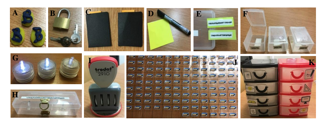
Figure 1: BlocKit-Representation a of Blockchain's Entities: A- Bitcoins B- Wallet's password C- Private key D- Proof-of-work E- Public key F- Block G- Miners' hash power H- Wallet I- Timestamp J- Blockchain ledger K- Consensus rules

Design Informatics University of Edinburgh Edinburgh, United Kingdom c.speed@ed.ac.uk