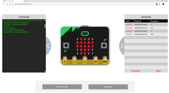
Fig. 4 The WebApp that communicates to a bridged micro:bit over USB serial, translating packets it receives into Web requests.

To allow the micro:bit mesh to access the Internet, a teacher simply loads a WebApp (Figure 4) and packets are forwarded seamlessly to Internet endpoints. Other solutions may require an additional device (such as a Raspberry Pi) to perform bridging functionality, however by using a WebApp, only a computer with a WebUSB enabled version of Chrome installed is required. This approach also benefits from real time updates.