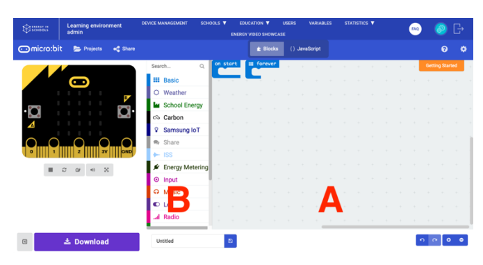
Fig. 3 A block-based programming experience based on Microsoft MakeCode [10]. Users piece blocks selected from the toolbox (B) together on the canvas (A) to build programs.

proximal micro:bits, using the radio module normally reserved for BLE operation. Devices communicate condensed REST [16] requests over the mesh and other devices provide access to the Internet via a bridge to an Internet connected computer, running software that translates condensed REST requests to fully formed requests. REST requests can be made to any endpoint as long as a translation is provided for a condensed request. Given unrestricted access to the Internet through technology, children can enable scenarios that on the surface are safe, but can put children at risk. This concern is especially prevalent with technologies that enable new attack vectors through the use of IoT. [13]. This whitelisted approach safeguards our users by only allowing pre-approved endpoints.