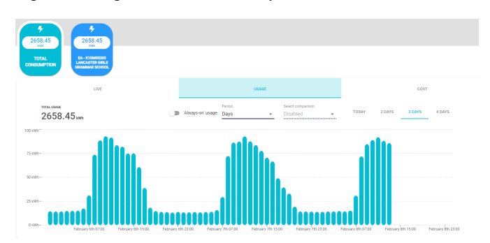
Fig. 2 A screenshot from the Energy Manager portal showing the energy consumption of one school across three days.

For the remainder of this section we discuss the educational aspect of the platform, followed by an evaluation.