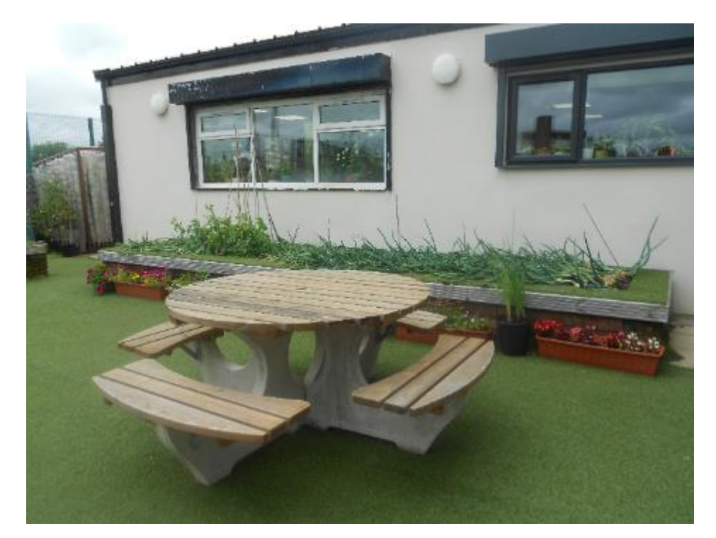
Image 11: Local Food Garden at a Food Hub Point, Intact Community Centre Preston (Fieldwork Photograph, July 2017)

Small-scale, local growing projects typically may not produce volumes big enough to supply a Hub; the range of produce grown may be limited; locally grown vegetables may not match the glossy, uniform appearance of supermarket-sold produce and therefore may appear unfamiliar and undesirable to consumers; and, finally, there is the issue of seasonality: consumers may not be used to only being able to get certain products at certain times of the year. If you are already growing your own food, you may already be using it for other purposes (e.g. cafes) which puts a constraint as to how much can be used for the purposes of the OFN food hubs.