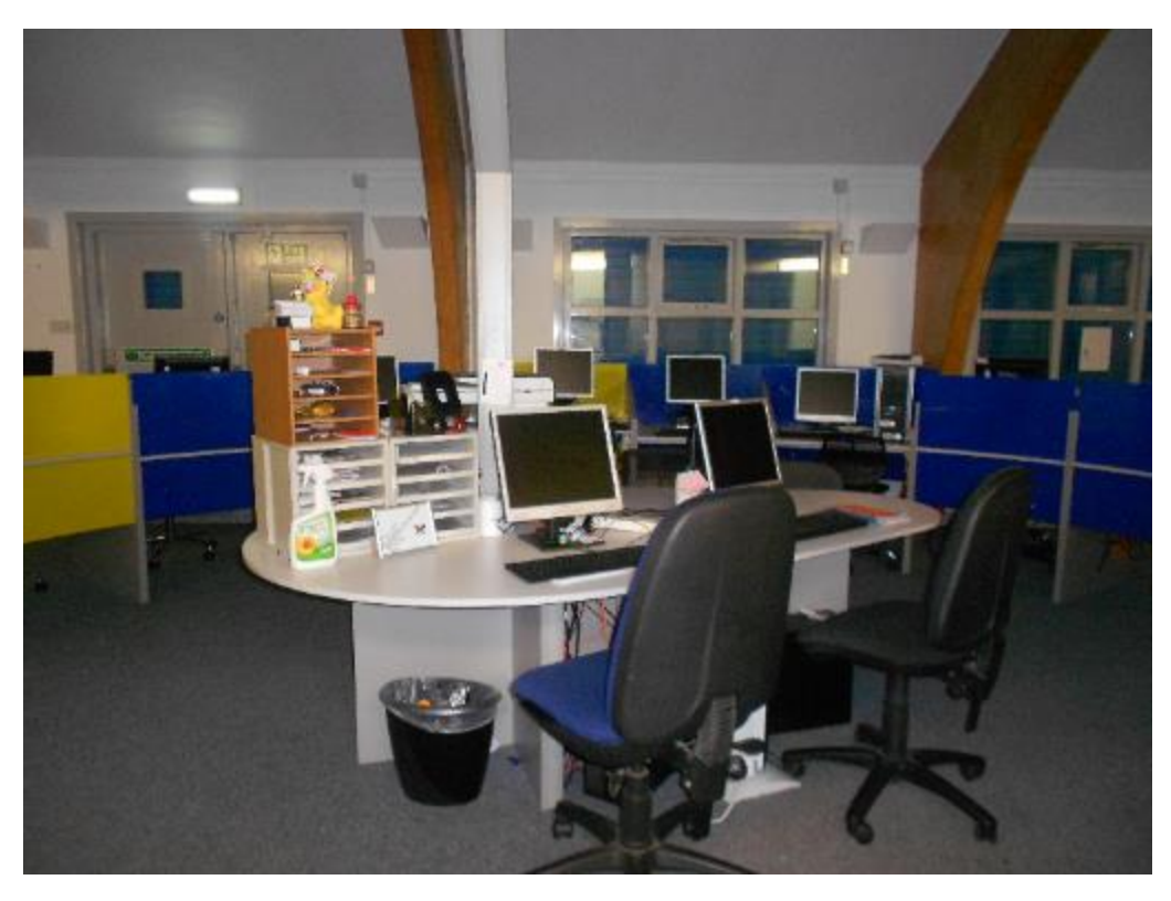
Image 3: Facilities and IT support are available at Meadow Well Community Centre to local food hub users (Fieldwork Photograph, January 2018).