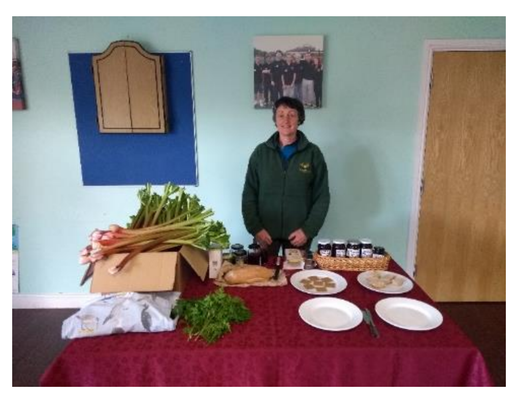
Image 7: A Food Tasting Session around Rhubarb, organised by one of the local farmers supplier of food hubs in Preston (Fieldwork Photograph, May 2018)

In these sessions potential customers have the opportunity to try raw or cooked produce.