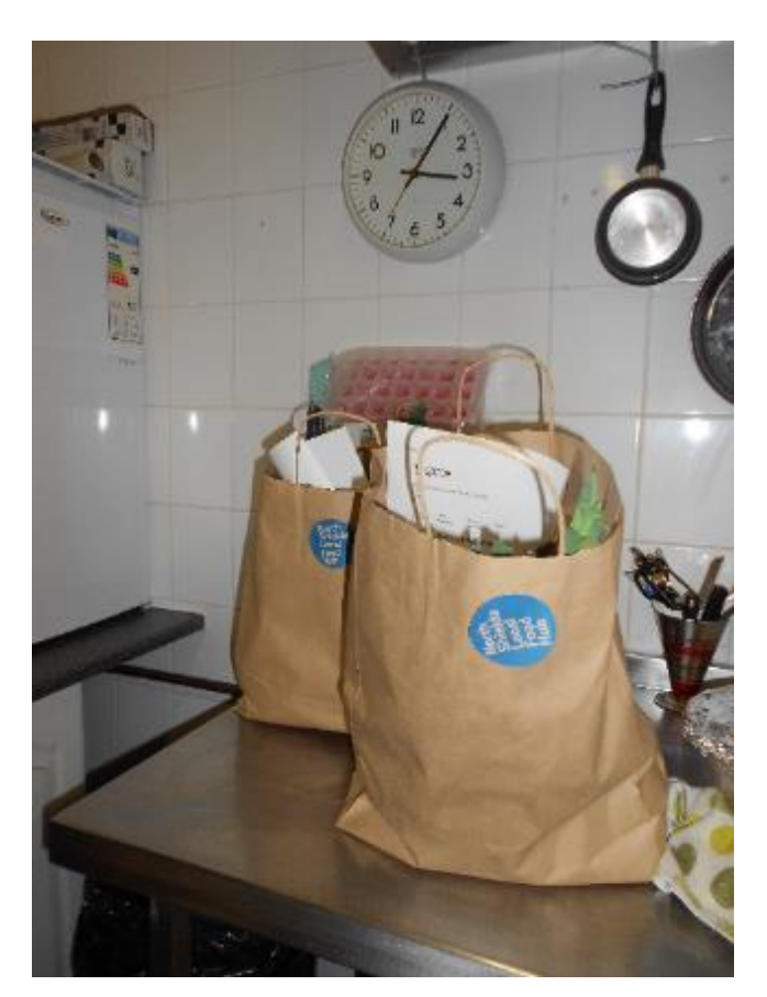
Image 9: Meal box from North Shields Hub, Newcastle (Fieldwork photograph, January 2018).

Include detailed information about the food producers on promotional items, e.g. on a website linked to the shopfront or on recipe cards produced for meal boxes.