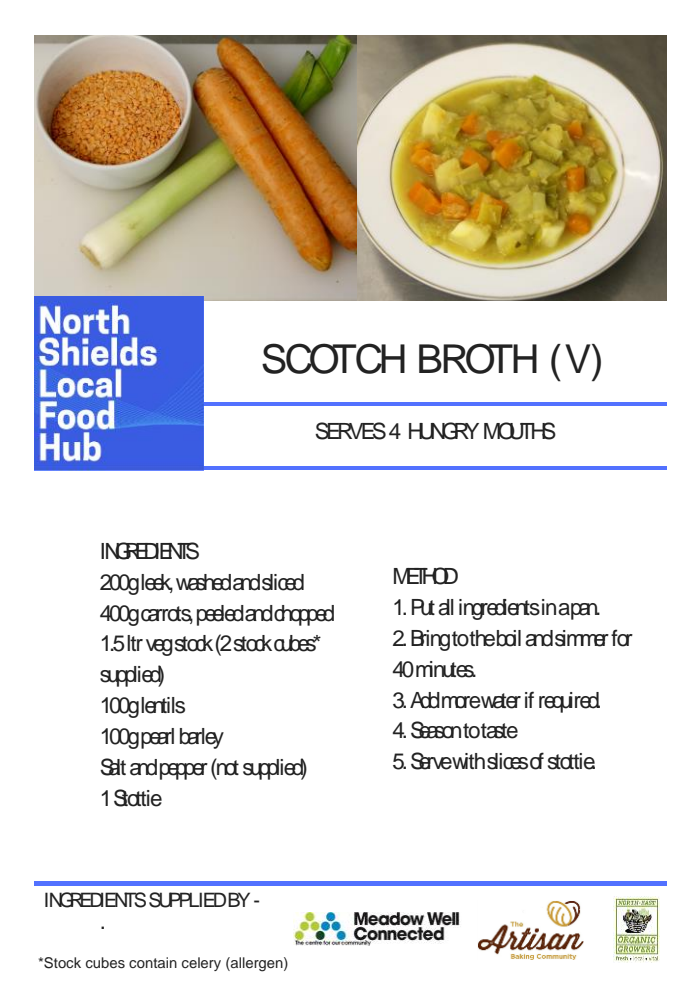
Image 5: Recipe Card included in North Shields Food Hub Meal Box

This approach was implemented in one of our research sites. The recipes were selected as representing a recognisable part of the area's food culture.