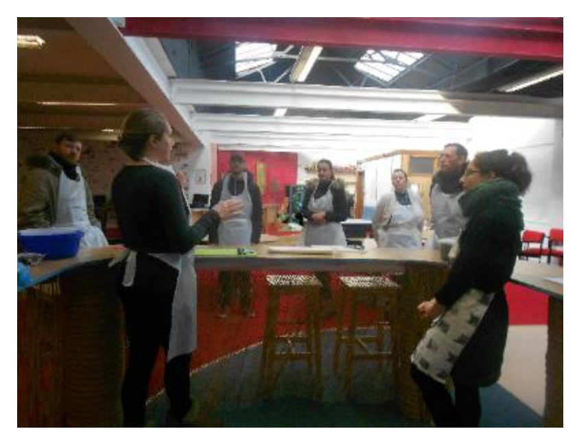
Image 4: Trialling a cooking session at Community Centre, Preston (Fieldwork Photograph, May 2017)

This requires that the premises hosting the OFN hub have facilities, e.g. space, equipment, that would allow these classes to take place. These cooking sessions are envisaged as also offering socialisation and community-enhancing benefits to their participants. In one of our research sites, an organisation participating in the promotion of OFN Food Hubs in relatively deprived city areas, trained a number of volunteers, the 'Food Champions', in issues of food preparation, cooking, storage, nutrition and hygiene. 'Food Champions' who worked in community organisations proceeded then to organise and lead cooking sessions of the kind described here in which cooking 'hacks', skills and nutritional knowledge was shared among participants.