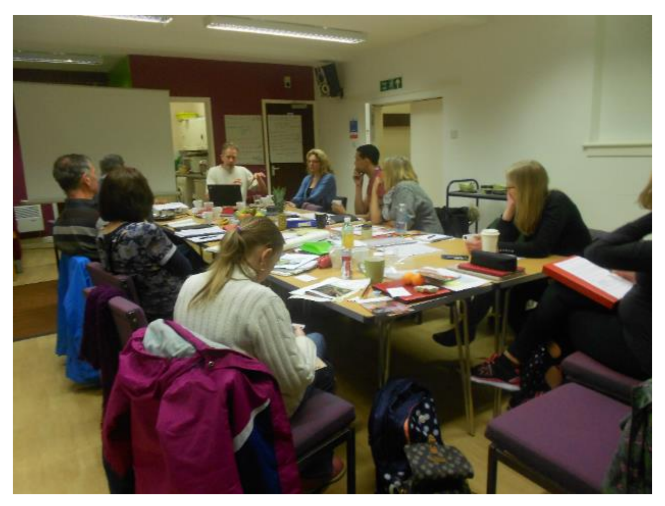
Image 2: Preston meeting of prospective food hub co-ordinators with OFN representative (Fieldwork Photograph, 10 January 2017).

In 2017, OFN Local Food Hubs were piloted in relatively deprived areas of two UK cities, Preston and Newcastle, in collaboration with the Larder and the MeadowWell Community Centre. This was in order to understand and assess how OFN Local Food Hubs could help mitigate and alleviate food poverty in these areas. Though there were unique challenges in the development of both Hubs, it was found that Local Food Hubs can fulfil a unique place in the food provision landscape, being both a for-profit enterprise and a focus point for community.