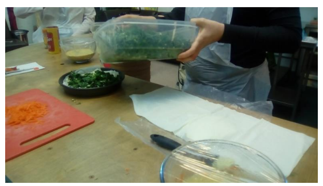
Image 5: Cooking classes is a key 'ingredient' of the food hubs in Preston (Fieldwork Photograph, May 2017)