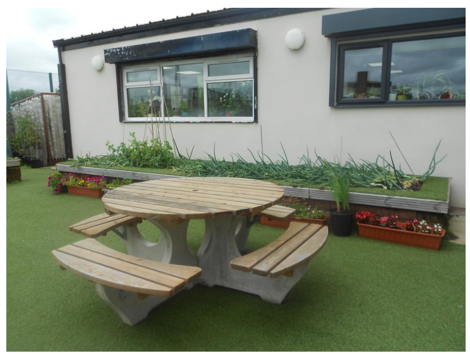
Image 3: View of the Garden of the collaborating Community Centre in Preston (Fieldwork Photograph, July 2017)

5. Identify the resources needed to set up and run a Local Food Hub. Seek to understand the operational reality of setting up and running a Food Hub.