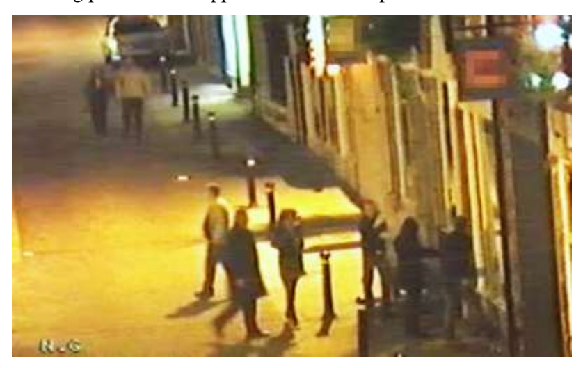
Figure 1c. The two bystanders are joined by others. A male bystander in a dark shirt and jeans pulls the main aggressor from his target, while a female bystander steps between the conflict parties and extends both arms out in a blocking motion.