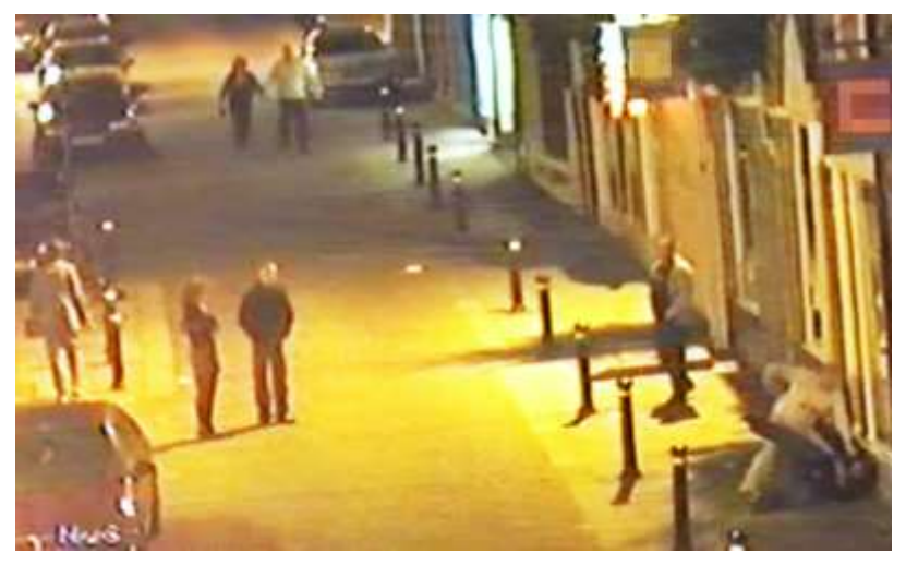
Figure 1a. On the bottom right-hand side, a man dressed in a white shirt assaults another man who is on the ground. Some bystanders observe.