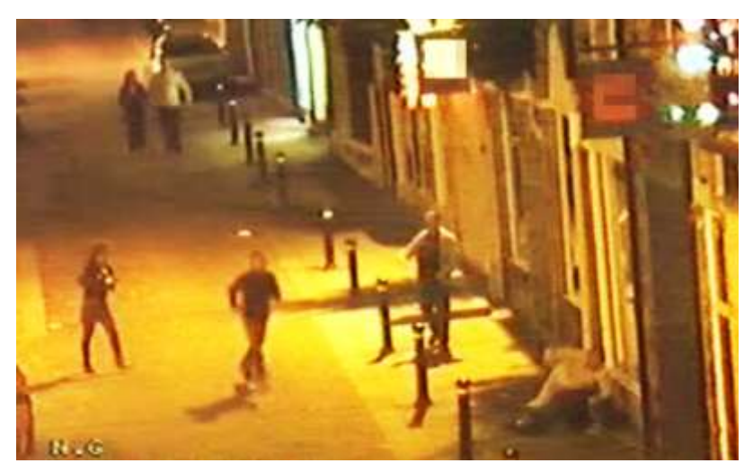
Figure 1b. To the bottom left-hand side, two bystanders leave their standing positions and approach the conflict parties.