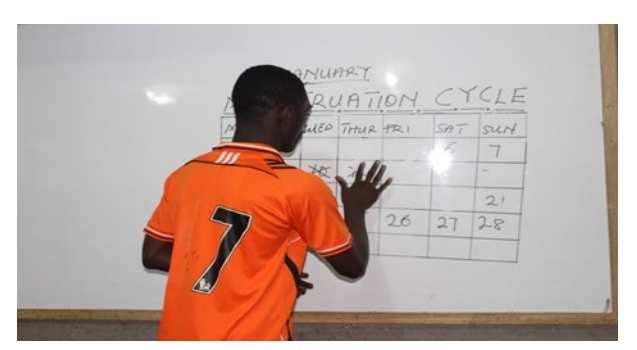
Figure 1 – A student demonstrates his understanding of the menstrual cycle

The topic of the menstrual cycle was suggested by a student who had come across it in a textbook about life management. The other students communicated that they too would like to improve their understandings. The PT found a clear guide to the topic on an American pharmacy site and shared it with the class as a large display. The class, also helped by the RA drew charts on the whiteboard and discussed the various stages. Discussions were in whole group, pairs or individually (See Figure 1).