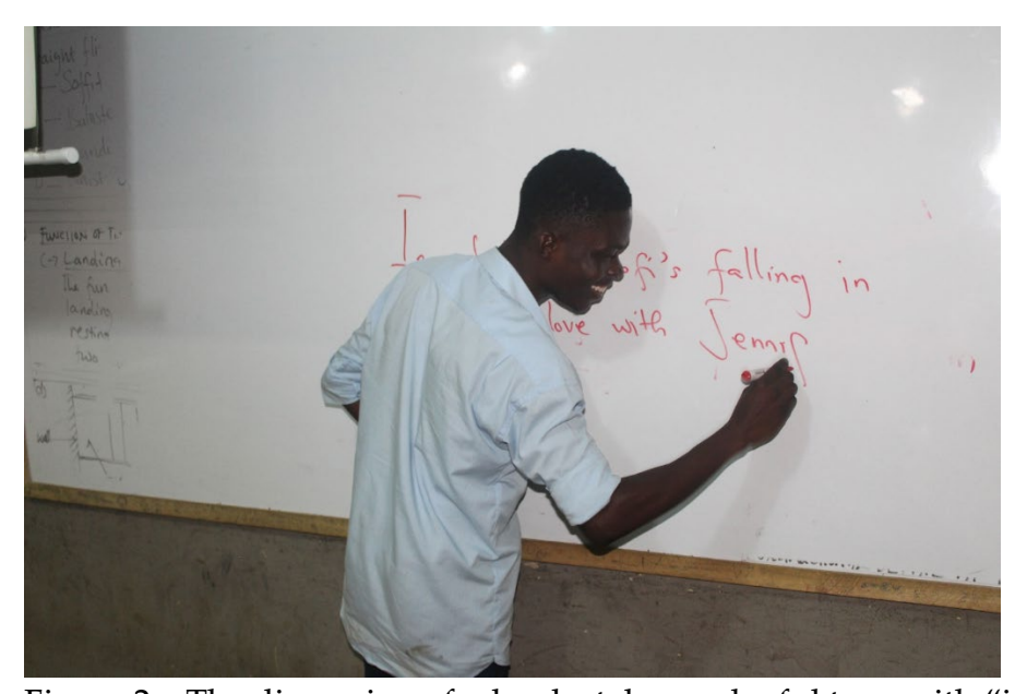
Figure 2 – The discussion of adverbs takes a playful turn with "immediately"

The PT drew the grammar point of adverbs from this material, since a significant word was "monthly". This led to some humorous exchanges related to "immediately falling in love." (See Figure 2).