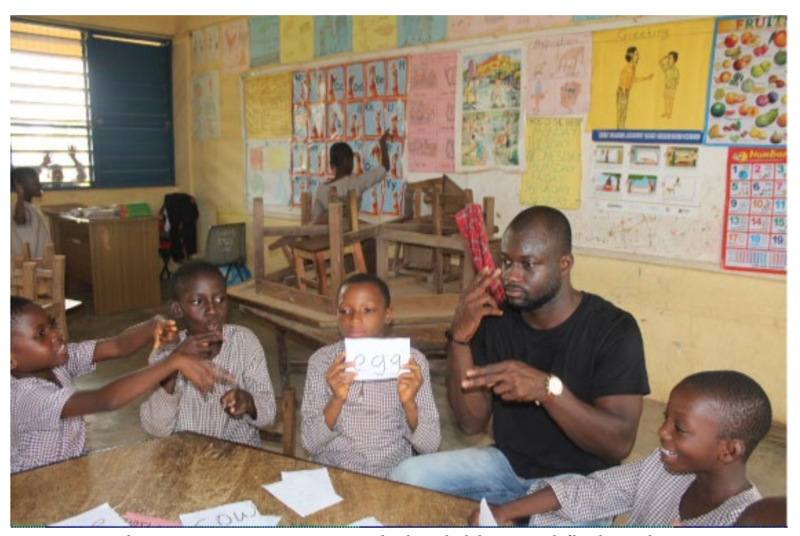
Figure 5 – The Peer Tutor engages with the children and flashcards

The activity was begun by the PT placing the flashcards on the table which the children sat around. The flashcards had English words written on them, which were primarily nouns but also included several verbs. He demonstrated how to use the cards by asking one of the children to hold up a card for him to sign and finger spell the word. He then initiated a peer led approach by asking for a volunteer to run the activity. One of the children then held up cards for each of the other children to sign and finger spell the word from, strengthening the connection between their English word recognition and signing abilities. Each child had the opportunity to sign all the words on the flashcards and they greatly enjoyed the activity (see Figure 5).