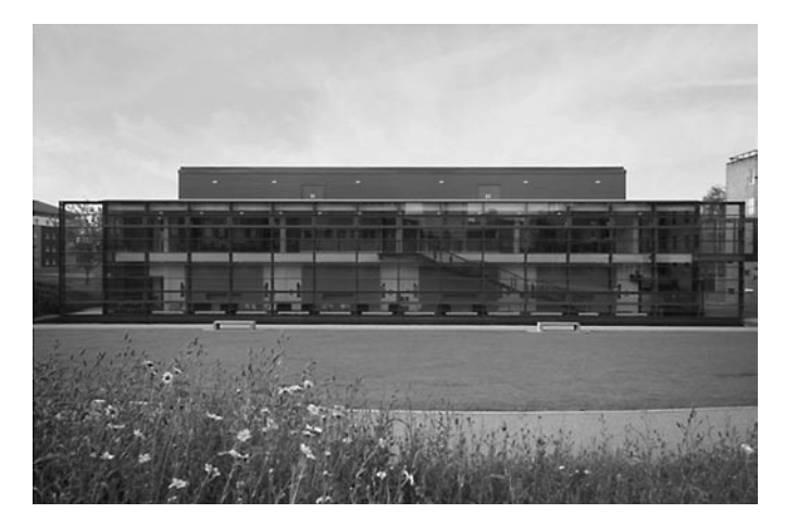
Fig 1 - North facing elevation of the Postgraduate Statistics Centre

The award has partially funded, together with £1 million of University money, a £3.3 million building to expand the postgraduate activities of the department and provides state of the art new teaching space. Environmental issues are taken seriously, and the building, designed by architects John McAslan, conforms to the highest environmental assessment rating (BREEAM excellent). The site for the building occupies a unique location within the University. Sitting within a newly formed landscaped area containing a wild flower garden, this area links the existing buildings of Fylde and Furness Colleges with their new residences adjacent to the perimeter road. The north face of the building is glazed and gives views out to the landscaped space and good views of general activity on campus from the new residences to the hub area close to the shops and student union. There is also a water feature that runs the length of the north side of the building that allows natural drainage of rainwater from both the site and from the building itself (Figure 1). The south face has louvred solar protection to cut out direct sunlight and incorporates solar chimneys that promote passive ventilation of teaching spaces by recovering and re-circulating the building's warmth to keep rooms cool in summer and warm in winter.