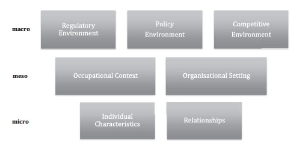
Figure 9.1 Framework for analysing the facilitation of money laundering

particular transaction (which could cross multiple jurisdictions) could encourage compliance with AML processes and ethical decision-making. Any failures or limitations in the regulatory environment, however, will mitigate its effectiveness by limiting deterrence efforts or affecting individuals' or firms' ability to comply. The nature of the organisation in which a legal professional works (e.g. size; complexity; nature of their business and clients; extent (local/global) of their reach; structure; division of responsibility, authority and accountability; compliance processes and management; internal oversight processes and procedures; autonomy of individuals) will influence the types of decisions that lawyers have to take and the choices they make. A personal or family relationship , or some form of 'broker' to the relationship, can cause a legal professional to make decisions about a client or transaction that they otherwise would not.