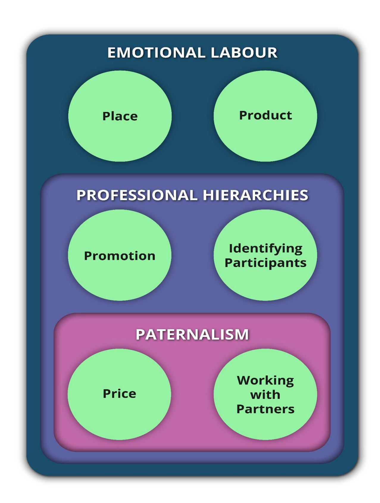
Figure 2: New palliative care trial recruitment framework proposed