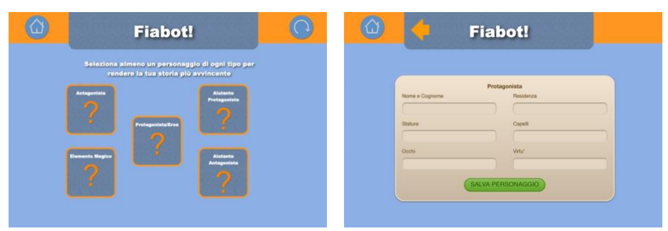
Figure 5 A screenshot of the fourth step when children describe of characters.

In the fourth step, children have to provide a textual description about each character's role: protagonist, antagonist, protagonist helper, and the magic object. For each they have to provide name, appearance elements (e.g. hair colour), and also talk about virtues such as the traits and quality of the characters' moral attitude. We expected that this element would make children reflect about the characters and create a sense of empathy for them. After they described all the characters, they could start with the creation of the story. From our previous experience, these steps will stimulate children in framing also the plot, thus at the moment of writing, they already have an idea about the story.