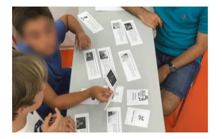
Figure 3 Picture from W3: children and HCI researchers.