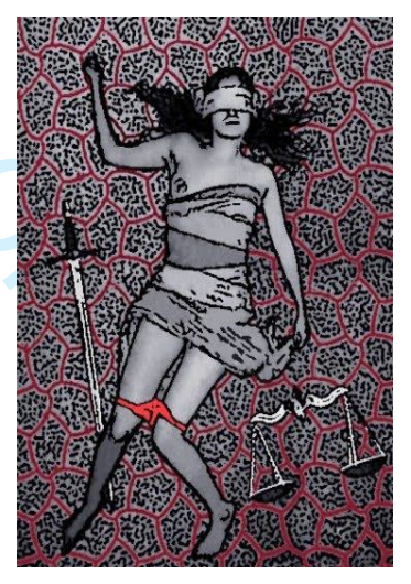
Figure 2. Visual digital artefacts created and spread by Twitter users associated to the Hashtag #PatriarchalJustice. They all include references to a shameful and unjust justice in reference to sexual violence and the "Wolf pack" case.