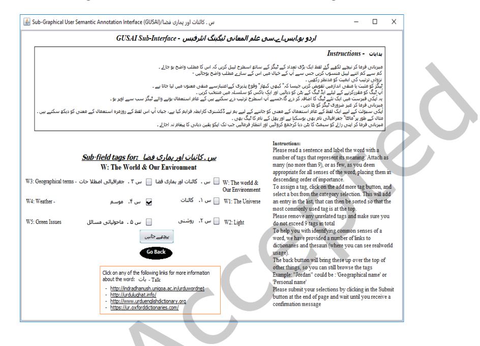
Fig. 2. Sub-GUSAI to add/remove semantic field tag(s).

tag(s). When annotations are completed for the entire corpus, an annotator is prompted with an "annotation completion message" and (s)he can use the Exit button to close the annotation tool.