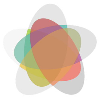
Figure 4: elements intersecting any of the five sets