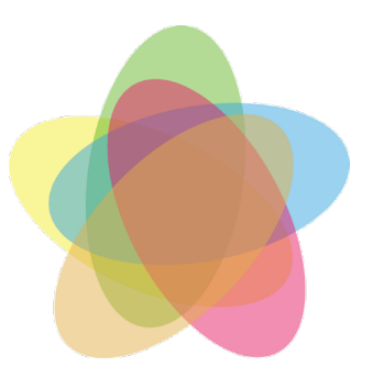
Figure 2: Venn diagram visualising five sets

Following the identification of key-key-words, we were then interested in identifying key-key-words that are unique in their occurrence to each of the five different communities studied. To explain our method, we adopt a familiar format for visualising set operations: Venn diagrams. Given two or more keyword sets, these sets can be compared against each other to identify keywords that are common to - or differ between - several sets; here we compare five sets (Figure 2).