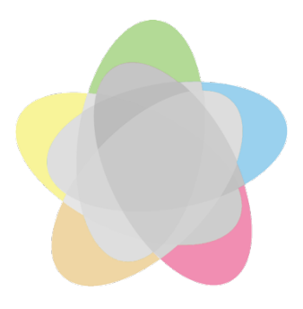
Figure 5: relative complements of all sets

Applying this method provides, we argue, a transparent approach based on set operations and "minimally sufficient" statistics (Egbert et al., 2020) to narrow the potential scope of a keyword analysis; the process yields 4,933 complement keywords for all five manosphere subcorpora representing 32% of all key-key-words identified (Table 2). Moreover, that the keywords identified are restricted in their use to specific corpora - and are never found to be key-key-words in any other corpus under comparison - suggests that these keywords represent, at once, the most content-distinctive and content-generalisable words in that corpus.