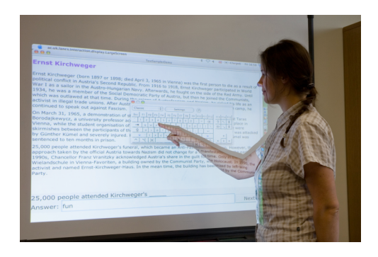
figure 4 touch screen setup.

Finally, the investigator conducted a semi-structured interview: participants ranked the device combinations according to the ease of use and to the perceived speed by explaining their choice. They were also asked whether they would use mobile phone & screen in reality.