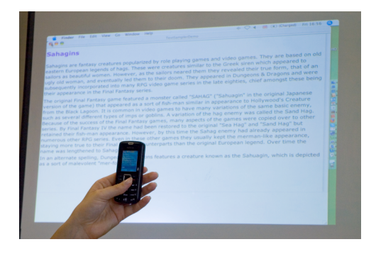
figure 3 mobile phone & touch screen setup.

When they had performed the training task, the investigator started the experiment. For example, one participant completed the task block on the mobile phone, followed by a questionnaire about the usability. This was then repeated for the two other device combinations, touch screen and mobile phone & screen.