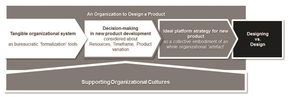
Figure 1 – The Conceptual Research Model developed

In order to better understand the notion of 'designing' in digital product design projects from cross-cultural perspectives, the conceptual research framework was developed based on the literature, consisting of four major areas: (1) factors in decision making in the NPD process; (2) tangible organisational systems and IT technology tools; (3) reflection of the organisation in the product platform, and; (4) supporting organisational cultures.