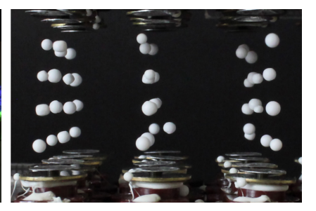
Figure 1: Examples of data physicalizations: (left) population density map of Mexico City co-created by Richard Burdett and exhibited at the Tate Modern (photo by Stefan Geens), (center) similar data shown on an actuated display from the MIT Media Lab [70], and (right) spherical particles suspended by acoustic levitation [61]. All images are copyright to their respective owners.