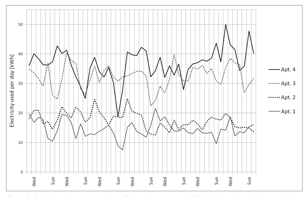
Figure 2. Daily electricity consumption profile for four apartments in Blue block selected for the qualitative study.

monitoring period, consisting of two low-consuming apartments and two high-consuming apartments. None these apartments were in the very extremes of the distribution range. The average daily consumption (and CV) for each apartment was as follows: apt. 1=14.61 kWh (20 %); apt. 2 =17.66 kWh (16 %); apt. 3=32.34 kWh (13 %); apt. 4=36.63 kWh (15 %). Thus, the high-consuming apartments consumed roughly twice the electricity of the low-consuming ones. Despite considerable variation in the daily consumption levels of each apartment, the ranges of the two groups remained, on the whole, separate (Figure 2).