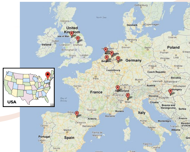
InSup-C consortium members

In time, a dedicated website will host an e-learning platform and checklists against which services can benchmark their own palliative care service provision.