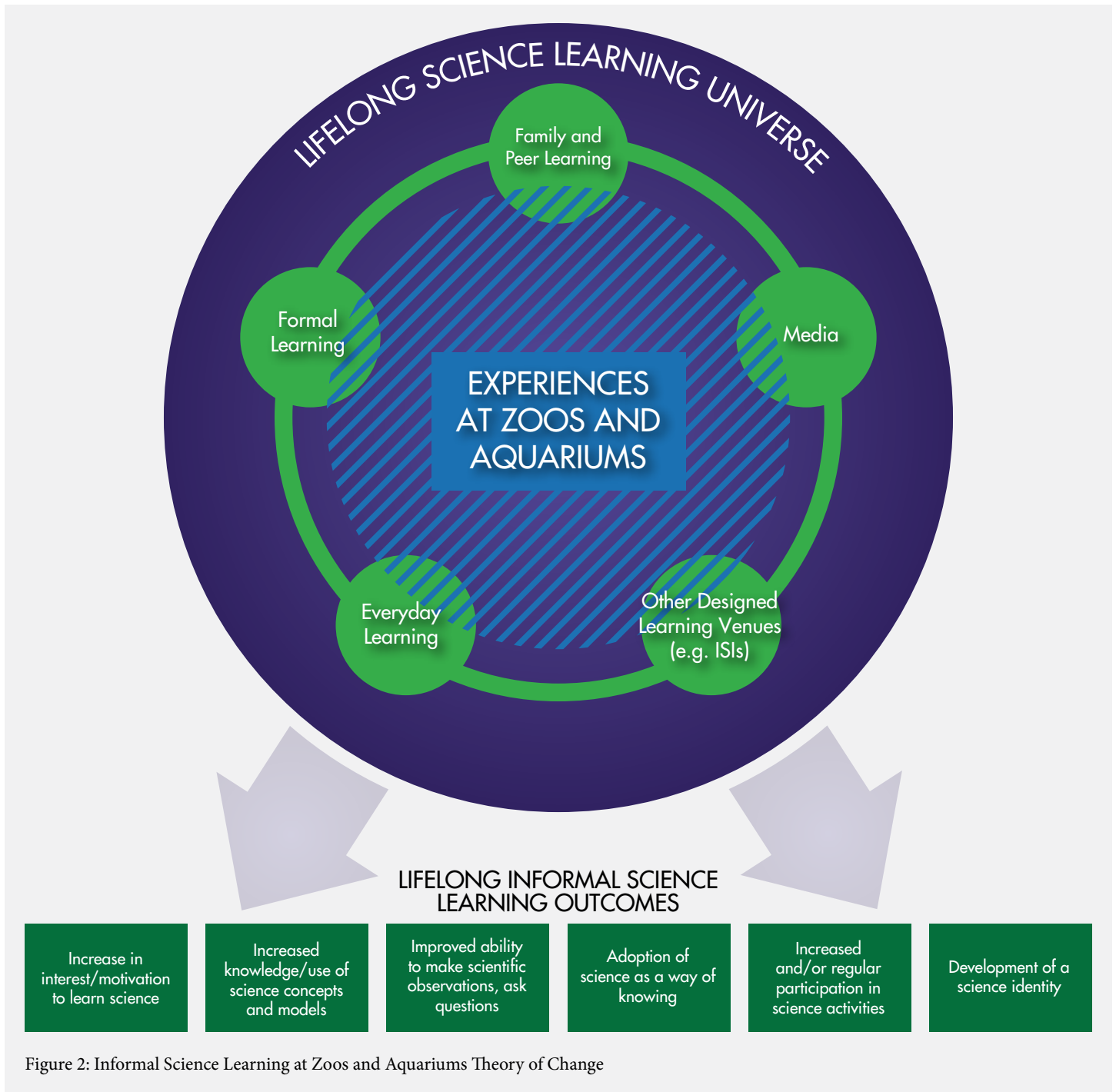
Figure 2: Informal Science Learning at Zoos and Aquariums Theory of Change

The theory of change demonstrates that informal science learning experiences at zoos and aquariums do not take place in isolation. Zoo and aquarium learning experiences are in fact one part of an individual’s lifelong science learning journey. Therefore, our project findings have shifted our focus away from a likely futile attempt to isolate the long-term impacts or effects of zoo and aquarium learning only. Instead, our research agenda will attempt to describe how zoo and aquarium learning experiences interact with, influence, and are influenced by a range of other science learning experiences that may take place in one’s life.