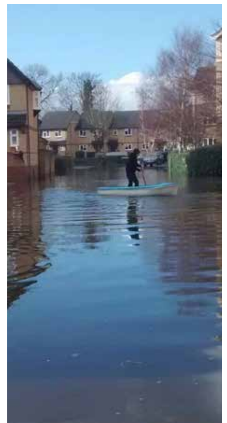
Photo: Flooded street in Staines-upon-Thames