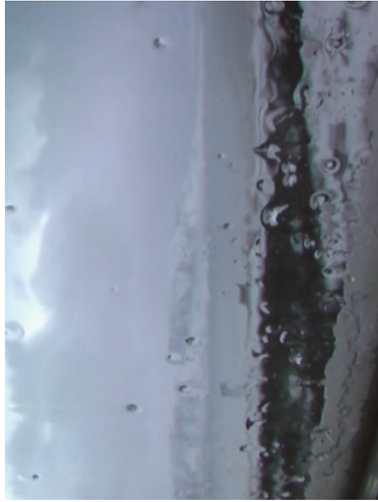
Weather and glass. Arctic landscapes (Fieldwork film, Weather Permitting, Gabrys and Yussoff)