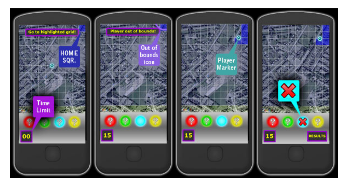
Figure 3: marshOtron in game view (left to right) initial load (a), out of bounds (b), player's marker (c) and game over (d).

In order to light up squares; players must occupy that square for 15 seconds (Figure 3b). During this time players are encouraged to move around in the square whilst the capture takes place (building up a strategy). Note the 15 second time, was a compromise between the young people who wanted a shorter time to increase the speed of the game and the concerns of the organisers over safety as previously discussed. To determine the state of the square occupancy, communication between the players mobile and a game server is required, the response is made up of two outcomes; the players light cycle lights up the square (square not occupied, represented on the mobile phone by the changing of the original square colour to the players colour, Figure 3b) or the players light cycle runs out of light (signalling to the player their game is over, Figure 3d).