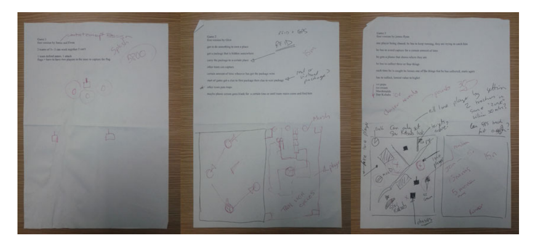
Figure 1: Participants mobile game designs (left to right) capture the flag (a), light up areas (b) and collect items (c).

The first encounter with game design came through brainstorming around the table after an evening of playing Laser Tag. This then lead to the group mapping out their ideas on paper, which in turn were storyboarded by the designer for the project. Figure 1, shows some examples of the ideas generated by the participants. Figure 1a is a simple capture the flag idea. Figure 1c a single player game, where a player goes around environments collecting items. The idea which was furthered in this study best resembles Figure 1b, where players would have to move around a map, lighting up areas similar to Tron light cycles. However this differs from the final game as the idea involved too much complexity for the initial study, the game idea was a mix between lighting up areas and holding the package the longest. The mobile handsets and platform technologies used in this study (Nokia N8 and Flash Lite 4.0) didn't provide us the capability to further the idea of holding and transferring packages, as this was designed to use RFID technology.