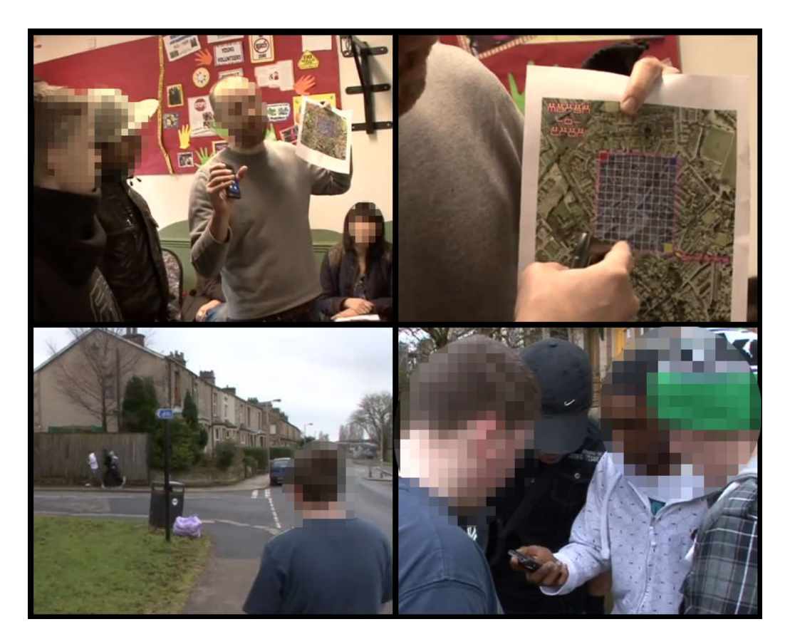
Figure 7: The Folly event at Lancaster Marsh Community Centre 28/04/2011 (left to right), player's introduction (a), pointing out boundaries (b), players locating their home square (c) and in game discussions (d).

As the game was developed as a prototype using the Flash Lite 4.0 platform, there was no functionality to store location data to the phone; this is why an additional application was developed in J2ME, to capture player's co-ordinates of where they went, to enable routes to be plotted (Figure 6). By having to run something in the background wasn't ideal, but essential for this study. If the game was to be developed for public consumption, Adobe's AIR platform would be implemented, as this would provide the development with the necessary functionality.