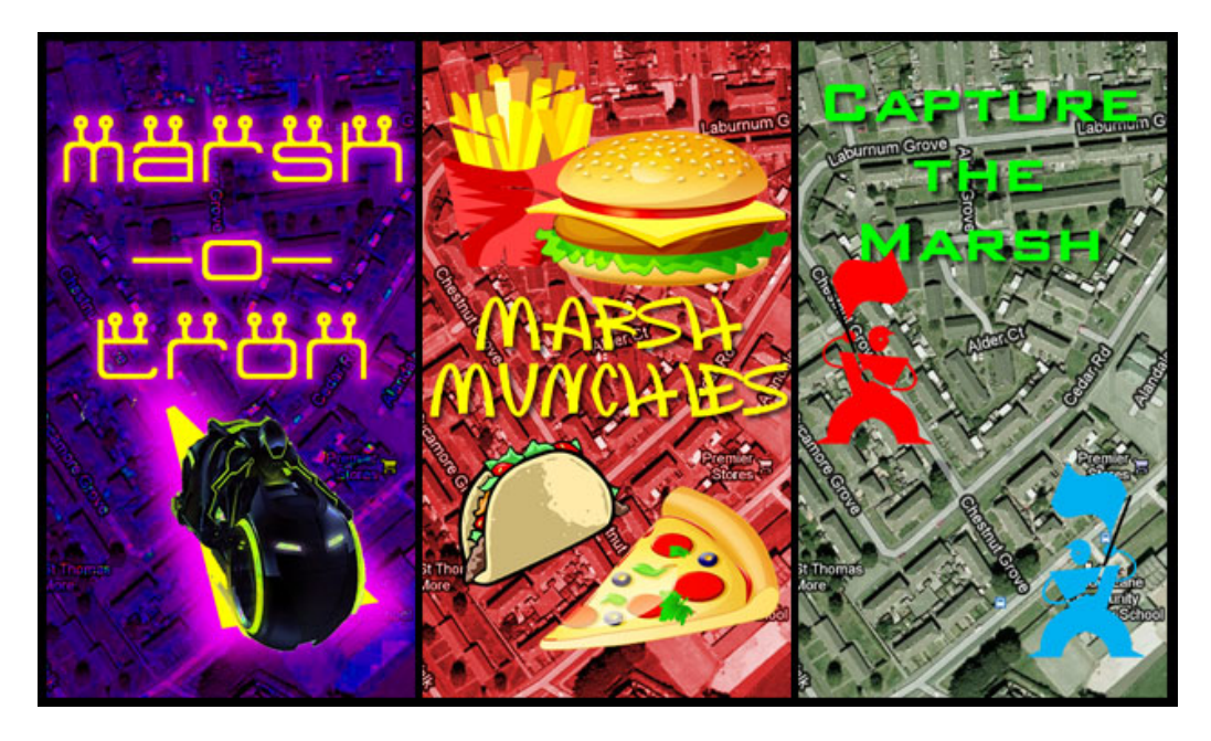
Figure 2: Participants mobile game prototypes (left to right) marshOtron (a), Marsh Munchies (b) and Capture the Marsh (c).

The first game the group came up with was 'Marsh Munchies' (Figure 2b), where the player would move around hunting for food items that randomly appeared on the game map in an allotted time limit. The second game was a variant of Capture the Flag (Figure 2c), which many of the group had played and dubbed 'Capture the Marsh', whereby two teams would have a base in each half of the map and players from the opposing team would have to capture their opponent's base undetected. Note some members of the group had already played their own analogue version of the game. The final game 'marshOtron' (Figure 2a), was inspired by the movie Tron Legacy, which had just been released at the time of the study and attempted to recreated the light cycles games from the movie, in which players would move around the arena creating a light trail, which, if crossed by other players would end their game and the player with the longest trail at the end would win the game.