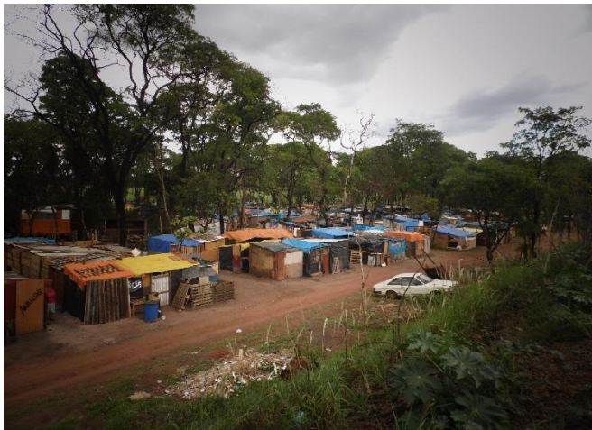
Figure 3 and 4. Rural workers supplying cane to Raizen Maracaí and a camp with former and current rural workers near Araraquara, São Paulo

The realisation of such initiatives invites and requires sustained technical and political engagement between these communities, researchers and policy makers willing to make an analytic shift and measure the viability and longer-term contribution of farming systems across a range of biophysical, economic and social indicators while no longer taking for granted the deeply uneven, globalised socio-political systems within which key stakeholders and shareholders are currently embedded in specific nodes and regions of production.