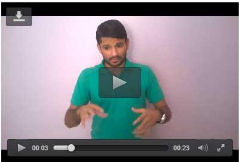
Figure 3: Screenshot from the glossary part of the SLEND

The contribution here is threefold: the word has a textual explanation in English including its grammatical category, followed by an illustration of the activity of flushing a toilet and a sign language explanation of flushing.