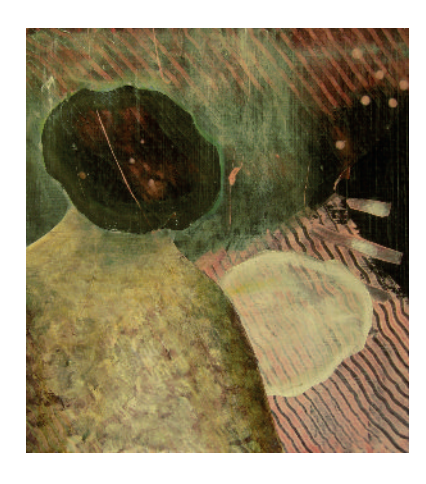
Whilst Olympia Sleeps, 2017, oil on canvas, 53 cm x 48 cm

In Orpheus (1950) Jean Cocteau presents an hypnotic example of the mirror's filmic potential. In this retelling of the Greek Myth, Orpheus is a poet who puts on a pair of magical gloves, which enable him to pass through a mirror into the underworld in search of his dead wife. We follow on through the camera lens. This unforgettable scene bridges our reality and a metaphysical world beyond the mirror. Cocteau's guardian of this underworld tells us of the inevitable loss that accompanies this transition, 'Two worlds struggle to coexist, the world of life and the world of death'.