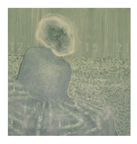
Dreaming Girl 3 (Infanta), 2017, oil on canvas, 79.4 cm x 76.1 cm

to a puzzle, he accepts that some paintings are a starting point for speculation with no possibility of completion. Paintings of this kind may require a different approach to looking at them, one that accepts that they cannot be read or understood in a logical framework and our