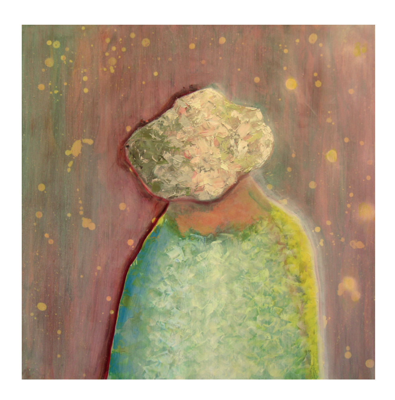
Dreaming Girl 5, 2017, oil on canvas, 78 cm x 77.5