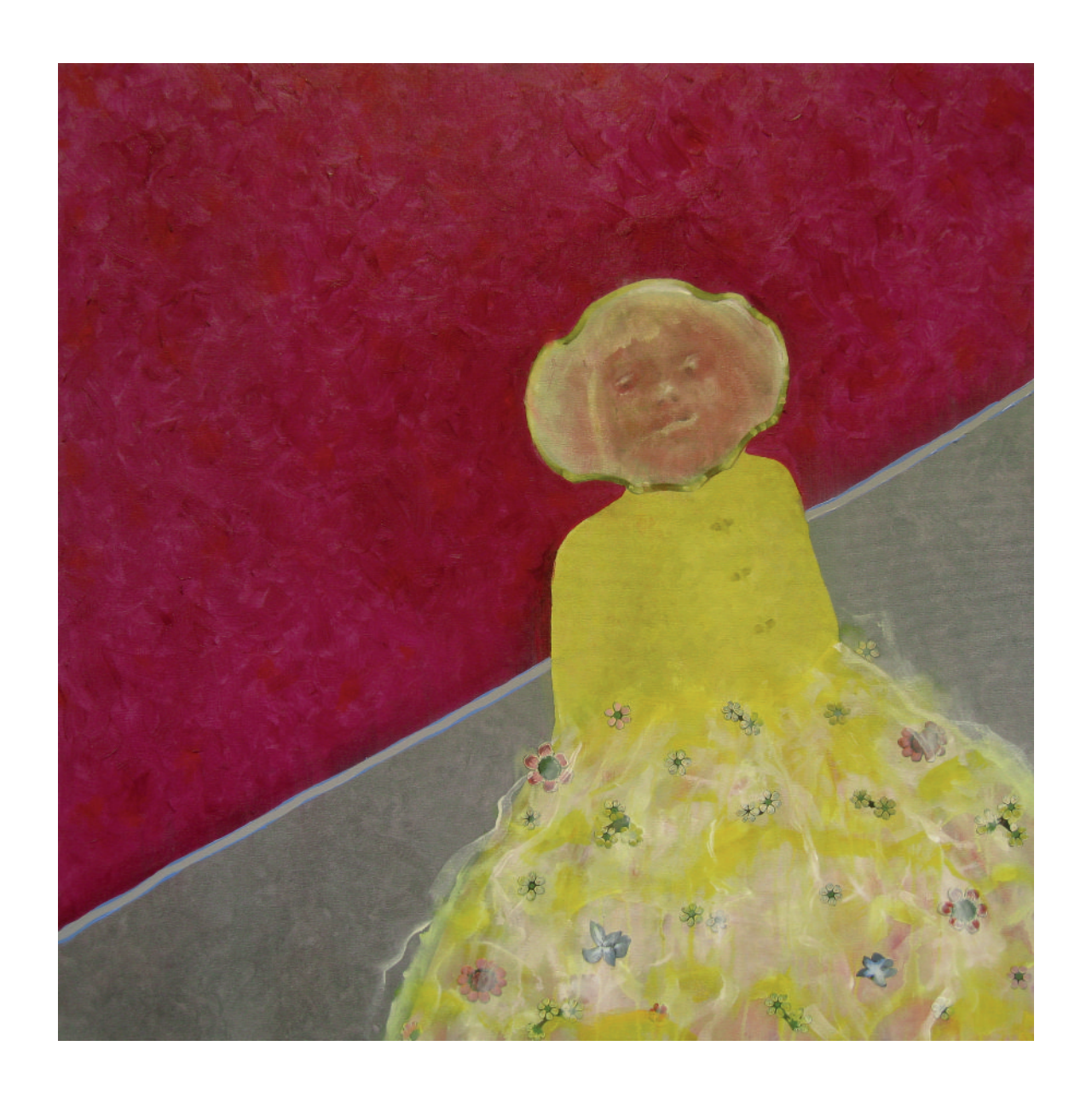
Dreaming Girl 1, 2017, oil on canvas, 90 cm x 90.5 cm