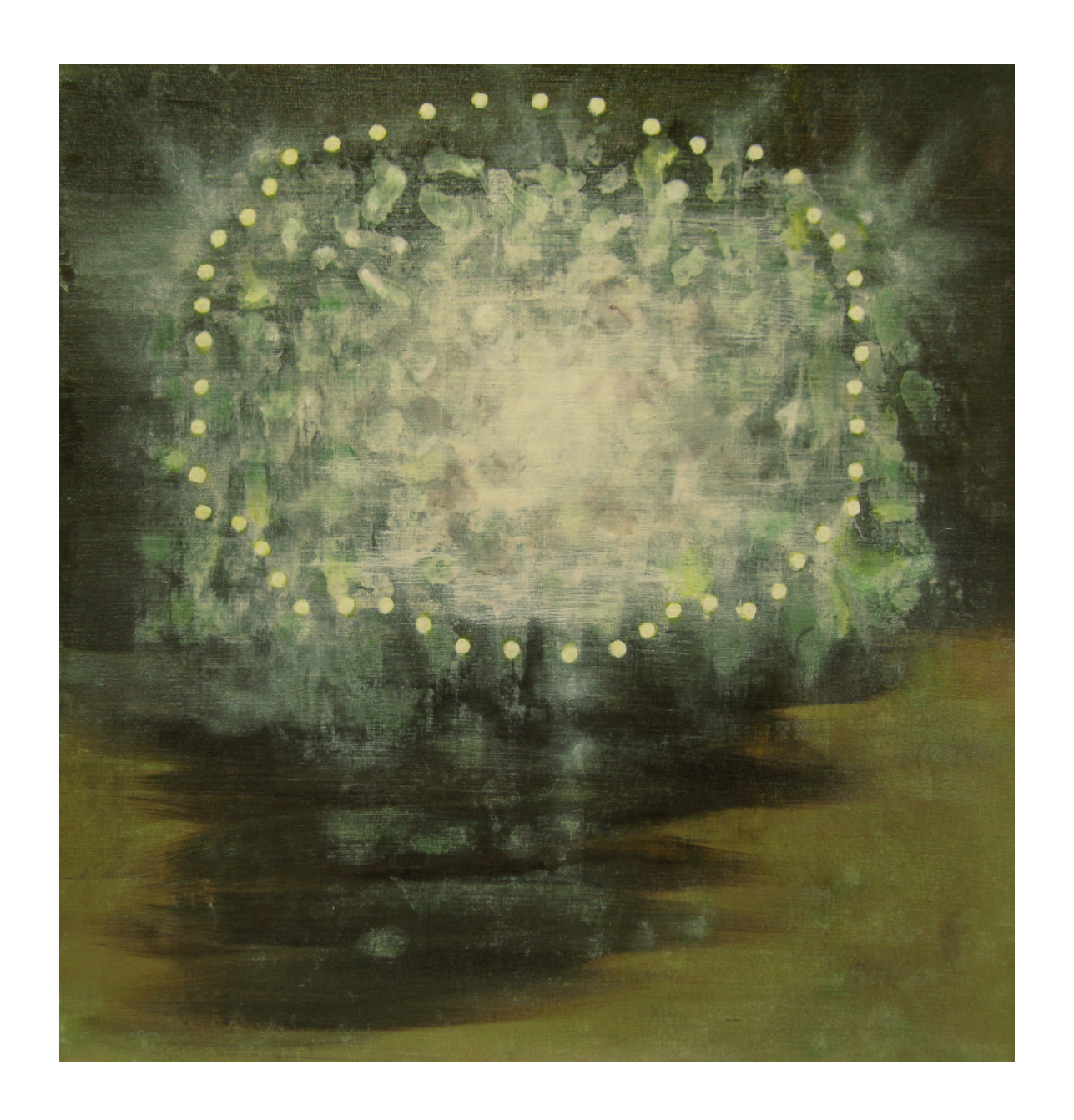
Secret Life of Mirrors, 2017, oil on canvas, 52.8~\mathrm{cm}~\mathrm{x}~50.1~\mathrm{cm}