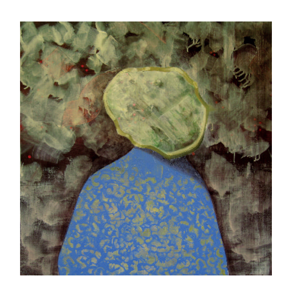
14 - 24 NOVEMBER 2017

THE STOREY GALLERY, LANCASTER, UNITED KINGDOM