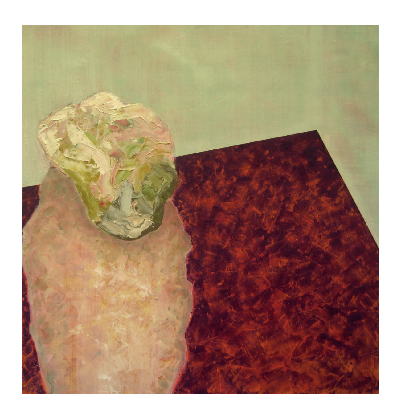
Mirror Head 2, 2017, oil on canvas, 78.5 cm x 76.5 cm