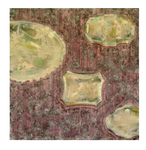
Family, 2017, oil on canvas, 79 cm x 78 cm

disappointment of self-reflection; in short, psychological other