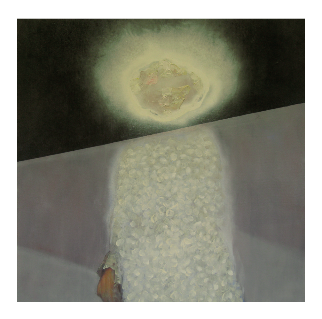
Dreaming Girl 7, oil on canvas, 92 cm x 91.5 cm