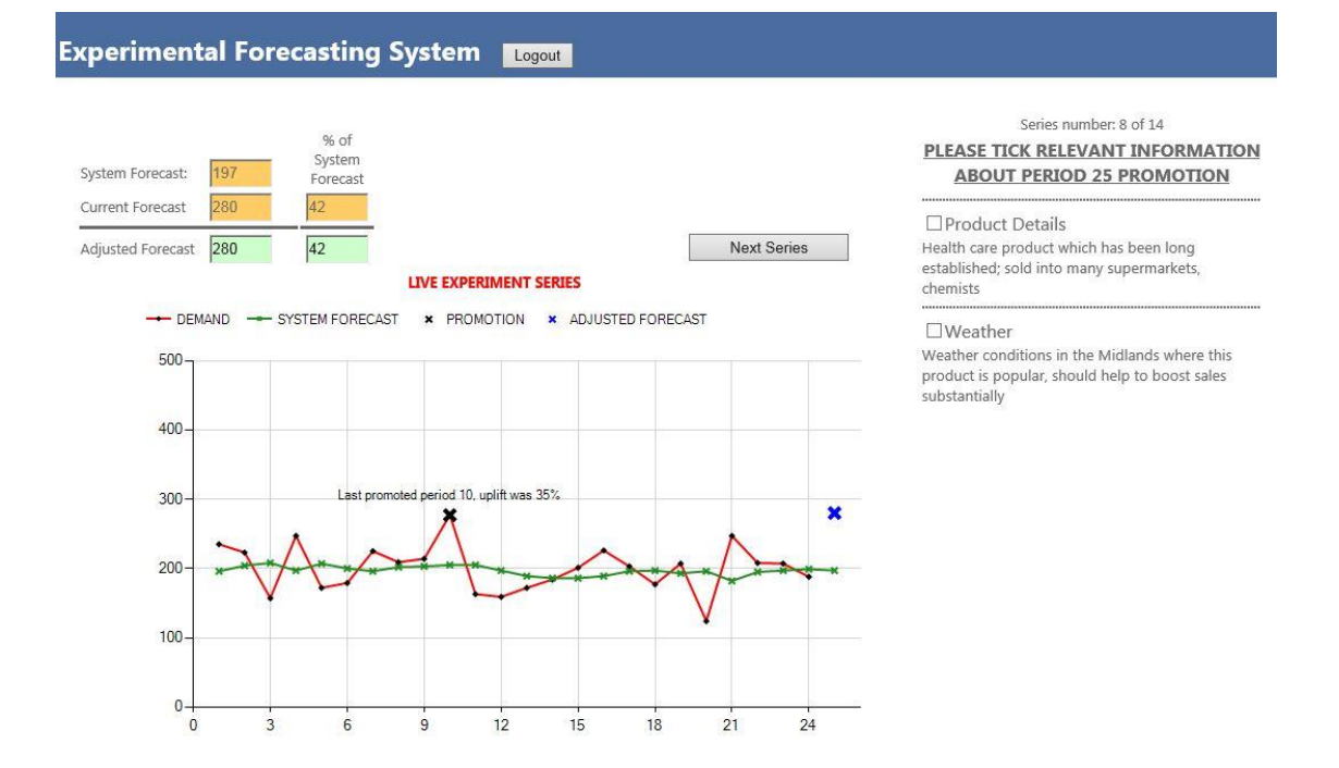
Figure 1. Screenshot of the experimental forecasting support system.

For each SKU, in addition to the historical sales series and statistical forecast, the screen displayed product details and between zero and four written statements which gave reasons as to why the level of sales uplift in the forthcoming promotional effect might be expected to be above or below the average ('positive' and 'negative' reasons). These reasons related to the amount spent on the promotion (e.g., "Over £1m is being spent on the promotion, double the usual size"), market research (e.g., "Focus groups have been quite negative about the promotional packs, but we can't change these at this late stage"), weather factors (e.g., "This product is mainly sold in the North where the weather conditions should be good for high sales according to the latest forecast") and campaign effectiveness (e.g., "We were hoping for a celebrity endorsement of our product as part of the campaign, but negotiations have not been successful and, unfortunately, we will have to run the campaign without this endorsement"), with a total of four reason types. These reasons were tested on nine experts for their plausibility and relevance to promotional events. A full list of the reasons is available in the on-line supplement. Half of them were positive and half were negative, with 12 in each category for each of the four reason types. The number of reasons displayed at any one time, the appearance of positive or negative reasons and the order of their