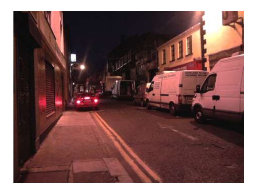
Figure 10 Trucks delivering goods to the wholesalers