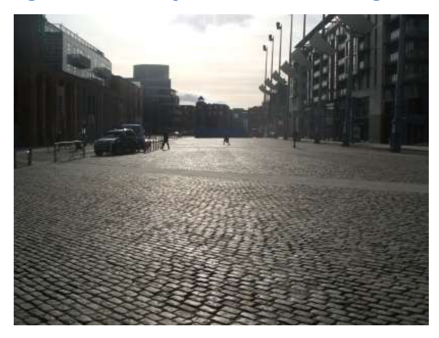
Figure 4 The Square complete on the 8th of February