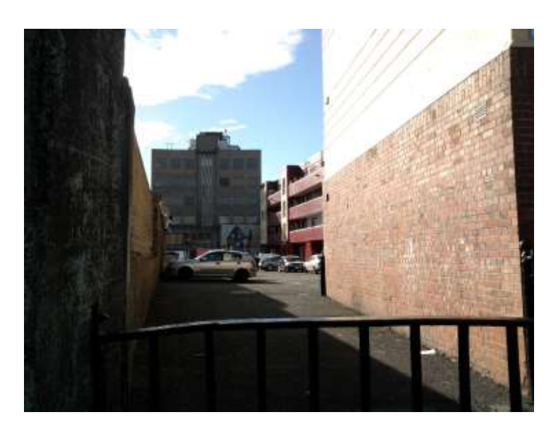
Figure 7 Social housing flats from the outside

Although they gave no specific reason the older participants were able to point out specific reasons why one wouldn't belong in an area, what job your parents had, what clothes you wore, and what you sounded like, your accent or way of talking.