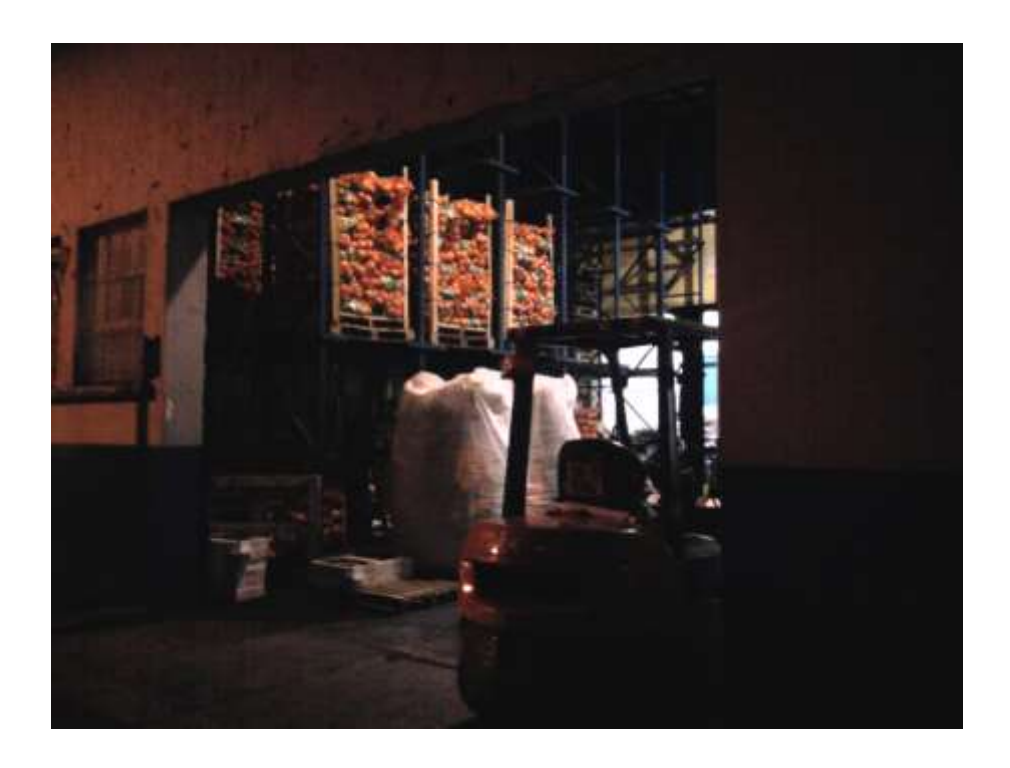
Figure 11 Crates of onions delivered to the market

Walking around the outskirts of these market streets without the buzz of activity was a slightly threatening experience. There were numerous demolished sites