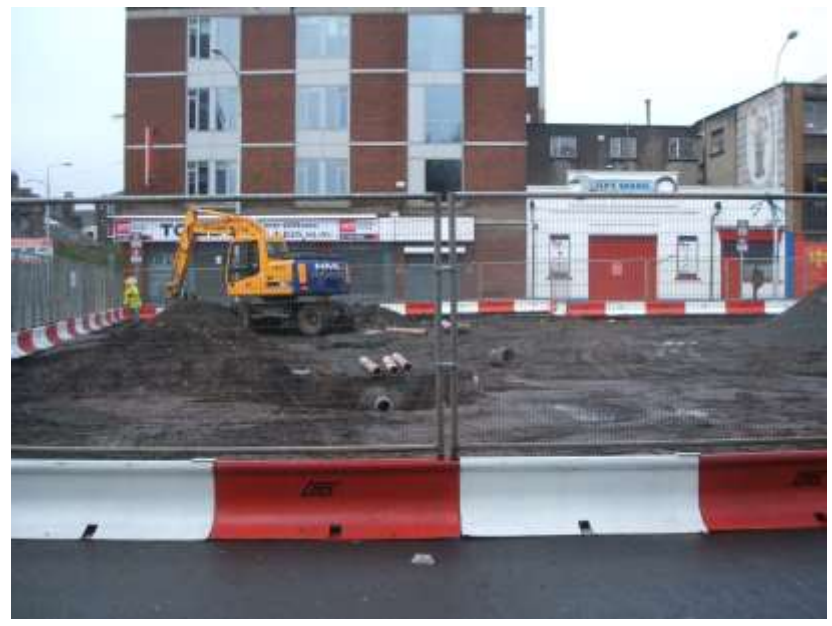
Figure 5 By the 17th of February 2011