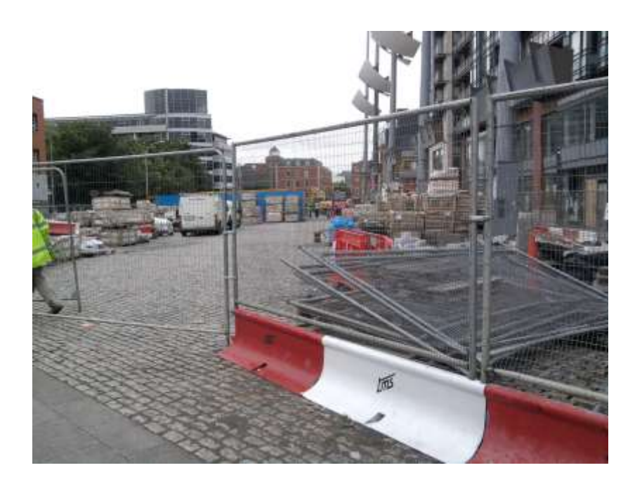
Figure 6 Still under construction 18th July 2011

The soundscape of Smithfield paralleled the design, the sounds of construction overlaying every other sound, and in the evening within what was a very quiet space you would hear the shouts from groups of addicts or homeless who would gather in and around the square, mixed with the sounds of bicycle bells - the sounds of emergency service vehicles - the Four Courts was located at the south end of the square facing a police station where prisoners are held before sentencing. What was missing and defined by both the ethnographic research