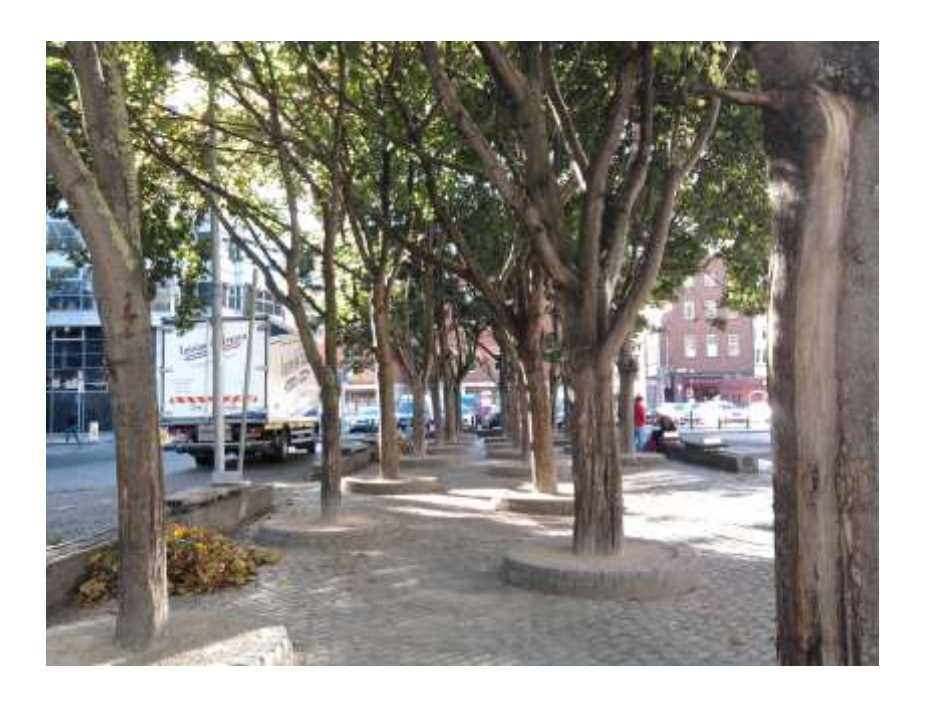
Figure 2 Trees at one end of the Market in 2010, knocked down later that year

The Smithfield square exemplified poor urban planning with public art works installed, removed and installed again, trees planted then cut down, benches added and removed, and finally oddly placed green spots, two Dublin Bikes racks, at both ends, and a small playground installed in 2013.