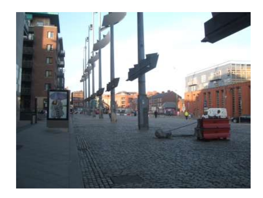
Figure 3 Smithfield Square under construction again, 2010