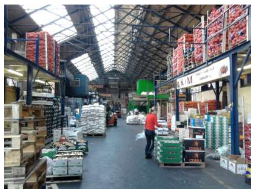
Figure 9 large indoor markets in Smithfield

From approximately 4am to 10am Greek Street, Mary's Lane and Little Green Street began to fill with the soundscape of a market. The sounds were that of pallet trucks rumbling along the cobblestoned streets accompanied by a constant beeping as they reversed in to warehouses, boxes banging onto the ground, the cacophony of men's voices talking in several languages shouting orders and instructions, shutters being opened and closed, seagulls screeching above as they waited to dive bomb fallen food. This was accompanied by the smells of fish, fruit and fresh flowers, essentially the rhythm of a busy market.