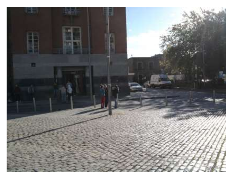
Figure 13 Outside the youth courts in Smithfield square