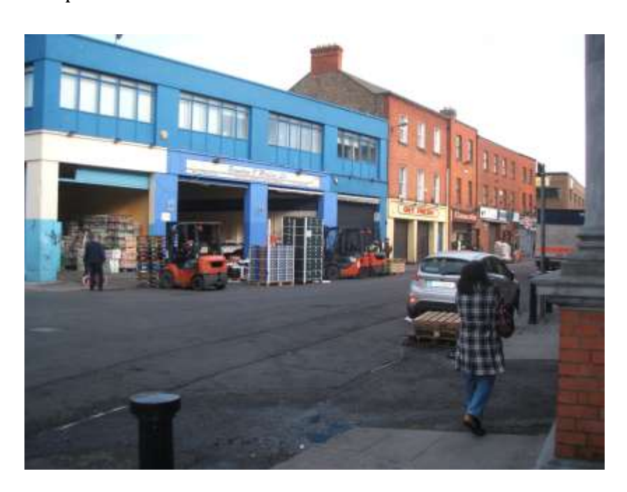
Figure 8 Market area Smithfield 2011

As discussed above the soundscape that stood out and made Smithfield, for a few hours in the day, unique, were the sounds produced within the wholesale markets. According to both the older participants and the documentary film maker Joe Lee whose film Bananas on the breadboard (2009) explored the history of the Smithfield markets, this is a radically reduced market space compared to what it was in the 1960s and 1970s.