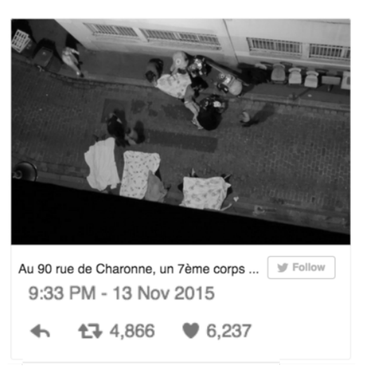
Figure 2. Mobile phone video Paris

Figure 1. Networked Communications