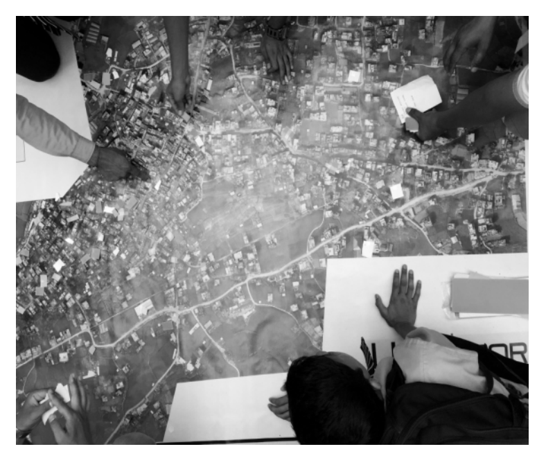
Figure 4. Local experts map local knowledge in collaboration with crisis mappers in Kathmandu.

Recent networked humanitarian efforts include collaborations in Kathmandu, Nepal, where communities added local knowledge 'about the location of debris, temporary shelters, drinking water' to crowdsourced 3D crisis mapping models of the 2015 earthquake damage via paper printouts (Meier 2015, Figure 4) and Facebook's implementation of a 'Safety Check' feature, which had initially been designed and used for natural disasters. In response to the Paris attacks over 4.1 million people checked in as safe -- for their family and friends to see -- within 24 hours (Breeden 2015).