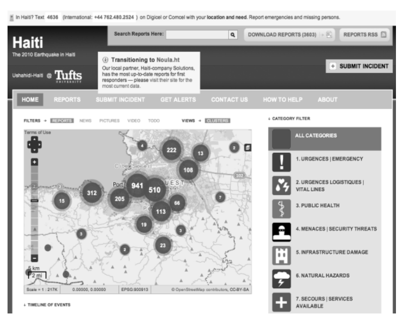
Figure 3. Ushahidi Haiti Map for Port au Prince, January 2010