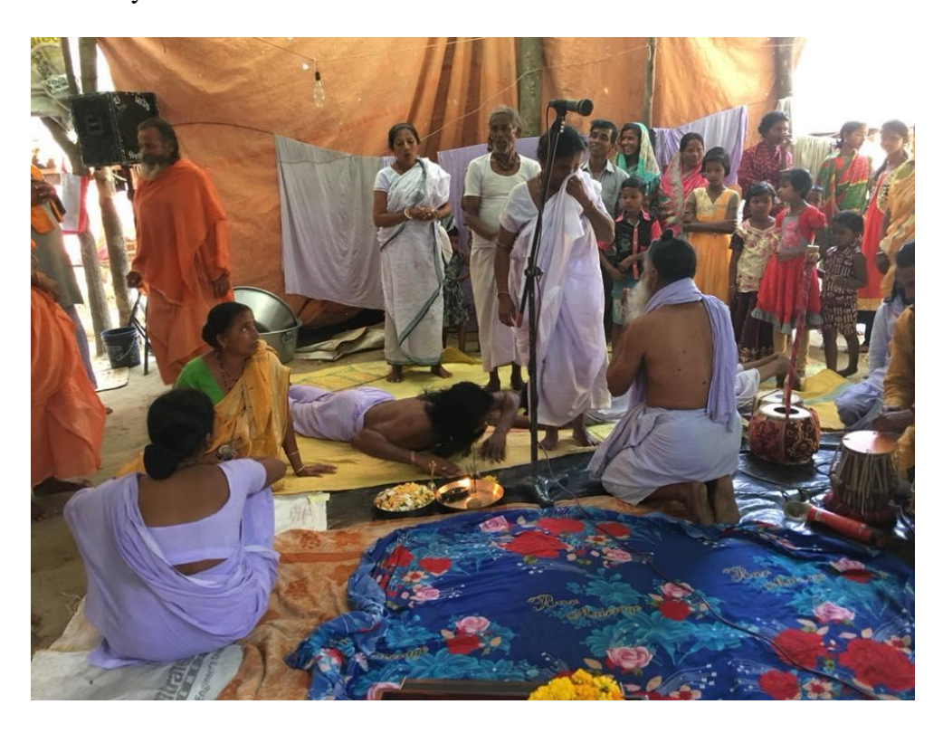
Figure 6.3 Paying Respect; the senior male guru pays respect to his guru sister

feast, female renouncers in the Vaishnava tradition always get an invitation and they contribute actively to sadhu sevas .<sup>24</sup>