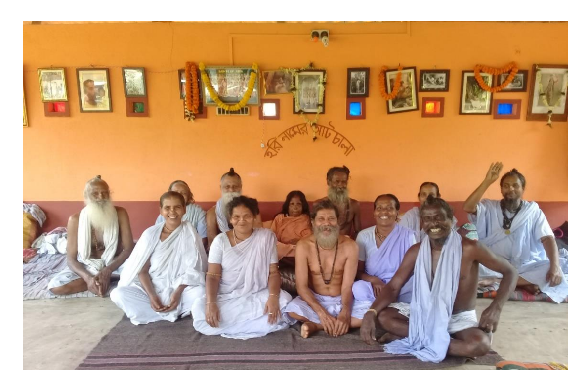
Figure 3.1 Sadhus of Birbhum community

two sadhus in the community. However, these irregular sadhus can be regular members of other sadhu communities and may potentially become regular members of the Birbhum community. Initially, sadhus may only gather together with those of their own lineage, but that lineage may grow and bring in members of other lineages due to geographical closeness, and they may later form a broader sadhu community. <sup>13</sup>