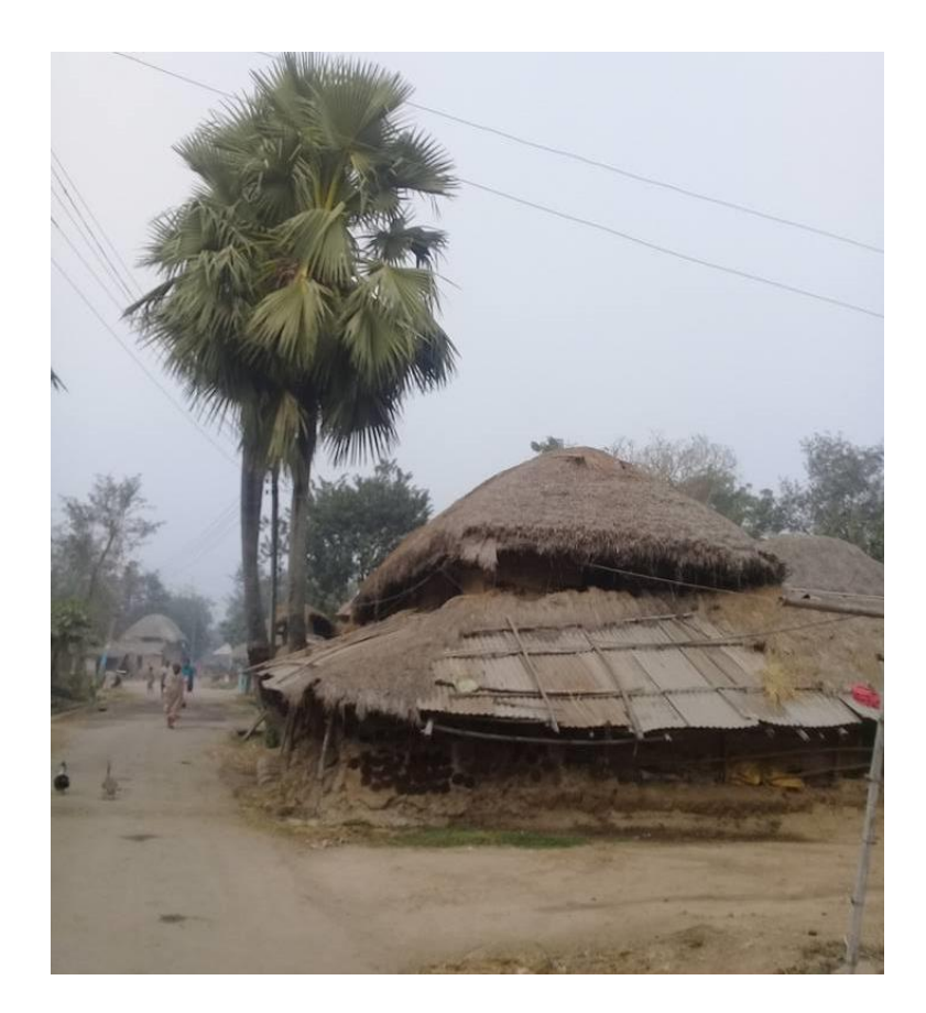
Figure 3.2 Village in the morning

Villages such as Bataspur (MD Baba and SW Ma' ashram), Albanda (GS Baba MG Ma), Kopai (ND Baba and ML Ma) shared some characteristics in terms of diversity of occupations. Bataspur is located about a 30 minute-walk from the main train station. Villagers have different careers and caste affiliations. They are day-labourers, farmers, shopkeepers, clerks, tutors and school teachers. Overall, this village is considered to be richer than Maitirra, and many houses had two storeys, built in brick and concrete, and painted different colours. When MD Baba organised a feast, he usually received cash as well as rice grains, which implies that donors were both farmers and non-farmers.