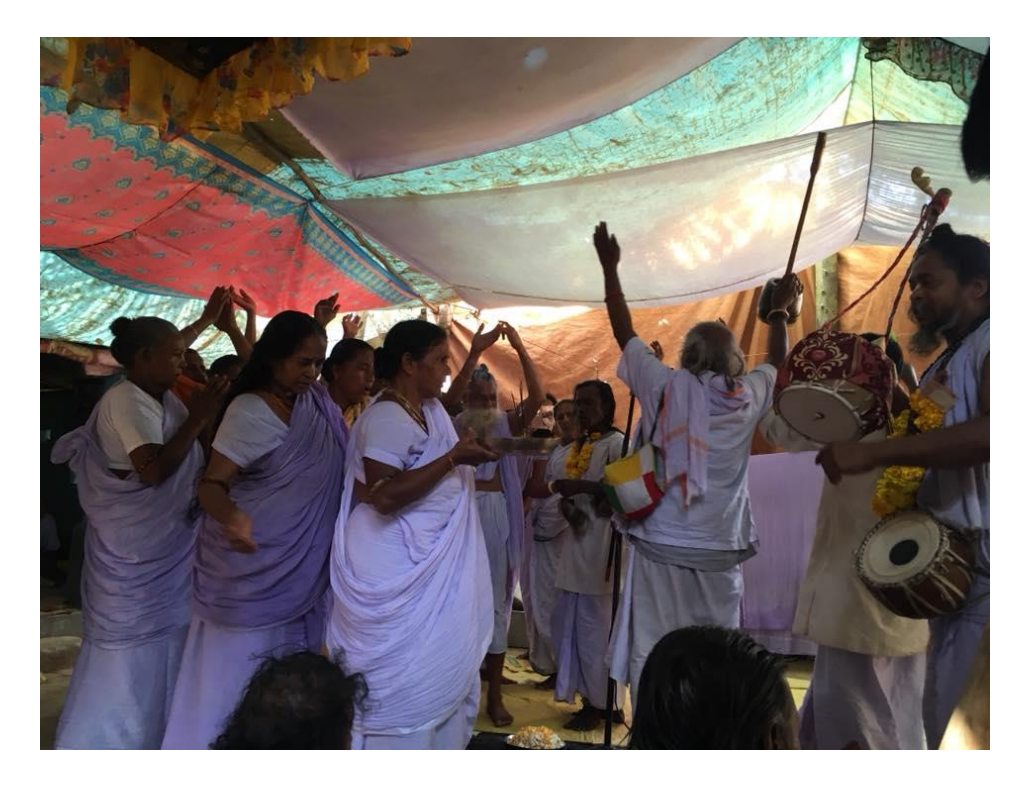
Figure 6.2 The peaceful day; dancing with Radha and Krishna

After the dancing, all the sadhus and devotees have lunch, which is always a fish dish. Lunch on the third day is usually the last meal provided by the hosts. They told me that fish, the most expensive ingredient, is served by the hosts to show their appreciation and gratitude to their guests. After finishing lunch, sadhus take a nap, and then set off back to their ashrams in the evening. Before leaving the ashram, the hosts give all guests dakshina , a return gift offered to guest sadhus. Dakshina consists of money and/or garments. A high amount of dakshina , the hosts can lose face, especially if they are a senior sadhu couple. It is worth noting that the meaning of dakshina has been changed from time to time. However, the most common meaning is that of a 'service fee' for