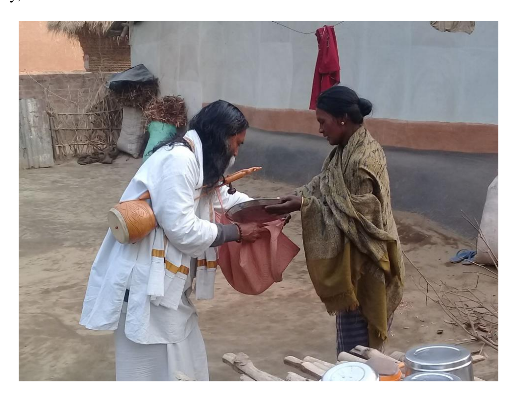
Figure 5.1 Offering alms

seasons. They store 'gifts' from alms collection and sell them for money whenever necessary, cook their own meals and host feasts.