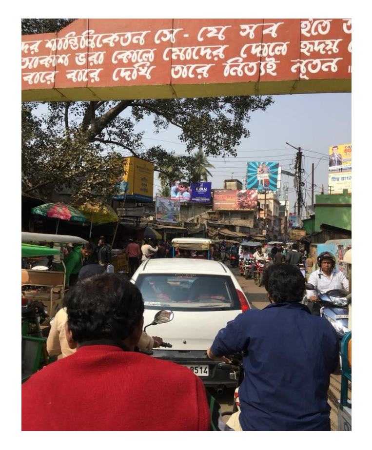
Figure 1.2 Bolpur town, the entry to Santiniketan

the 'Santiniketan Express', which takes about three hours to Kolkata. This train is outstanding as it is decorated with Tagore photographs and paintings, it also spellbinds its passengers with Baul songs sung by Baul mendicants, who ride the train to collect alms from passengers. In Santiniketan, there are educational institutions spanning from preschool level to higher education. Visva-Bharati and Sriniketan are notable institutions in Santiniketan, providing spaces where local and global students and researchers meet and learn from each other. The learning environment that Santiniketan provides to the world is unique and it replicates the Indic learning tradition, in which learning, living and the natural environment are intertwined. The place itself has produced many international figures, such as Amartya Sen, Indira Gandhi and Satyajit Ray.