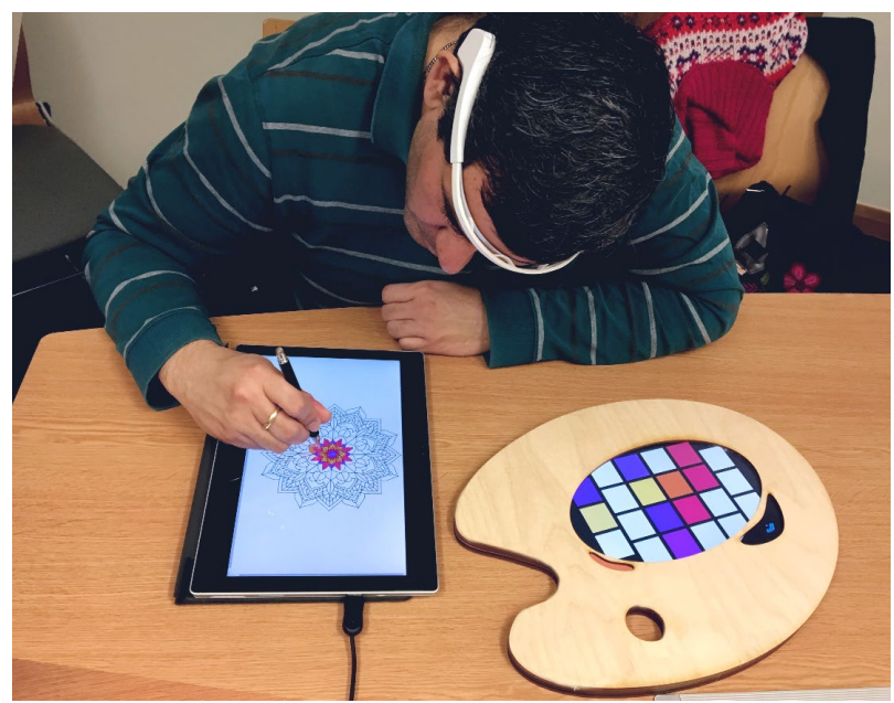
Figure 2. A person using Anima: while wearing the EEG headband, colors based on the current mental states are generated on the wooden palette and can be used to color the digital mandala.

This training intervention will be carried out in the homes of eligible, consenting participants. Participants will be asked to color a mandala using Anima (Figure 2) three times a week, as described below, in (a) their preferred quiet space in their house, (b) during the evening if possible (i.e. after work or other daily routines).