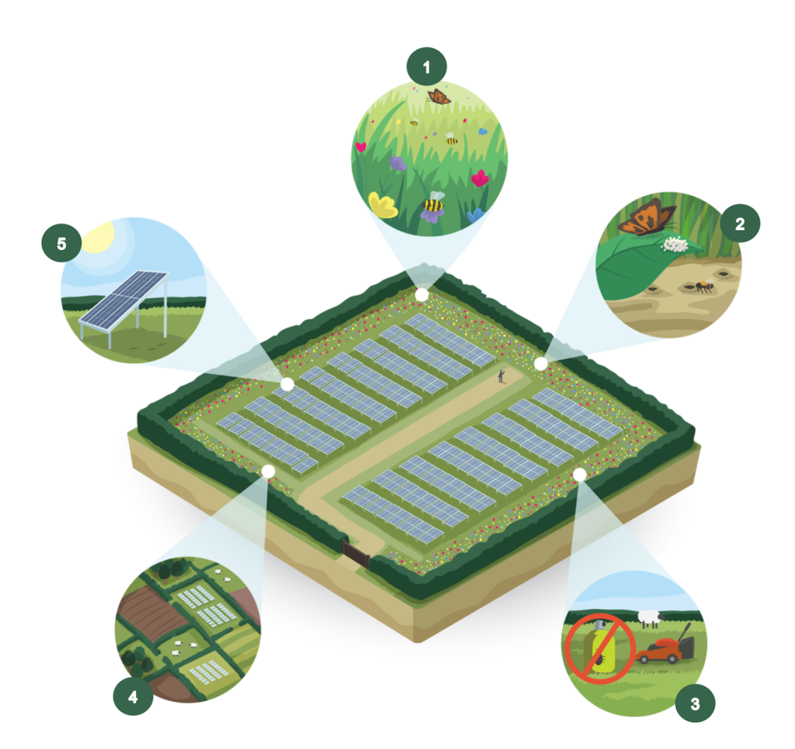
Figure 3. Illustration depicting the potential for solar parks to enhance pollinator biodiversity through (1) providing foraging resources, (2) providing nesting, breeding and reproductive resources, (3) undertaking suitable management practices, (4) increasing semi-natural habitat in the landscape and promoting connectivity and (5) generating microclimatic variation on solar parks.