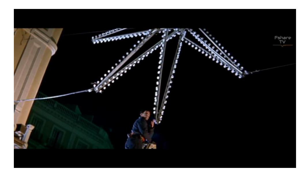
Figure 6. A municipal worker looks towards the sound of a woman's screams