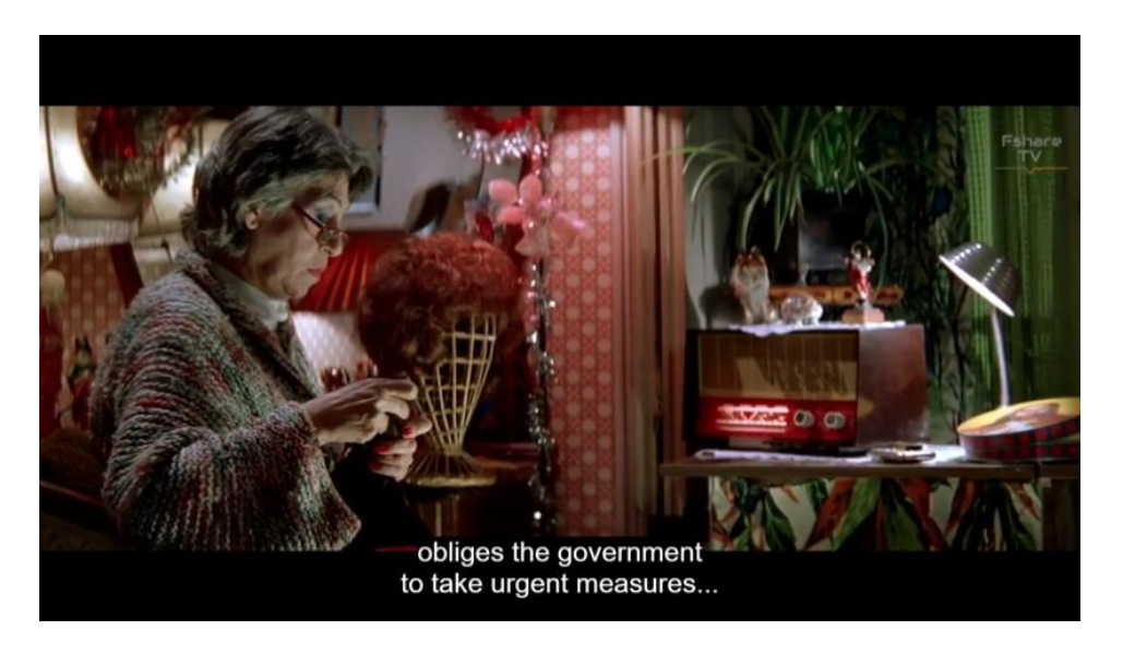
Figure 8. Madam Centro listens to the radio

As emphasised throughout this opening sequence, the state of exception was presented as necessary to preserve 'peace', a message that was hammered home when labelling the twenty-fifth anniversary of the war's end as '25 years of peace' in 1964. The celebrations, which included exhibitions, publications, posters, festivals, and films, glorified the country's accomplishments under the benevolent guidance of its patriarch, the aging Caudillo. The campaign deployed all available media to reinforce the union of the country and its autocratic ruler through 'banal nationalism', in Michael Billig's definition of the concept. This reductive view homogenised society through idiosyncratic cultural identifiers, the most prominent of which were bullfighting, football, flamenco dancing and the ritual commemorations of the Catholic calendar, such as Holy Week. It also alienated others, in accordance with the state of exception exclusion of 'categories of citizens'.