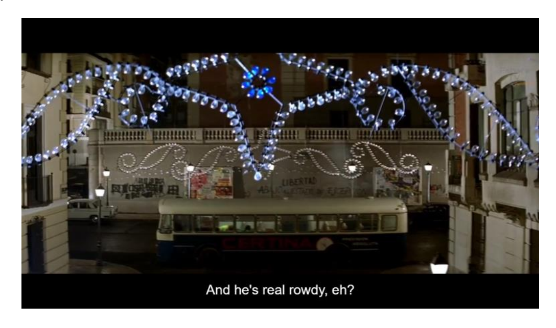
Figure 9. The bus is framed between Christmas lights and graffiti

women travel stops as Isabel breaks waters and we hear the diegetic voices of the women inside the bus. A crane shot that zooms in towards the bus frames it against a wall in which graffiti calling for 'freedom' ('Libertad') can be read (Figure 9). To emphasise the message, after Isabel delivers the baby the bus exists the frame to reveal the message in full, with the camera lingering a few seconds on the words 'Down with the state of exception' (Figure 10). The graffiti's misspelling the word 'excepción' as 'escepcion', reflecting its pronunciation, corroborates the socio-political dimensions of Spain's 'illiteracy', linking it with Isabel's 'inability to count'.