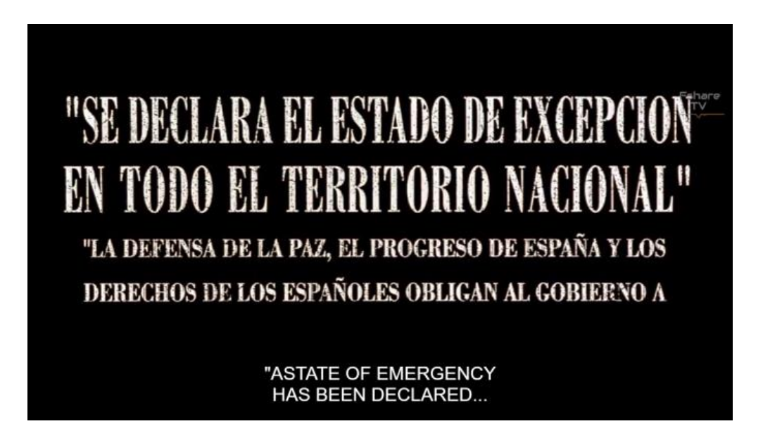
Figure 1: On-screen credits declaring 'State of Exception in All National Territory'

arrests, the trial's preparation, proceedings, and eventual sentencing led to the intensification of protests within and beyond Spain, resulting in the eventual commutation of the death penalties for lengthy imprisonment. As the regime's opposition widened geographically and socially, it was countered with the extension of the state of exception to the whole country, as seen at the onset of Live Flesh . This state of exception effectively returned the country to levels of repression reminiscent of its immediate post-war environment and is evoked with suitable darkness in the credits, set against a black background. The first frame transcribes literally the words of the declaration in large capital letters with the putative reasons explained in smaller font below (Figure 1):