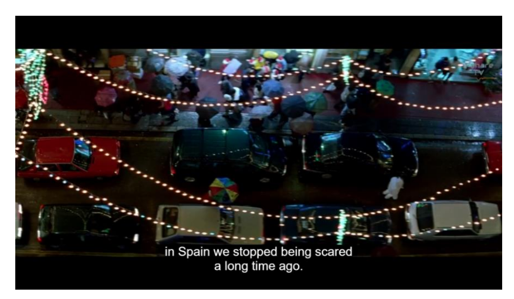
Figure 13. Live Flesh 's note of hope

While Victor comforts Elena, he addresses his unborn child, who, he reminisces, is 'in the same situation' that he was but whose world is unlike Victor's, when people were 'scared shitless' under state of exception. Their child is 'luckier', he adds, because Spanish people are no longer afraid, and the 'difference' can be seen in the colourful crowd in Madrid, the capital and epitome of his country. A fast tempo non-diegetic piano tune underscores the joyfulness of the present and the hope for the future (Figure 13). The blunt message of the film's bookends was remarked upon by the director, who explained away his prior silence as a form of 'revenge' on the dictatorship: 'I had not made such a direct comment about Francoism until now ... The beginning of my cinema denied Franco's presence, but I recover its memory here in a very concrete, punctual manner'. Although, as Almodóvar remarks, to pretend that the past had not existed could be classed as a form of retribution, it is also a form of acquiescence that populates the present with 'ghosts', as seen in Volver .