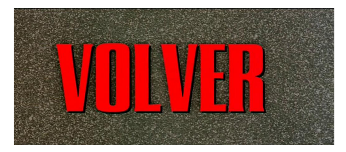
Figure 15. A wipe introduces the film's title