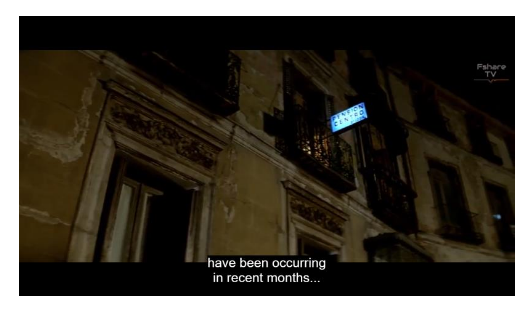
Figure 7. The camera identifies the origin of the screams in Pensión Centro