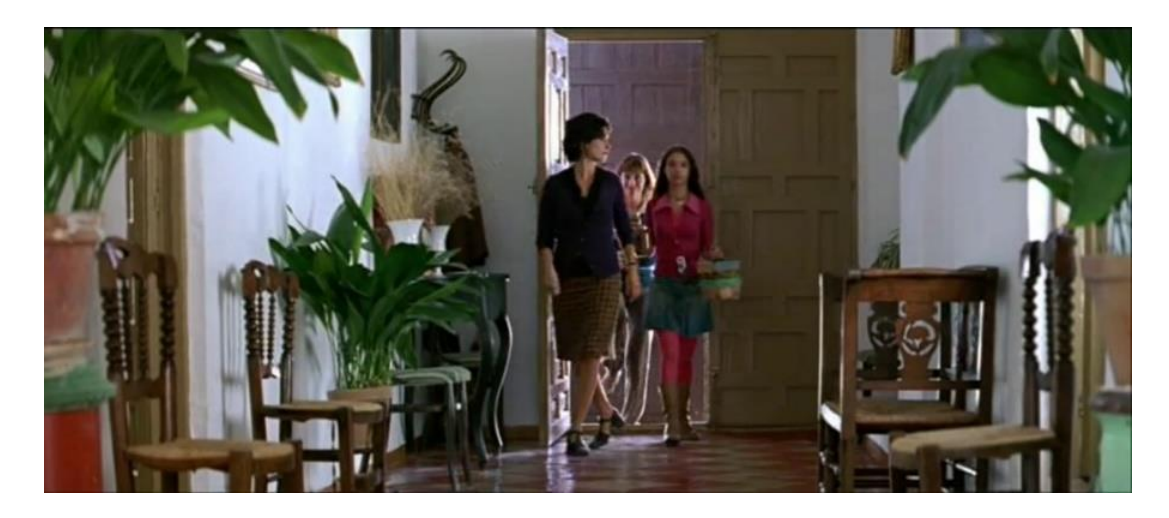
Figure 30. The house as women's space