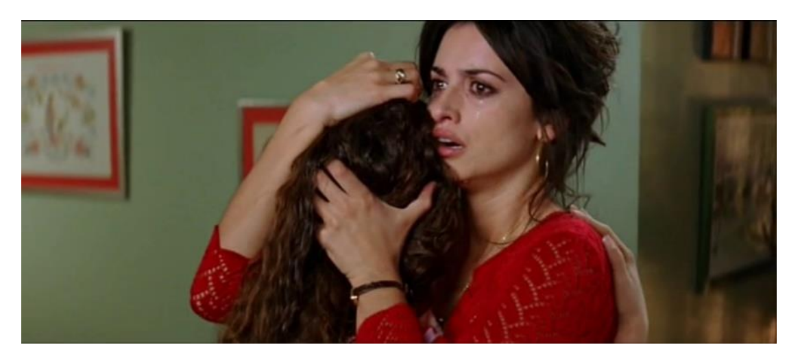
Figure 27. Raimunda comforts Paula

By contrast with Irene, then, Raimunda straddles across between two generations: one for whom abuse was an immanent part of life and another who is equipped to challenge it. Thus, while Raimunda suffered abuse herself, she never hesitates to offer her full support to Paula, to the point of assuming agency for her murder (Figure 27). The generational gap is closed by Paula's murder of her intended abuser, which contrast sharply with Irene's unconscious complicity and Raimunda's victimhood. Paco meets Paula's active resistance and is murdered with a knife that we had seen Raimunda cleaning in an earlier scene when a perpendicular shot had aligned it with her cleavage. Raimunda's breasts, a symbol of femininity and motherhood, are extended by the phallic weapon with which her daughter will defend herself (Figure 28). Thus, when extracting the knife from her husband's corpse, Raimunda places it before her eyes as a symbol of empowerment, with his blood replacing that of Paula's defloration (Figure 29).