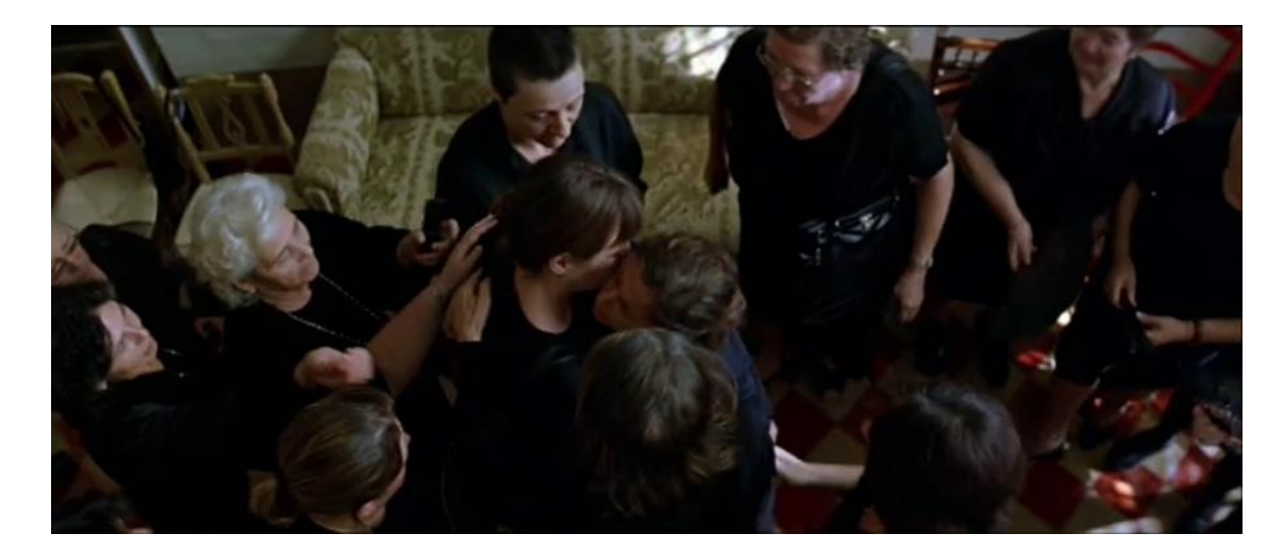
Figure 21. The women kiss Sole