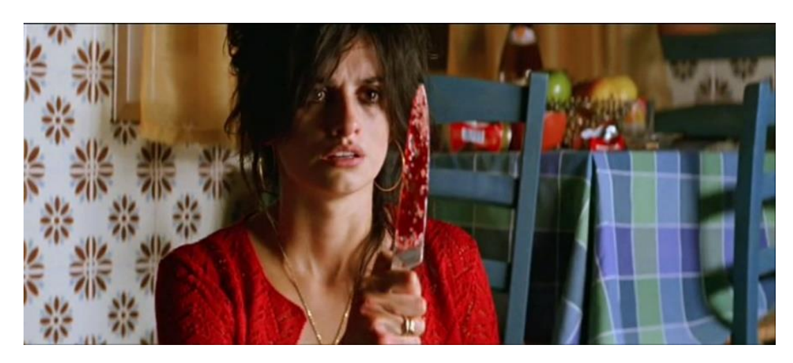
Figure 29. Raimunda contemplates Paco's blood

While Paula and Raimunda are capable of 'handling' a masculine weapon, the camera's fixation on Raimunda's breasts in relation with the knife is as much a celebration of her body as an objectification, especially given the fragmentation of her anatomy. This constructs Raimunda as an object of desire for viewers, very much in line with the universalisation of the masculine cinematic gaze analysed by Laura Mulvey.<sup>30</sup>