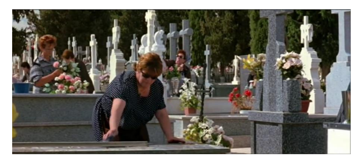
Figure 14. Women clean and decorate tombs

power. In this vein, the song alludes to God willing the never-ending work of the gleaners who, grudgingly but cheerfully, accept their fate, as indicated in the coda: 'Aye, aye, aye, aye! The Lord commands so much work!'.