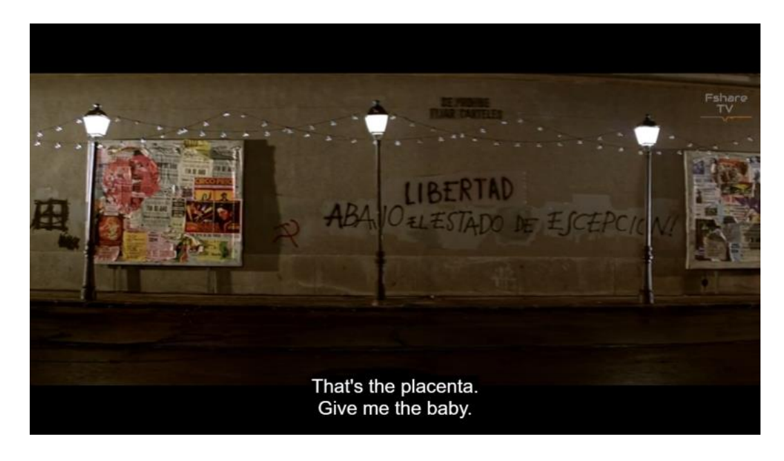
Figure 10. Graffiti linking illiteracy with opposition to the regime