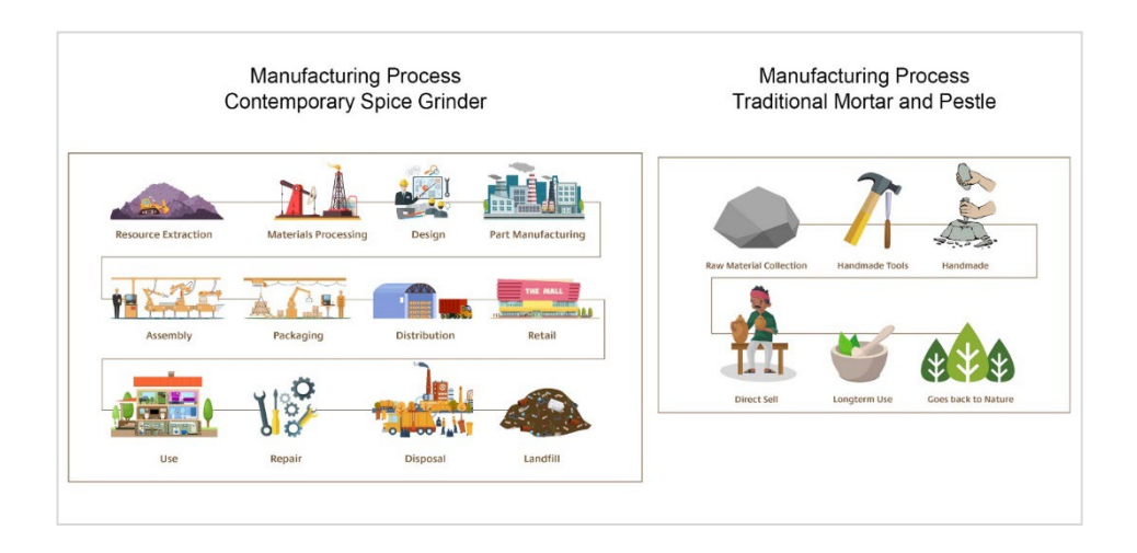
Figure 3 Manufacturing process of contemporary spice grinder and traditional mortar and pestle.

consumed during all life cycle phases of the product, which generates hazardous waste and pollution [24,25]. Furthermore, the difficulties associated with recycling complex electrical products often results in landfill disposal [24]. By contrast, the traditional mortar and pestle emerges from a far simpler, less resource intensive process. Tables 2 and 3 summarize our analysis of the contemporary spice grinder and the traditional mortar and pestle using the lens of Walker's QBL [11].