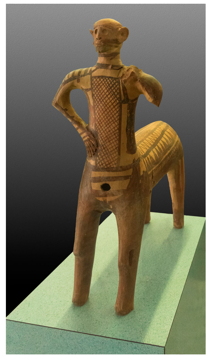
Figure 1. The Lefkandi Centaur, c. 1050–900 BC. Terracotta. Archaeological Museum of Eretria.

A critical point I wish to note is that the emergence of literacy does not mean a society in which everyone is reading books. Rather, it is a society which has built up language to an extent whereby the surrounding world is navigable, logical and approachable without the trauma of 'the thing in itself' emerging at every turn (this is why Worringer adopts the term). This is an essential point: that someone who cannot read and write can still be 'literate' in the sense of being immersed within a literate culture,