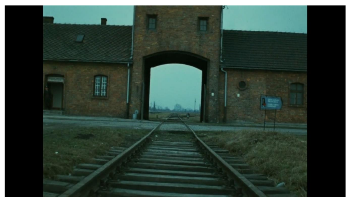
Figure 2.16: Shoah. The tracking shot now approaches the gate entrance.

the failure of representation. Throughout the nine-and-a-half hours, Lanzmann battles with both the need to bear witness and the clear limits to testimony, thus the event is presented even if it is not possible to bear witness to it. This is what the gatehouse becomes representative of: a sharp division between rolling up to the camp and passing under its borderline. The imagination of the viewer must take over by reminding the viewer of the failure of their imagination.