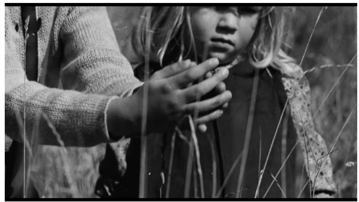
Figure 1.4: Pawnbroker (Sidney Lumet, 1964). First shot as young boy clasps hands together.

The opening scene of Pawnbroker uses a flashback to contextualise the loss the protagonist is suffering, setting up his character arc. The sequence opens to a black-and-white frame, with Quincy Jones' orchestral score contributing to the first frames of the film. An initial medium close-up shows a boy attempting to catch a butterfly as a girl can be seen resting in the background (Figure 1.4). The scene cuts from this shot to the two children making their way through a corn field in slow motion. In three more separate cuts the scene progresses from a medium close-up of the young children (Figure 1.4 and 1.5) to a panoramic shot of the idyllic countryside (Figure 1.6). These cuts leave a vast landscape shot of the summer sky that capture the Romantic notion of childhood as natural human innocence. Their presence merges with the landscape as the girl's hair blends with the wheat that grows from the ground (Figure 1.5), and together they become subsumed by the field (Figure 1.6). This Romantic setting establishes a tranquil environment without designating the scene's temporal dimensions or whereabouts.