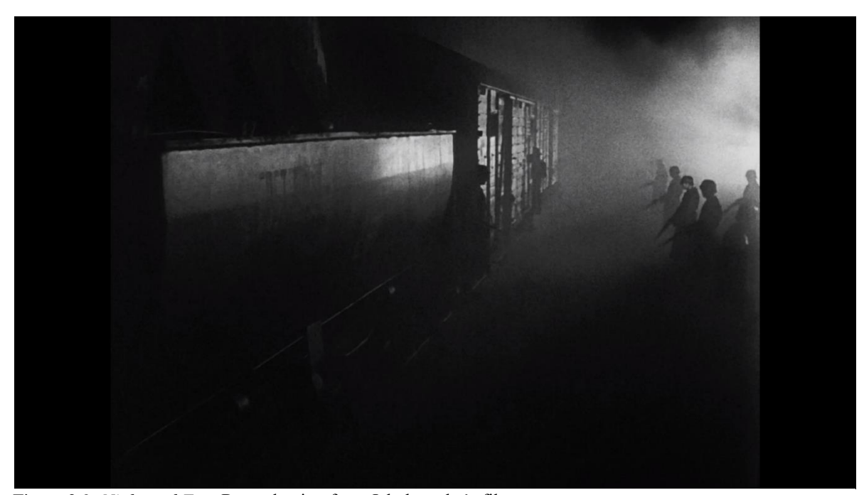
Figure 2.9: Night and Fog, Reproduction from Jakubowska's film.

While feature productions in the 1950s and 60s focused more on protagonist-led narratives, documentaries emerged that shed more light on the surroundings and purposes of death camps. One of the most important documentaries was Alain Resnais' Night and Fog (1956) that suffered much from censorship due to its inclusion of a French police officer. This was due to the fact that The French Board of Film Censors 'were afraid of insulting the authorities of the day, apparently unable to distinguish between the Vichy regime and the