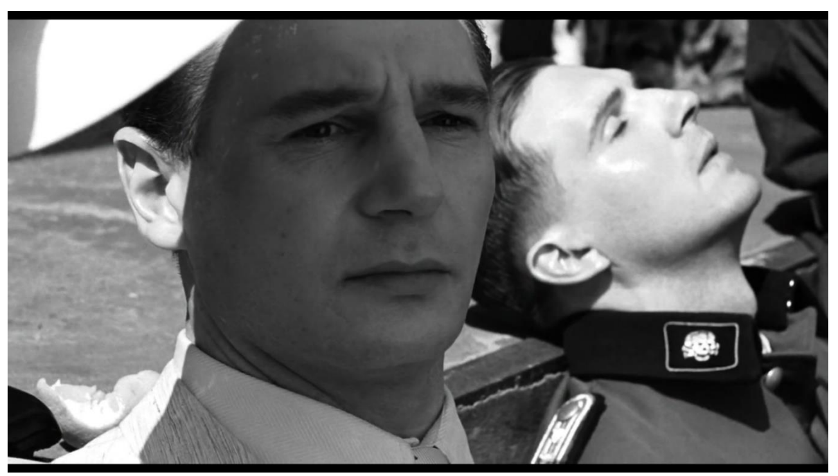
Figure 3.21: Schindler's List. Close-up of Schindler as he protects himself from the heat.