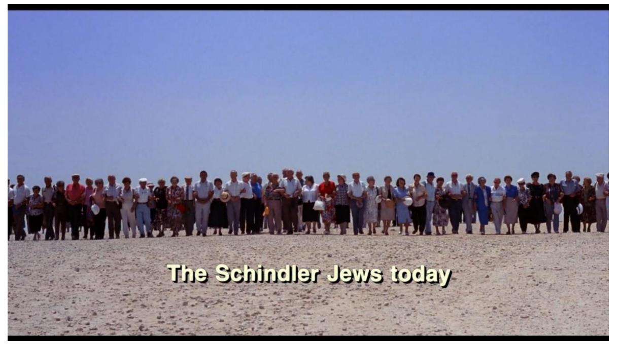
Figure 3.36: Schindler's List. The Schindlerjuden now in the present day as the dissolve finishes.