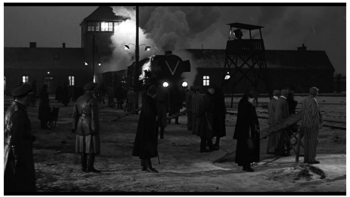
Figure 2.22: Schindler's List. The locomotive appears to enter the camp.

Lighting constructed in this way illuminates character faces and pre-empts the shot/reverse shot of Auschwitz, rather than using an establishing shot preceding the reaction shot as in War and Remembrance . When the camera does cut to an establishing shot there is a noticeable spatial discontinuity in the editing. Between Figure 2.19 and 2.20, the freight carriage carrying the women has already passed under the gatehouse and into the camp, whereas in the next cut the locomotive is yet to pull the carriages through (Figure 2.21). This technique of crosscutting is a prevalent tool for directing the viewer's attention, whereby separate shots are not temporally determined simultaneously. Greater emphasis, then, is placed on creating a composition in which the structure of the gatehouse, the front of the locomotive and the smoke as it begins to fill the top third of the frame all converge.