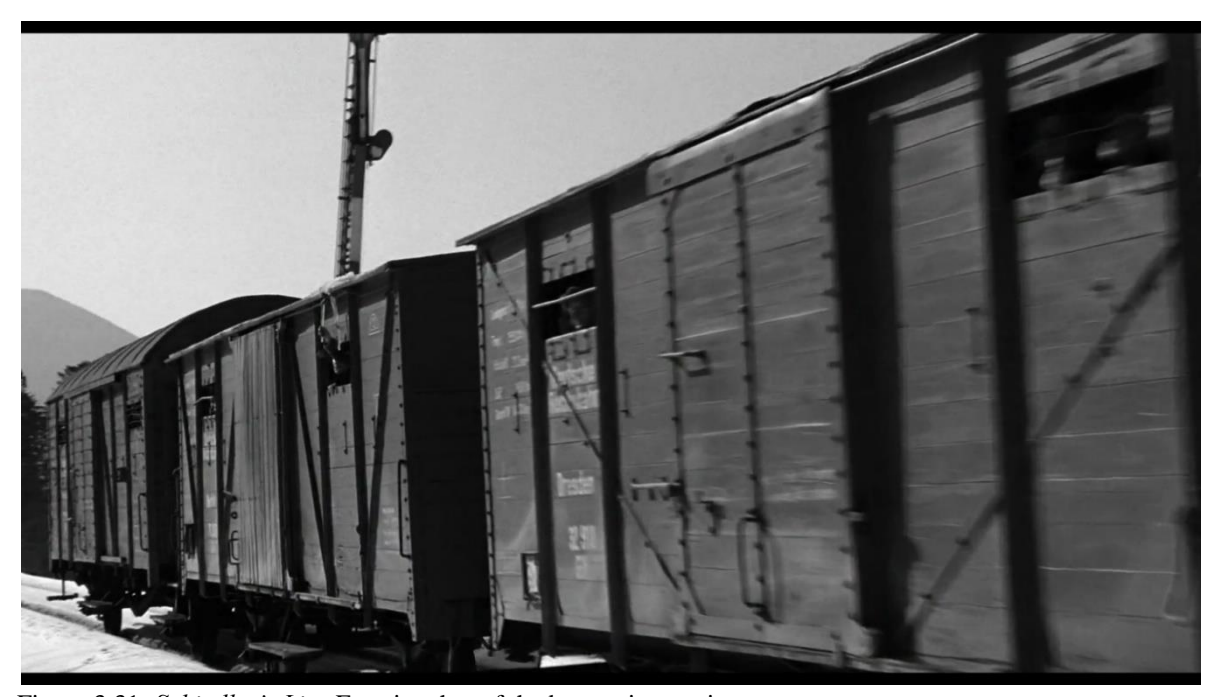
Figure 3.31: Schindler's List . Exterior shot of the boxcar in transit.