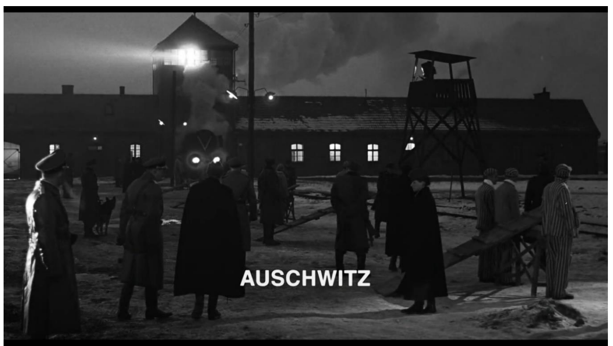
Figure 2.21: Schindler's List. Establishing shot of Auschwitz.