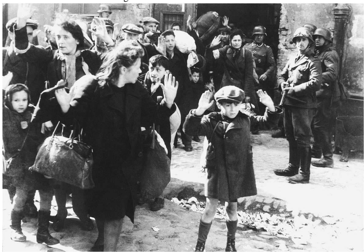
Figure 1.7: 'Jews captured by SS and SD troops during the suppression of the Warsaw ghetto uprising are forced to leave their shelter and march to the Umschlagplatz for deportation'. United States Holocaust Memorial Museum (USHMM) . Photograph Number: 26543.

reduced to rubble to the lining up of individuals to face a firing squad. However, in the entirety of this photographic album it was the image of the terrified little boy that would become not only the subject of debate but also the object of reproduction. The photograph began to appear throughout a variety of visual media, separate to its use as evidence in the Nuremberg trials.<sup>17</sup> Not only does this lead to its incorporation into popular culture and to questions of the prevalence of this compelling photograph over the others, but also raises the issues of why the focus of the image is directed towards the figure of the young bare-kneed Jewish boy with his hands raised in a surrender gesture.