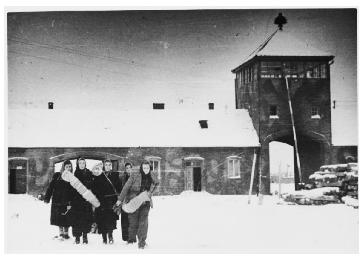
Figure 2.1: 'A group of Frenchwomen on their way to freedom. They have already shed their prison uniforms and put on clothes taken from burning magazines. Main gate is on the right'. Henryk Makarewicz United States Holocaust Memorial Museum (USHMM) , Photograph Number: 58416. (January 1945).

The first-ever photograph of the gatehouse was taken by Makarewicz in January 1945 (Figure 2.1). While not including the entirety of the gatehouse, this photograph still managed to capture its dominating presence. Due to the juxtaposition of the female survivors walking towards the foreground with the snow-covered gatehouse in the background, the image contributes to the Soviet archive of liberation. The caption provided by curators of the USHMM years after its development denotes the gatehouse as a backdrop to the survivors' departure: 'A group of female survivors of Auschwitz-Birkenau trudge through the snow as they depart from the camp through the main gate'. The original caption also references the main gate but underlines their path to freedom: 'A group of Frenchwomen on their way to freedom...Main gate is on the right'. With these five women fixed in a moment of departure and freedom, the image instils into the gatehouse its position as a threshold. In the very notion of freedom, of leaving the camp, the gatehouse stands as a façade that conceals the inside they experienced.