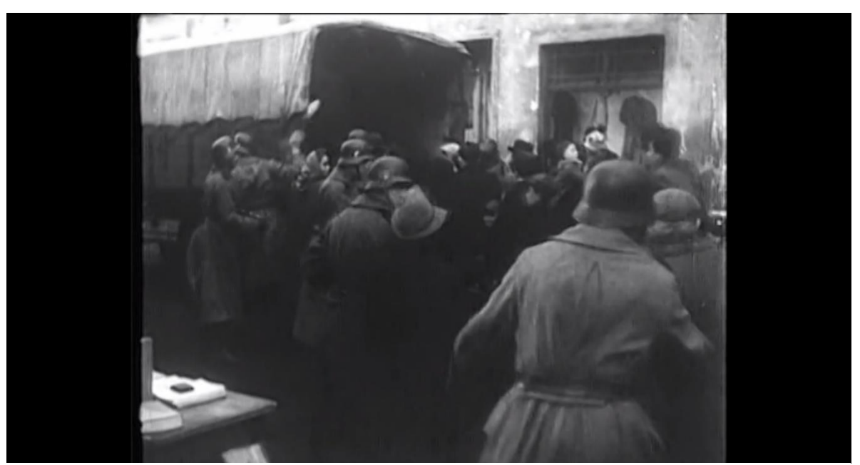
Figure 3.1 – The Last Stage . Opening scene that depicts the round-up of Jews on a Warsaw Street corner.