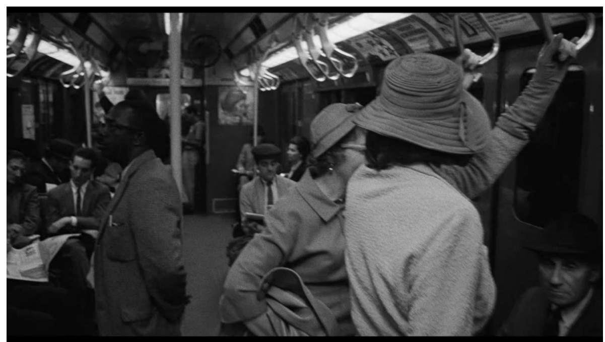
Figure 3.44: Pawnbroker . Point of view shot of Sol's perspective on the subway.

As Sol makes his way to the centre of the subway carriage, a point of view shot moves three hundred and sixty degrees capturing the entirety of the interior space of the subway. This shot is simultaneously edited alongside a secondary mirrored rotation, but this time it is a flashback to Sol's memory of the freight carriage (Figures 3.44, 3.45, 3.46, 3.47 and 3.48). In essence, this cross-cutting stages a collision between each shot of past and present to synthesise the feelings of involuntary memory and how it is triggered. It is the motion of the subway carriage – captured by the irregularities of the hand-held camera – the placement of the individuals around him, and the noise made by the friction between the carriage and the tracks that act as a trigger for the past to emerge. No longer bound by a clear temporal chronology, the film's narrative forces past and present to collide without completely resting the camera in either one. The editing, then, becomes symbolic of the weight of survival on Sol.