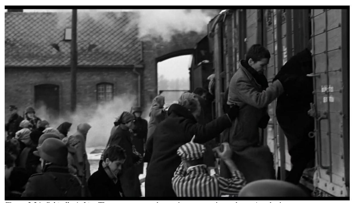
Figure 2.24: Schindler's List. The women enter the carriages preparing to leave Auschwitz.

While the gatehouse and the gateway act as the threshold into the 'Concentration Camp Universe', Spielberg also utilises the space for the sake of Schindler's saviourhood narrative. Before physically appearing to confront the guards at Auschwitz and confirm the rescue of the women's and children's transport, Schindler bribes a member of the SS to release them. Following this scene, the camera is back in the re-created grounds of Birkenau, but this time the women and children prepare to reboard the carriages that brought them in (Figure 2.24). In the midst of the pushing and shoving to back on the carriages, two children are separated from their mothers by a guard and pulled to one side. As if from nowhere, the tall, dominating presence of Schindler appears in defence of the children. The children hide behind Schindler as he persuades the guard that they are essential skilled munitions workers. While this confrontation takes place, the gatehouse fills out the background of the frame (Figure 2.25).