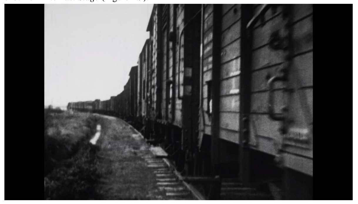
Figure 2.10: Night and Fog. Stock footage of the train that precedes Jakubowska's images.