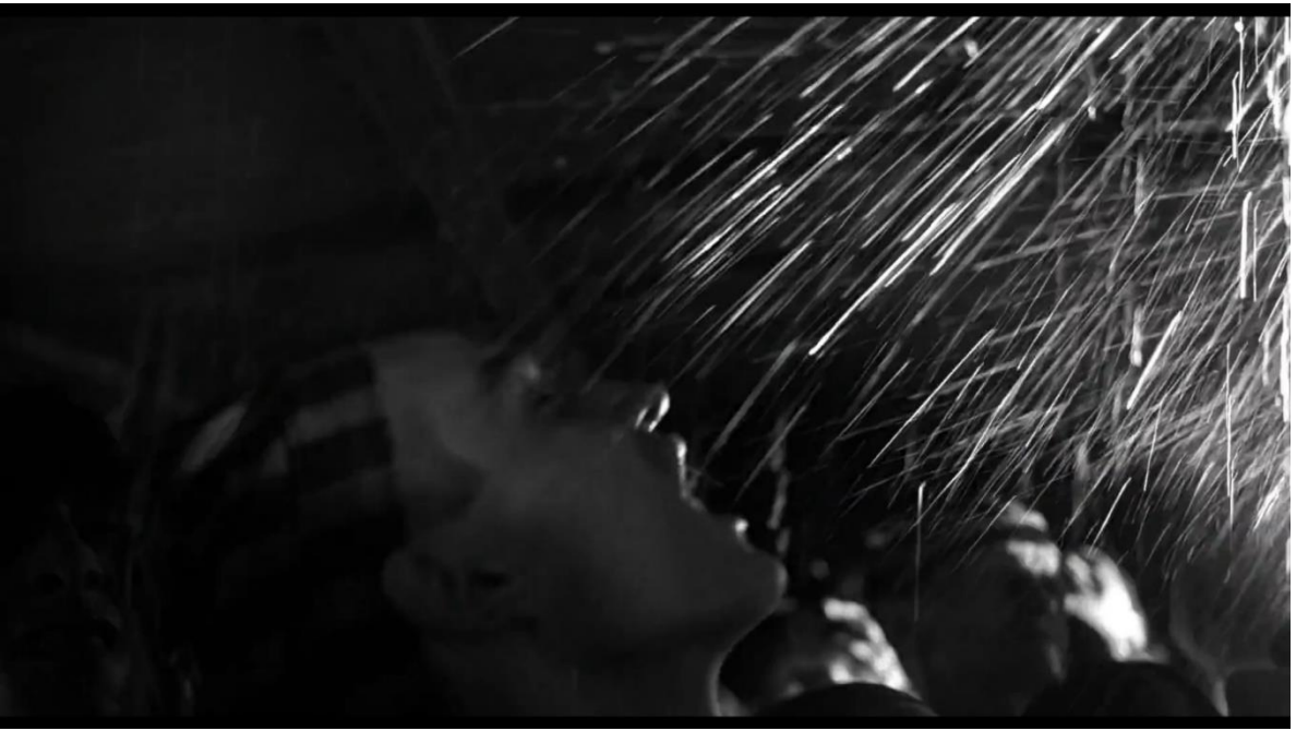
Figure 3.25: Schindler's List. Water begins to enter the carriages.