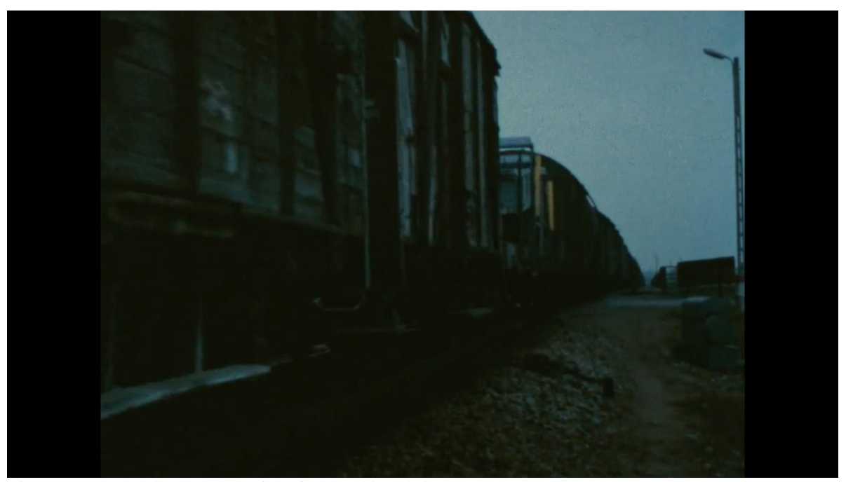
Figure 3.49 – Shoah . Final shot of the freight train passing the camera.

This ending provides no final confirmation of how each testimony constitutes a corresponding meaning to create a feeling of closure. From first shot to last, Shoah aims to resist providing a meaning for the images it presents. Instead, the film abstracts the need for a clear explanation to create a crisis of interpretation. This is what Lanzmann was aiming towards when describing his film 'not as a movie about survival...not a movie about survivors', but that ' Shoah is a film about death'. *40 Shoah does this by confronting the interminable quality of death. In other words, death cannot be correlated to a meaning as this would imply a possibility for closure. Thus, it is left like the never-ending sound of the train as the incessant wound.