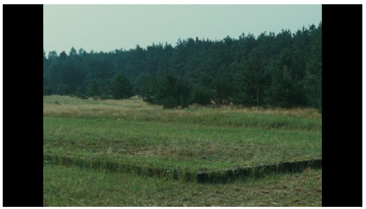
Figure 3.43: Shoah. Panning panoramic shot of present day Chełmno concentration camp.

close-up of Srebnik with the panoramic landscape is caught between the visible beauty of Chełmno and the infringing sense of dread from its past. As Figure 3.43 displays, the verdant essence becomes even more vibrant when the site of extermination is exposed, and the panoramic shot is shared with Srebnik's revelatory moment of the past revealing itself in the present.