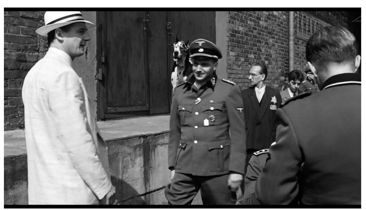
Figure 3.20: Schindler's List. Schindler arrives in a white suit that stands out against Goeth and his men.

1944, connotations of the freight train's cramped conditions are utilised to test the morality of Schindler. As the prisoners are forced into the carriages, Schindler appears in a distinct white suit that separates his presence from the dark greys of Goeth and his officers (Figure 3.20). Goeth informs Schindler that 'they're running a little late...it's taking longer than I thought', and with this the camera frames a close-up of Schindler's face as he covers himself from the pulsating heat and scans the freight carriages (Figure 3.21). The camera then cuts to an extreme close-up of inside the freight carriages (Figure 3.22). The frame now presents the suffering of the interior in which the noise of those breathing is clearly audible. In three quick cuts, the camera captures the tone of the frame as the physical restriction of the composition – the lack of natural or artificial light reaching the camera from inside the freight carriages – presenting a claustrophobic framework.