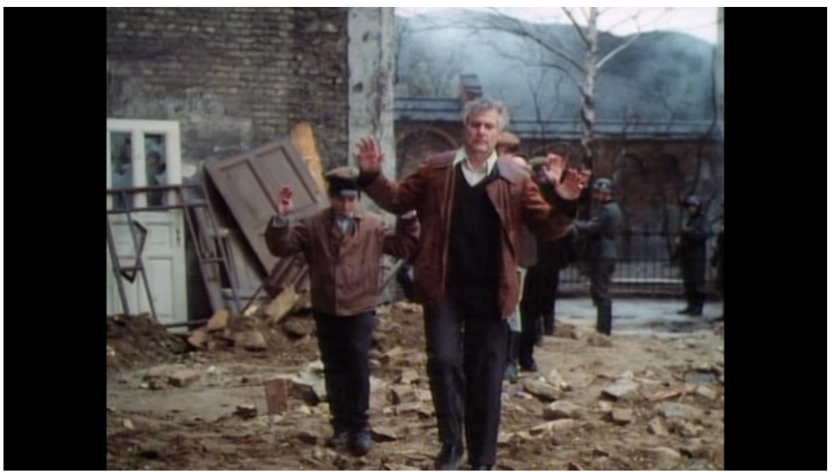
Figure 1.15: Holocaust. Long shot of Moses and the boy as they are led to a firing squad.

Umschlagplatz . The camera focuses on Moses and the boy as they proceed with their arms raised towards the firing squad. The camera does not remain stationary to capture the rest of the resistors leaving the bunker. Instead, it cuts to a long shot of Moses and the boy as they lead the rest of the insurgents (Figure 1.15). The composition of this long shot changes to a medium shot as Moses and the young boy approach the foreground (Figure 1.16).