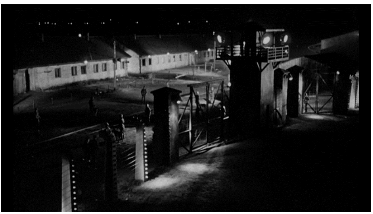
Figure 3.9: Kapo . Arrival into unnamed camp.