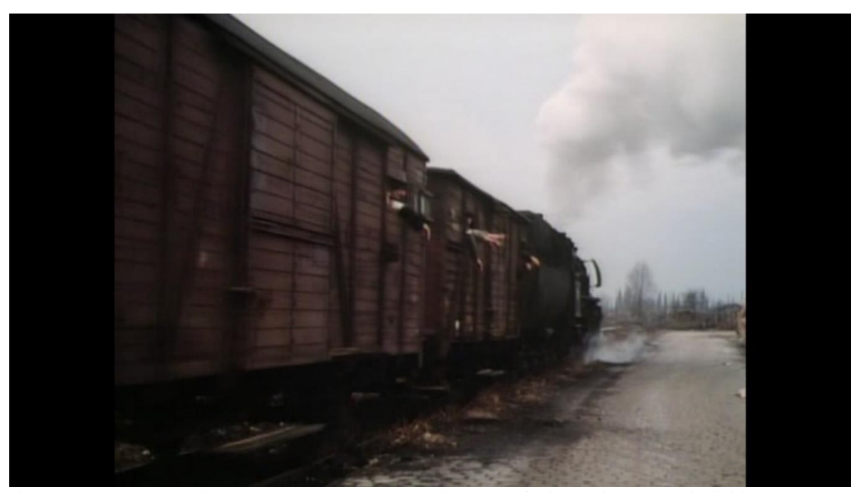
Figure 3.16: Holocaust . Final shot the sequence as the train departs for its destination and individuals wave out the barbed-wire windows.