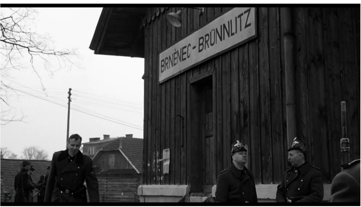
Figure 3.32: Schindler's List. First shot of Brünnlitz station.