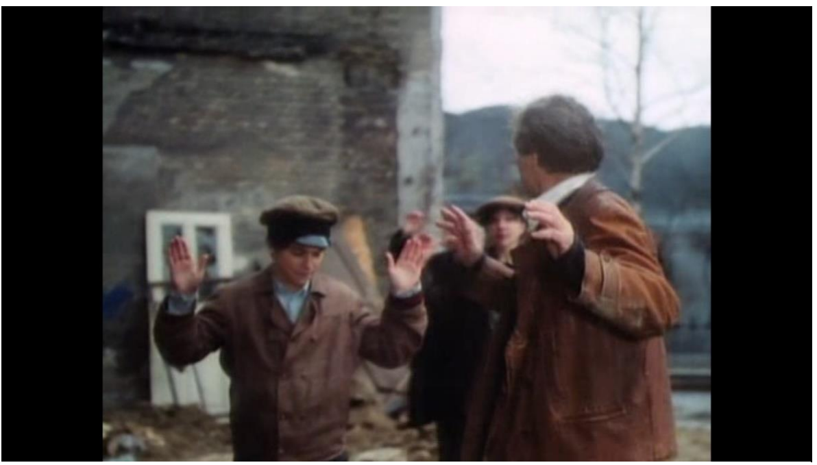
Figure 1.16: Holocaust . Medium shot as they approach the foreground.

As the camera remains stationary, the movement of characters shifts the composition and focus of the shot. Moses moves his body to check whether the resistors are following