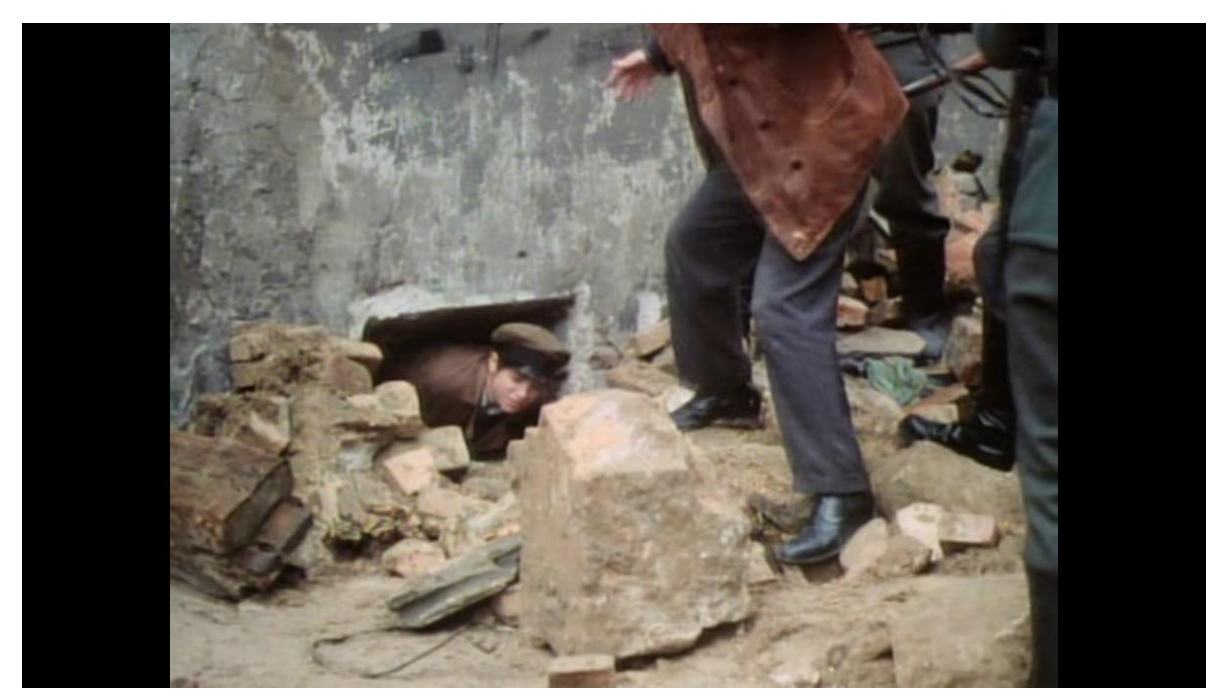
Figure 1.14: Holocaust . The boy follows Moses out of the bunker.

As Moses and the boy – wearing a baker boy hat that resembles the one from the Stroop report photograph – are forcibly removed from the bunker, they are watched over by SS guards in a similar fashion with their submachine guns half-raised. This is a crucial moment in the climax of Holocaust 's narrative as it attempts to represent the surrender; the stage at which the final resistance was crushed and its members marched to the