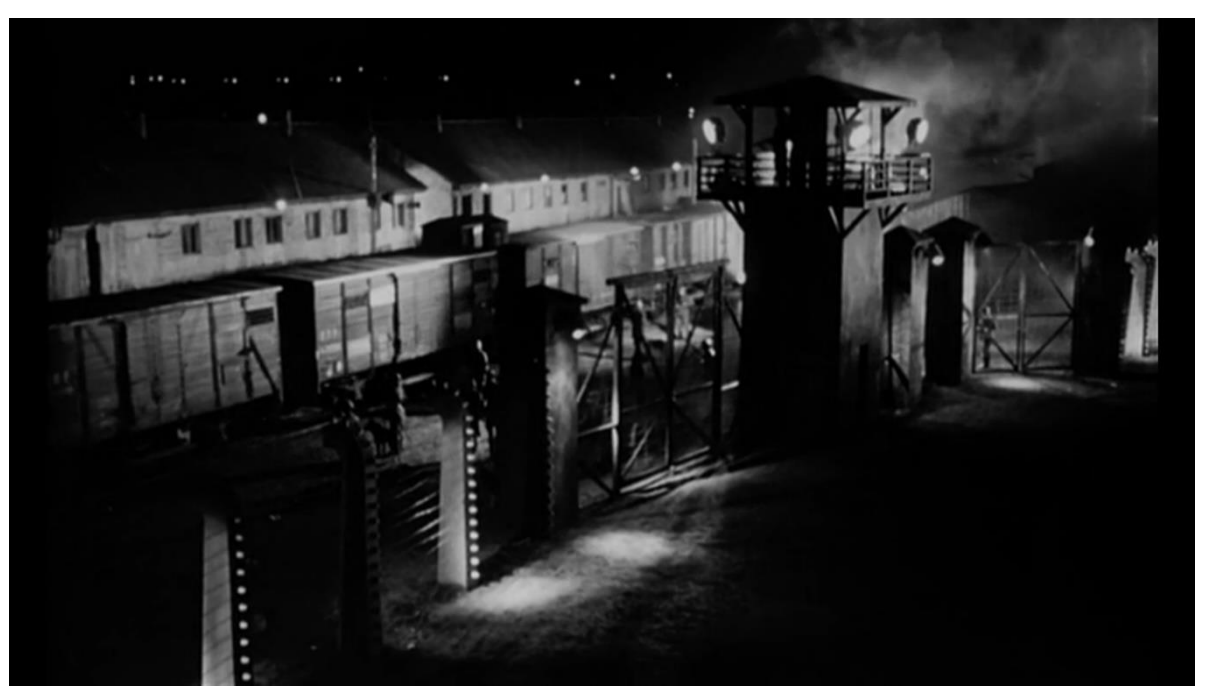
Figure 2.8: Kapò (Gilo Pontecorvo, 1959). Arrival into unnamed camp.