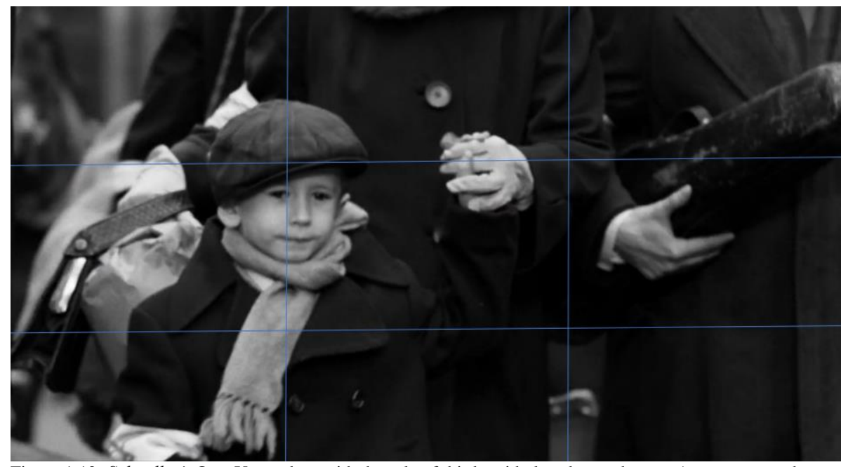
Figure 1.12: Schindler's List . Young boy with the rule of thirds grid placed over the top. As we can see the young boy's face lies close to the top left intersection between the vertical and horizontal lines.

While both images are depicting different events, one being the deadline for entering the Kraków ghetto in 1941 and the other being the repercussions of the Warsaw ghetto uprising in 1943, the affinities between the two indicates the dynamics of Jewish innocence at play in Schindler's List . This sequence reflects how contemporary trends within cultural imagery have given way to identifiable aspects of the ghetto. Essentially, the repetition of the