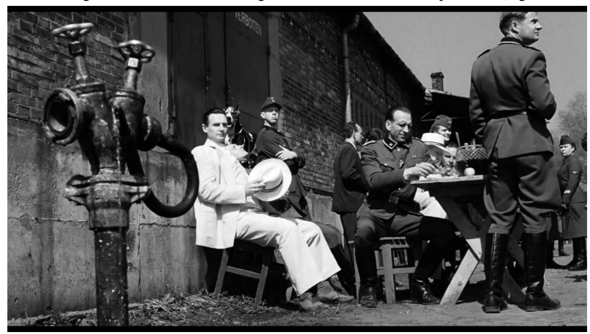
Figure 3.23: Schindler's List. Schindler notices the hose after seeing the individuals in the boxcars.

his eyesight fixed on a dripping tap in the foreground (Figure 3.23). What is created in this sequence is then confirmed in the next shot when Schindler asks Goeth whether they should hose down the carriages. The next sequence of editing combines shots of Schindler helping Jewish workers (Figure 3.24), the laughter from the SS officers as they watch, and the interior of the carriages as the water soaks through the wood and reaches the prisoners (Figure 3.25).