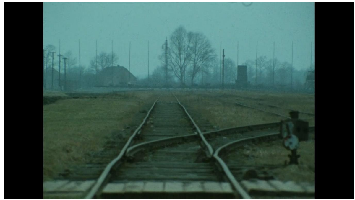
Figure 2.17: Shoah. The camera is stationary outside the gatehouse and a zoom takes the frame closer inside.