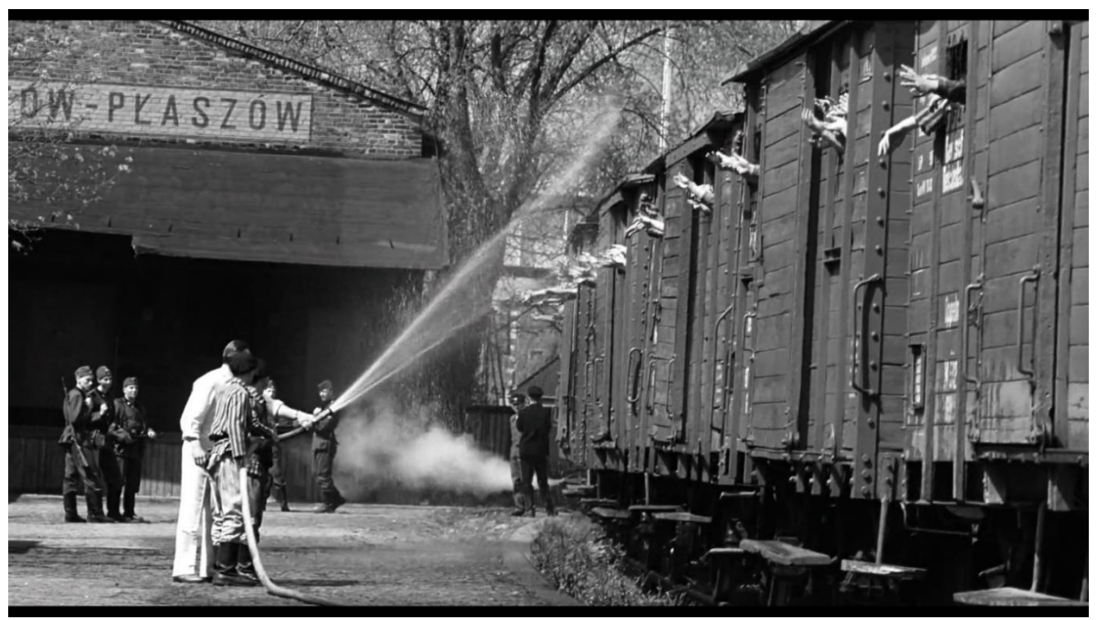
Figure 3.24: Schindler's List. Schindler begins to hose down the carriages.