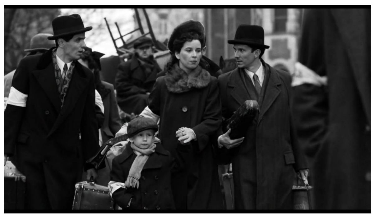
Figure 1.10: Schindler's List. Shot before the close-up zoom of the young boy's face that captures his family entering the ghetto together.

functions to reduce the perceptible on-screen space, allowing the focus to pull away from the background and frame a single family to express the struggles and processes of ghettoisation.