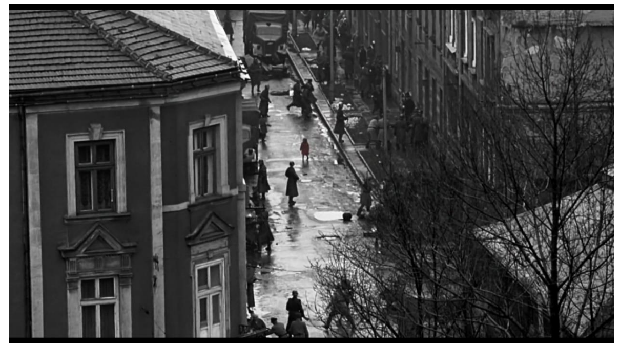
Figure 1.21: Schindler's List. Point-of-view shot of what Schindler is looking at.