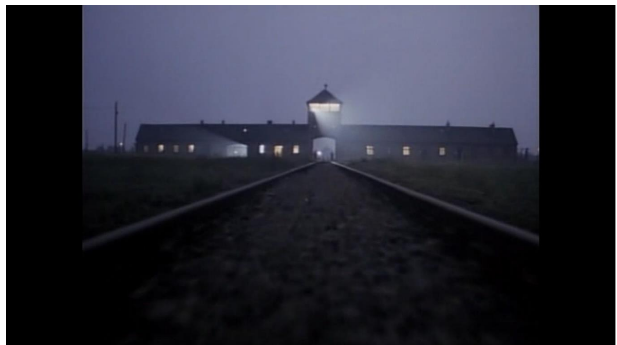
Figure 2.18: War and Remembrance (Dan Curtis, 1988). The dolly cam shot as the train enters Birkenau.

While the side-lighting from the carriage window reveals a dark and somewhat cramped mise-en-scéne — made more noticeable by one elderly woman claiming 'I can't...there is no privacy' — individuals are still able to sit and walk around its interior. During the cuts from the wide exterior shots, the train arrives at an intermittent stop which is revealed to be Görlitz where a Nazi officer refuses to provide any water to the carriages. The length of this journey is made clear by the accompanying on-screen text when the frame dissolves from night to day, with 'Day Two' appearing across the screen. On this second day, the train pulls into the town, Leignitz, as the snowy conditions appear, and at this point the same woman adamantly declares, 'towards Auschwitz'. Throughout these intermittent stops, interior close-ups and exterior sequences contrast the deportees' journey with the accompanying Nazi officers who drink, sing and smoke in a separate seated carriage. This carriage is central in the arrival into Auschwitz as the crosscutting overlays the joyous German chants with the camera dolly shot of the Birkenau gatehouse (Figure 2.18).