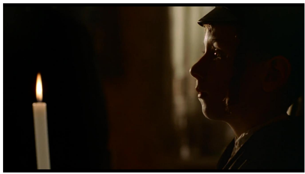
Figure 1.2: Schindler's List. Close-up of a young boy from profile view.