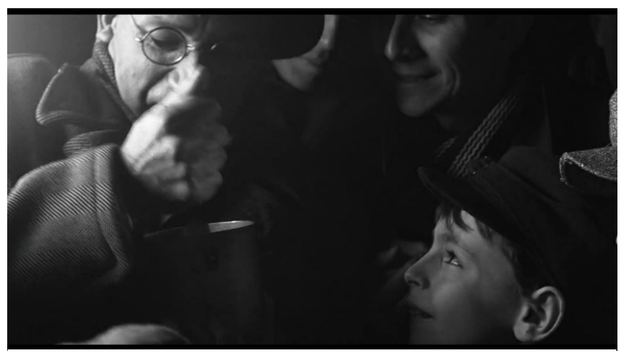
Figure 3.30: Schindler's List. Stern making water from an icicle with a young boy inside the boxcar.