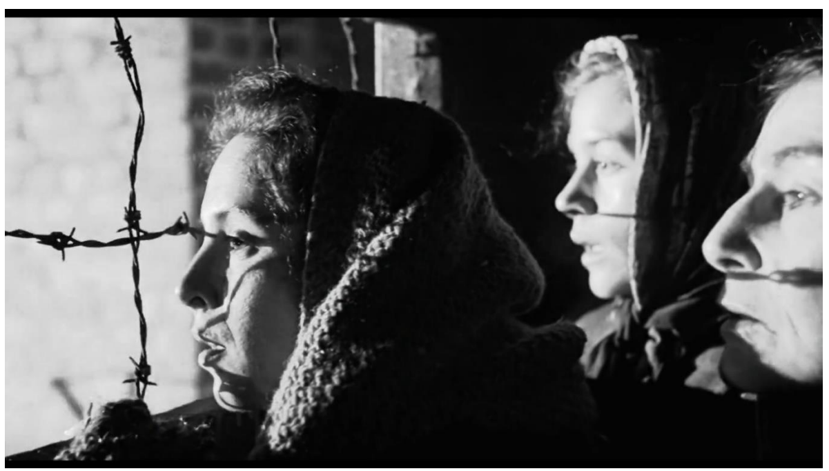
Figure 2.20: Schindler's List. The next frame that reveals more of their facial expressions.