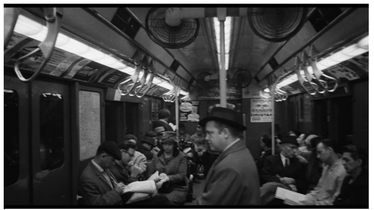
Figure 3.48 – Pawnbroker . Final cut back to present-day and the full three hundred and sixty rotation is complete.

By linking Lumet's depiction of survival with Shoah , it becomes clear how endings that are closer to the time-image can be used to question notions of closure. As with Srebnik's testimony, Lumet also stages an expression of survival by confronting the intimacy of past and present. Similar to the quality of peacefulness, it is the motion of the subway/freight carriage that coexists between past and present, as though the memory remains preserved in this unfolding. In other words, Lumet effectively shows not that Sol's survival depends upon a celebration, but that his survival is a burden he must carry. This is made even more potent