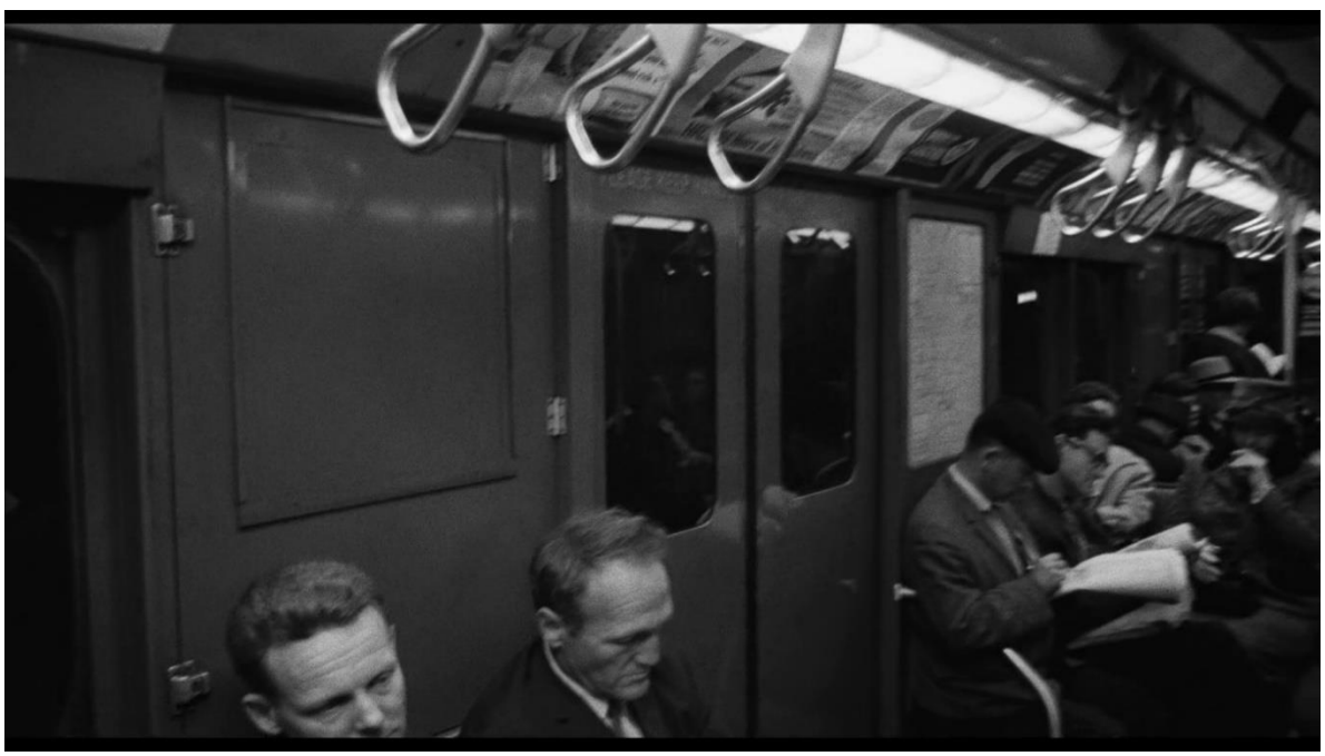
Figure 3.45: Pawnbroker. Cut back to Sol's perspective in present-day.