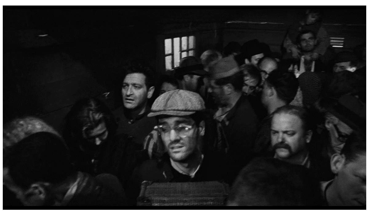
Figure 3.47: Pawnbroker. Second cut to Sol's memory.