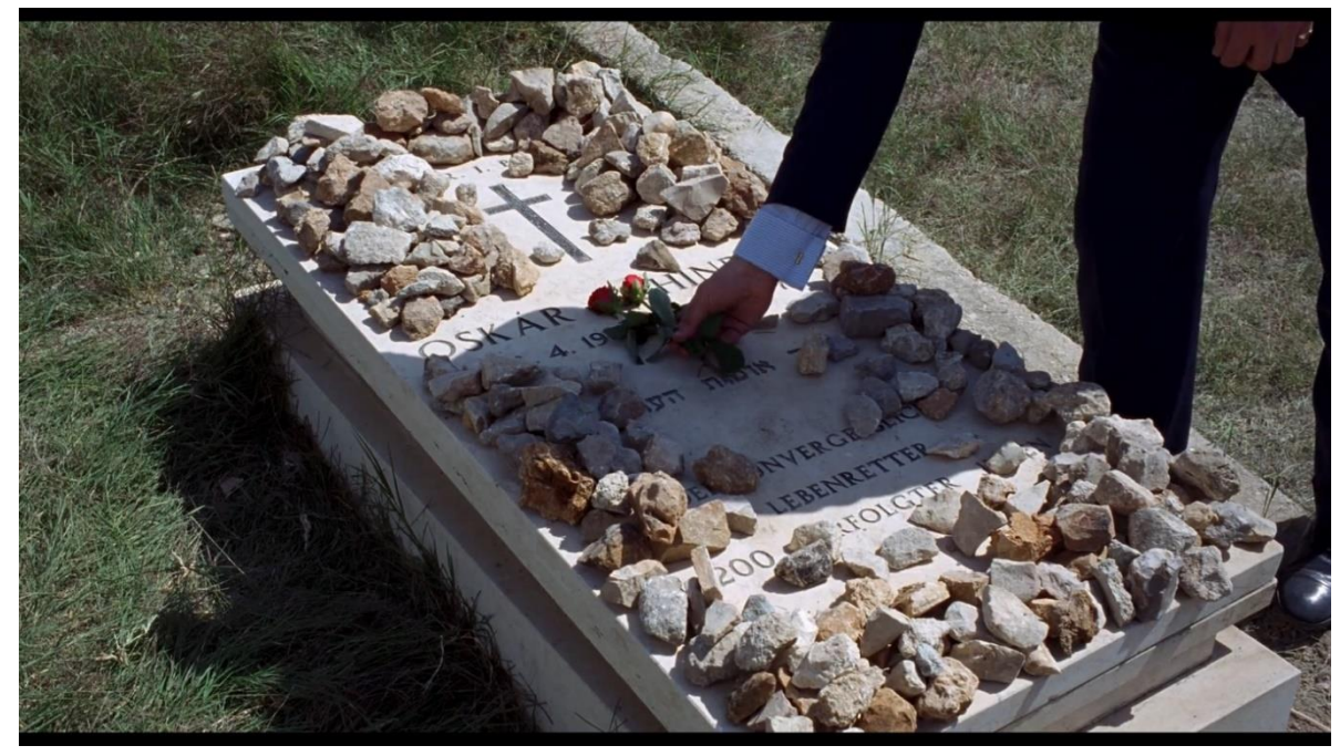
Figure 3.38: Schindler's List . Schindler's grave with all the stones placed by the Schindlerjuden. Liam Nesson places a rose over Schindler's name.