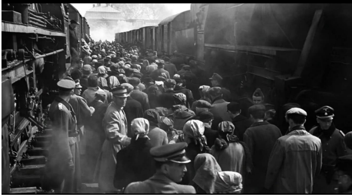
Figure 3.27: Schindler's List. High-angled shot of the train platform.