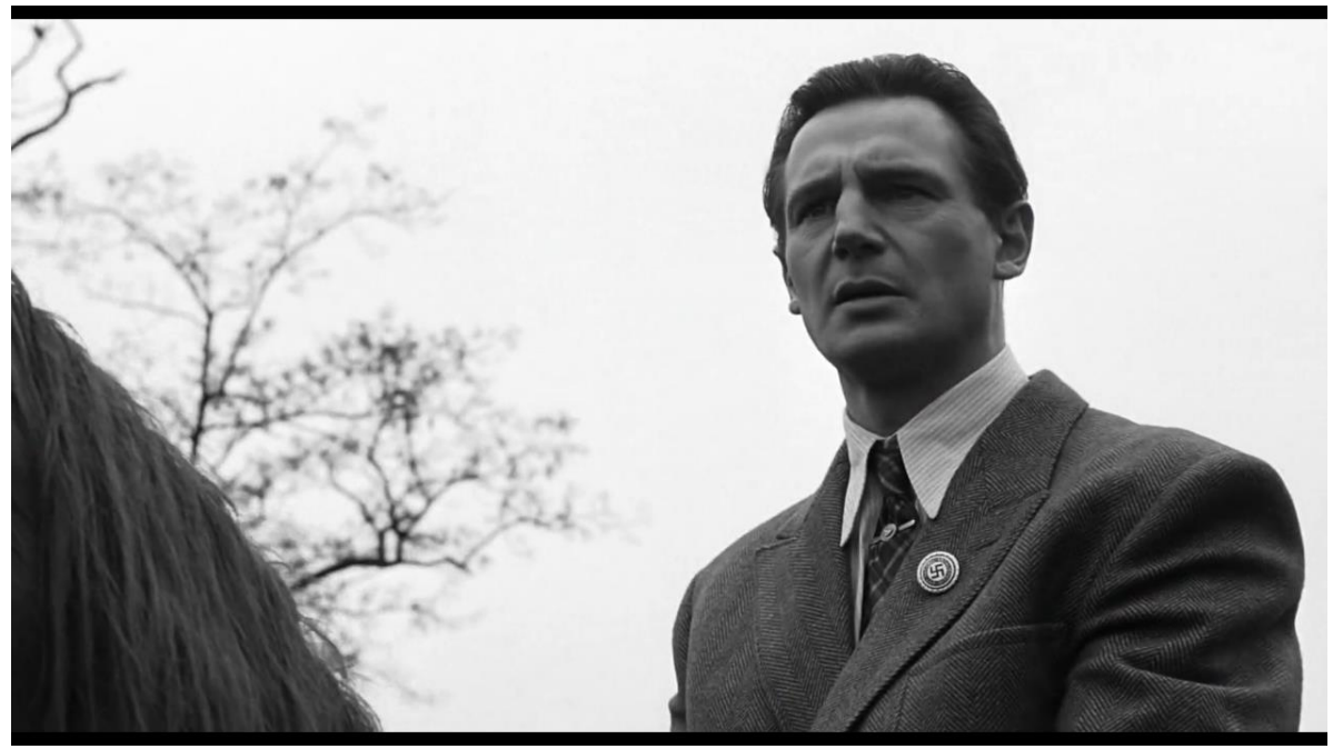
Figure 1.22: Schindler's List. Reaction shot that confirms he is looking at the red toddler.