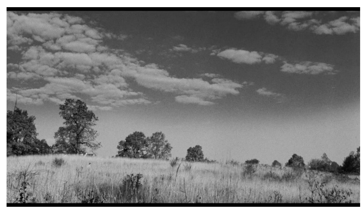
Figure 1.6: Pawnbroker. Panoramic shot of the landscape.

Figure 1.4 juxtaposes the young boy's hands in the foreground with the unblemished face of the girl in the background to capture the innocence of childhood. By utilising a shallow depth of field with natural light, facial characteristics are discernible. This includes both the playfulness of the boy as he attempts to catch the butterfly and the almost bewildered look on the girl's face. The full ambience and context of the opening frames, however, are not created entirely through the visual domain, but through the synthesis of image and sound. The clasping together of the boy's hands and the pan upwards that reveals the girl's face are