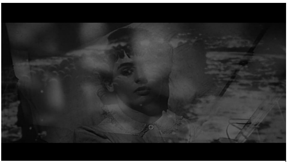
Figure 2.7: The Diary of Anne Frank (George Stevens, 1959). Anne's face dissolves into the footage from The Last Stage.