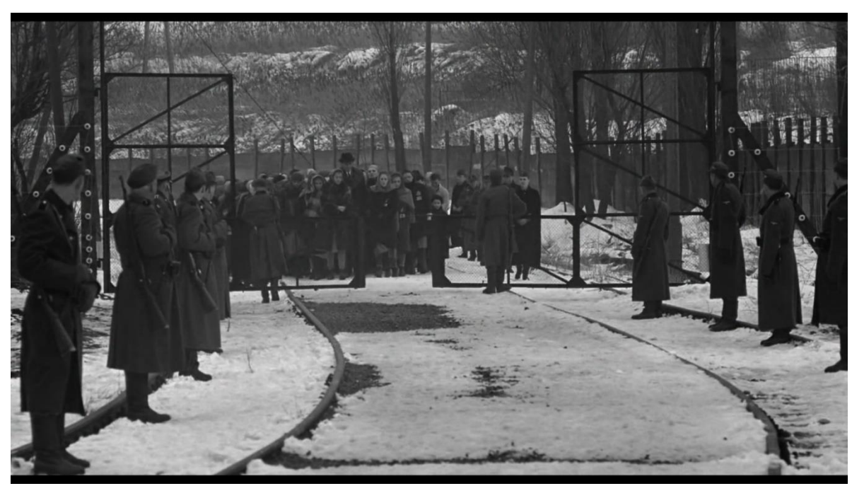
Figure 2.28: Schindler's List. Cut to Schindler leading the women into his factory at Brünnlitz.