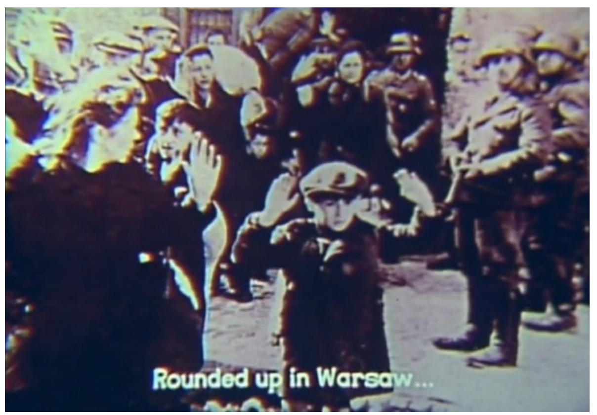
Figure 1.8: Night and Fog (Alain Resnais, 1956). Scene which explains how Jews were rounded up in Warsaw before being placed on trains for deportation.

repetition reveals the significance of the photograph's content and its ability to shape an event through its different reproductions. The figure of this young boy – 'a child's anguish captured by the camera's revealing gaze' – alters how the events of the Warsaw ghetto uprising are historicised and constructed in the present. Marianne Hirsch describes this process in the following way: 'The pervasive role this photograph has come to play is indeed astonishing: it is not an exaggeration to say that, assuming the archetypal role of Jewish victimisation, the boy in the Warsaw ghetto has become the poster-child for the Holocaust'. In essence, the reproductions themselves come to dictate the historical context of the photograph, or, in Hirsch's terms, 'the picture's well-known history...remains invisible in its contemporary representations'. Even its use in Bergman's Persona is contextualised by the protagonist's voluntary mutism and the articulation of collective trauma. Whilst the uprising was a series of events that contained Jewish resistance at its core, the dissemination of the young boy has accentuated notions of surrender, obedience and innocence.