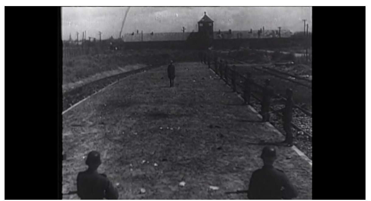
Figure 2.4: The Last Stage. SS Guards await the train entrance into Birkenau.

The geometric lines that dictate the composition construct the moment of arrival. At the centre of the frame, a single guard marches into the background awaiting the incoming transport. Figure 2.4 captures the tracks up to the loading ramp that ran from the gatehouse to the gas chamber and crematoria II and III. Historically, this ramp was a procedural space within the camp. Families were divided, lined up into two columns (men in one and women and children in the other), and led to a doctor where a cursory examination of health would occur. The judgement was done solely on sight deciding there and then whether they would live or die. After a few seconds, the film title fades into the shot, and a more concrete meaning is placed on the mise-en-scéne.