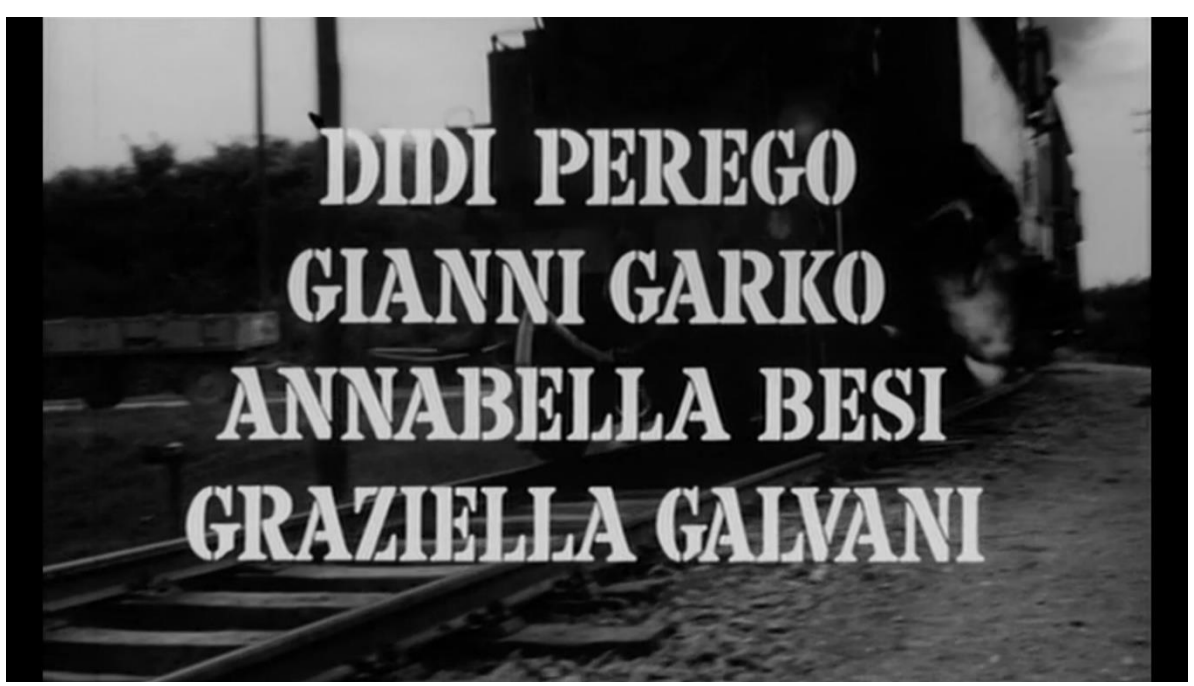
Figure 3.7: Kapo . A dissolve leaves the frame capturing the fast-moving freight train from a low angle shot.