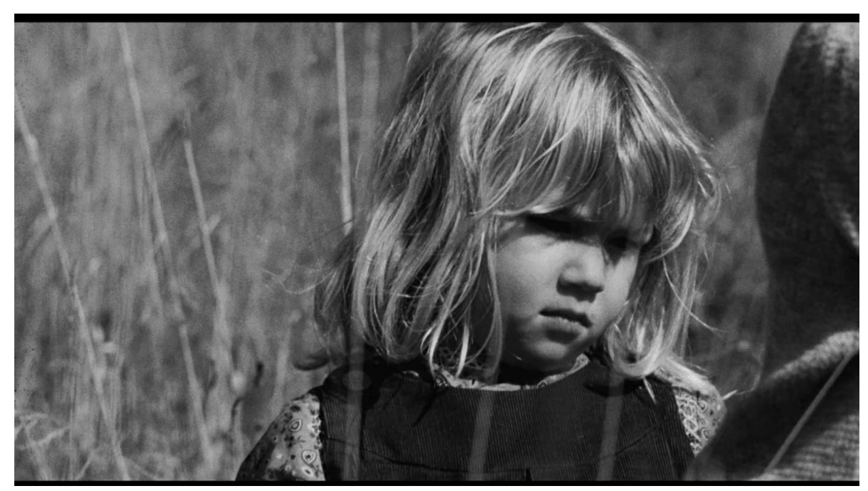
Figure 1.5: Pawnbroker. First shot as young boy leaves the frame and young girl becomes central.