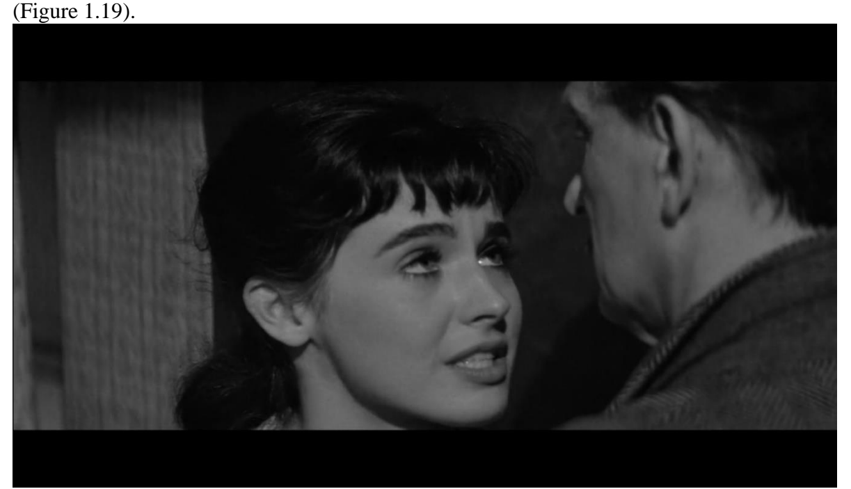
Figure 1.18: The Diary of Anne Frank. First part of shot/reverse shot with a close-up of Anne's face.

dialogue, the camera constructs a space for this paternal relationship by cutting between a demanding, teary-eyed Anne (Figure 1.18) and her father's almost expressionless face