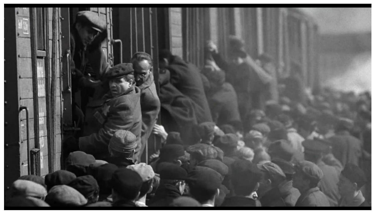
Figure 3.28: Schindler's List. Mr. Nussbaum waves to his wife as he enters the boxcar.