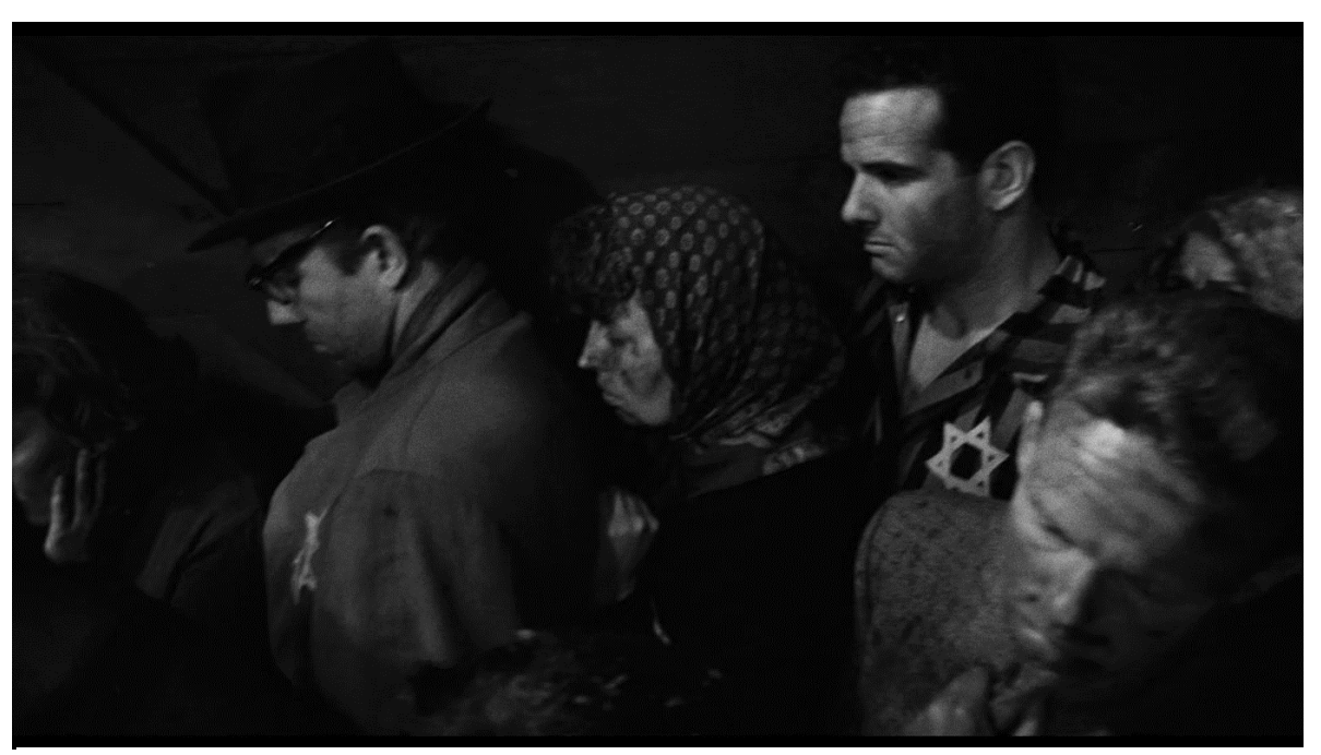
Figure 3.45: Pawnbroker . First cut to Sol's memory of the freight carriage.