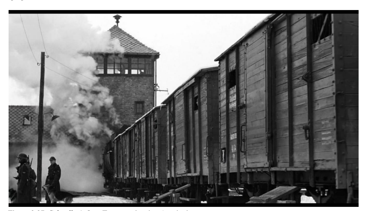
Figure 2.27: Schindler's List. Transport leaving Auschwitz.