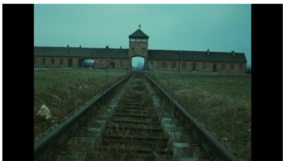
Figure 2.14: Shoah. Symmetrical-like image captured from a dolly cam attached to the train track.

procedural atmosphere that Vrba's words capture: a regular modern-day journey or commute in New York is rendered with connotations of deportation. With each steel podium that passes, Lanzmann's camera recounts the disappearing and arriving of people all over Europe to the exact same place.