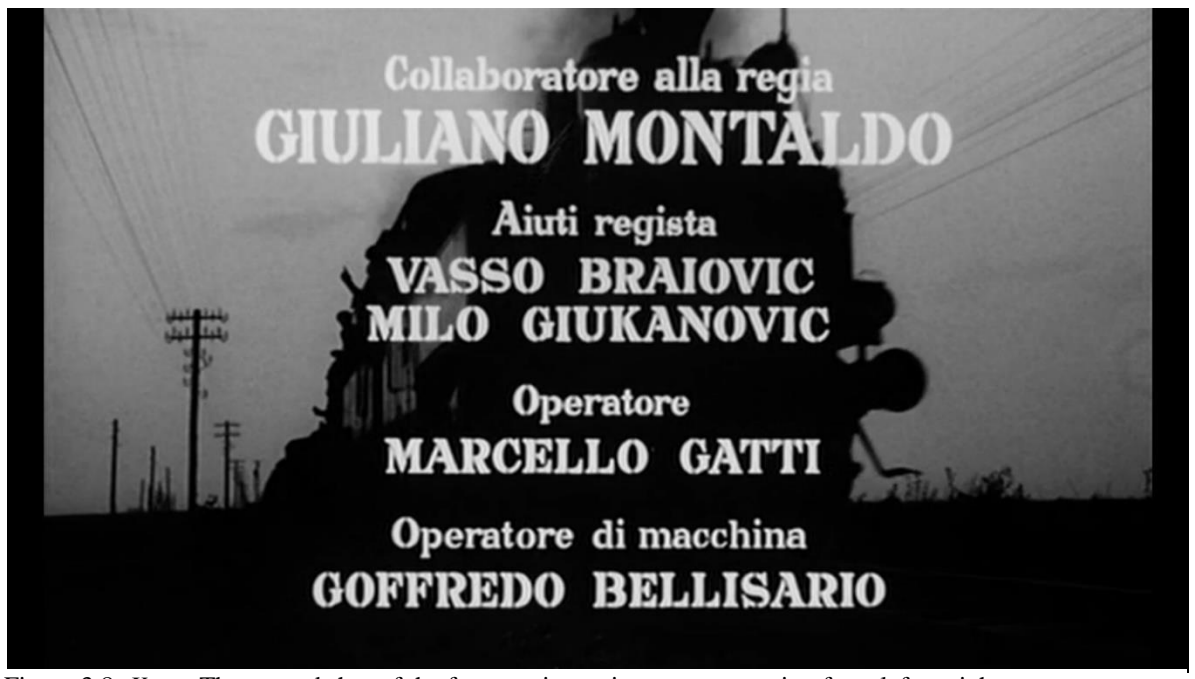
Figure 3.8: Kapo . The second shot of the fast-moving train now progressing from left to right.