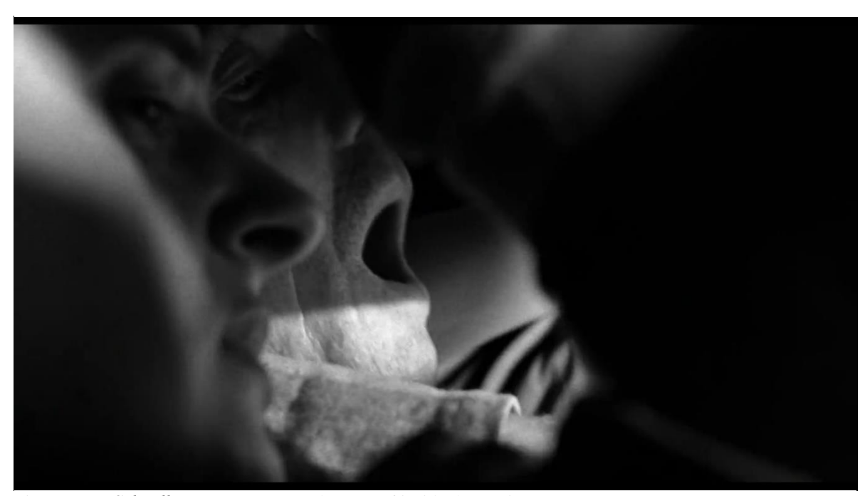
Figure 3.22: Schindler's List. Extreme close-up of inside the carriage.

The editing between Figures 3 .20 and 3.23 establishes Schindler's individual responsibility to those that are suffering by testing his morality. This includes a re-reading of the third-person perspective inside the carriage (Figure 3.22) in accordance with the continuity of the editing to reveal Schindler's relationship to the suffering. Schindler contemplates the sight of the carriage and is distanced from Goeth who appears bored and exhuasted (Figure 3.21). In this contemplation, the cuts link both settings, suggesting that he is imagining what the inside of the carriage would look and feel like, connecting its reality to the prisoners' plea for water (Figure 3.22). Finally, the camera cuts back to Schindler with