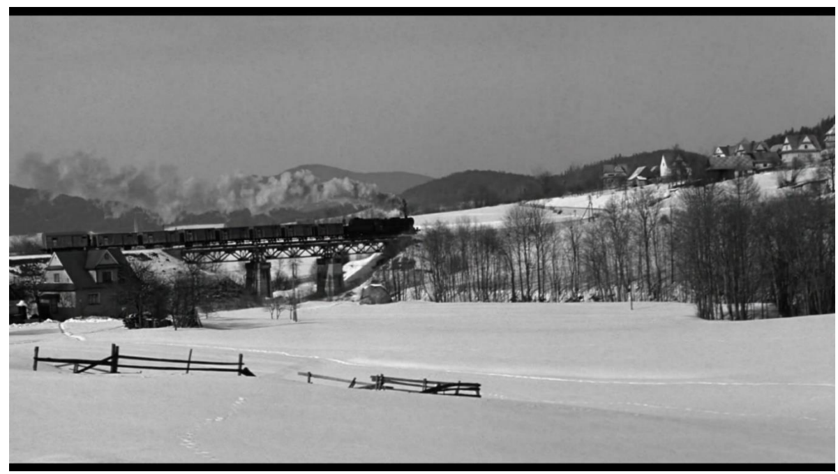
Figure 3.29: Schindler's List. Panoramic shot of the train on its way to Schindler's factory.