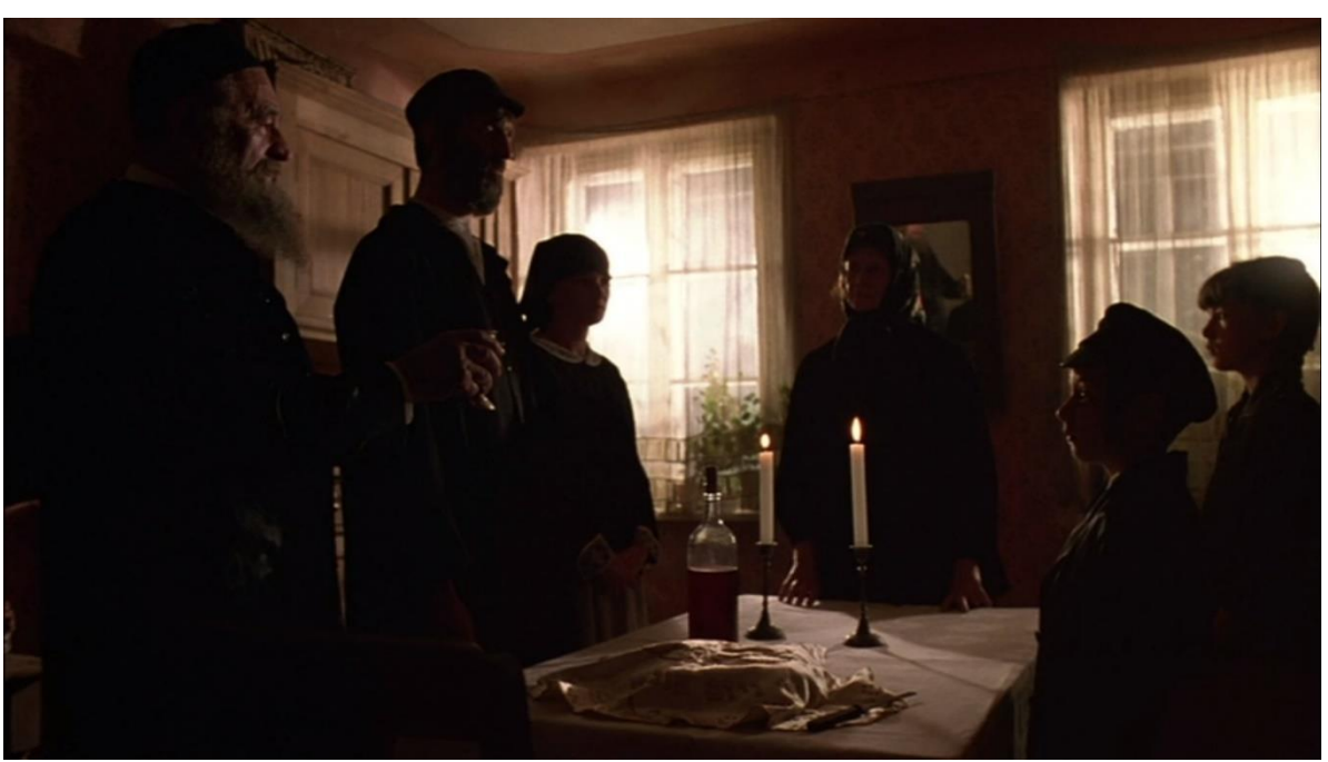
Figure 1.1: Schindler's List (Steven Spielberg, 1994). First full medium-shot of the Sabbath.

Lighting constructed in this way moulds silhouettes around faces to create a chiaroscuro effect. As the Rabbi speaks before the meal on the eve of Shabbat, the scene cuts to a close-up of a young boy's face from a profile view (Figure 1.2), before cutting back to the room which is now completely vacant of life as the credits begin to roll (Figure 1.3). All that is left is the burning candles, and as they melt away the camera enacts a three-part dissolve close-up that merges a trio of shots. These three dissolves represent the passing of time and symbolise the relationship between life and death. First, a medium-shot of the entire room dissolves to a close-up of the candles as they reduce to half in size. The next dissolve brings the view even closer, centralising the two candles side by side as the title appears. A final dissolve takes the camera into the domain of an extreme close-up as a single candle burns away. These close-ups that bring the perspective of the burning flame into focus are described by Horowitz as 'literalising the term Holocaust as an offering to God wholly consumed by flames'. Not only does the scene introduce the Jewish presence, but the candles set the course for 'the extinguishing of European Jewish life and the burning of Jews in the crematoria'. 8