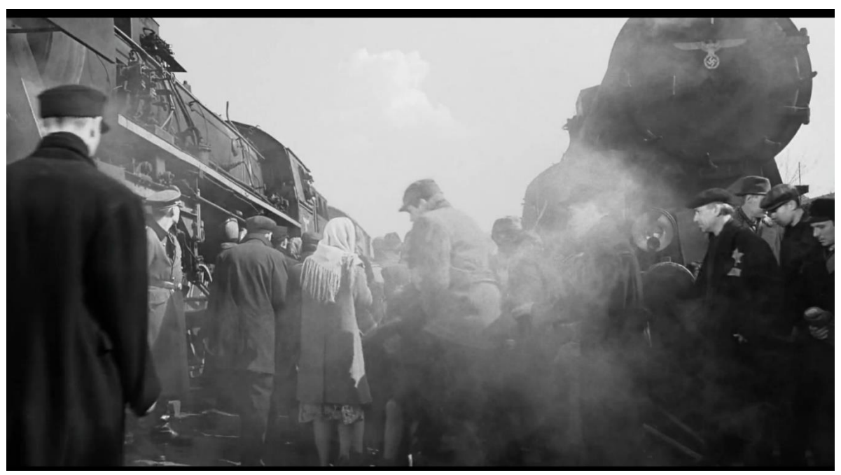
Figure 3.26: Schindler's List. Mr. and Mrs. Join the rest of Schindler's Jews getting ready to board the train.