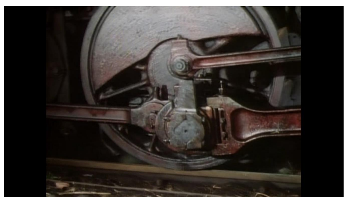
Figure 3.15: Holocaust . The train's axle begins to slowly rotate.