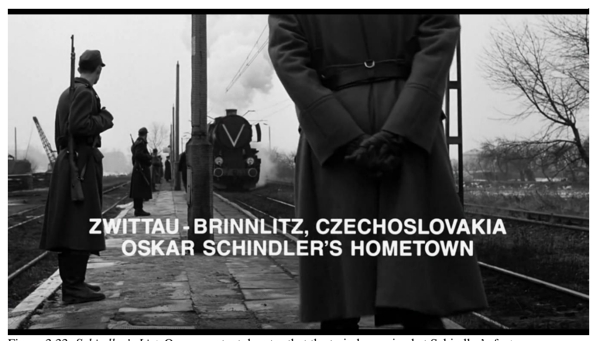
Figure 3.33: Schindler's List. On-screen text denotes that the train has arrived at Schindler's factory.