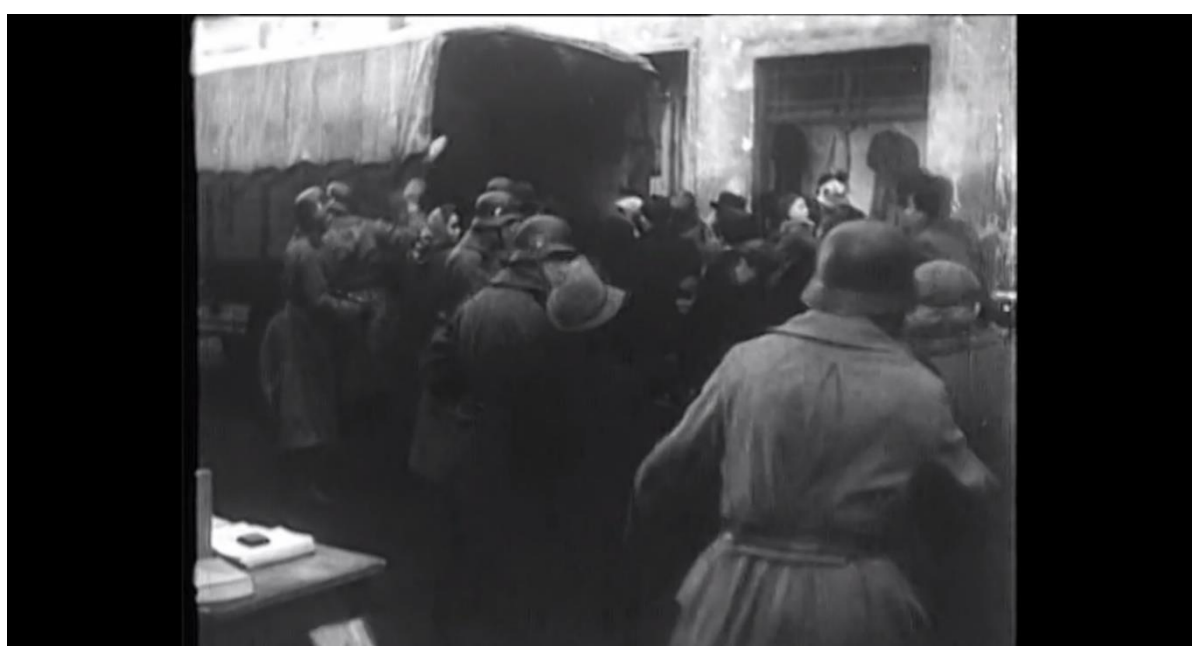
Figure 2.3: The Last Stage (Wanda Jakubowska, 1947). Individuals are rounded up on a street corner.