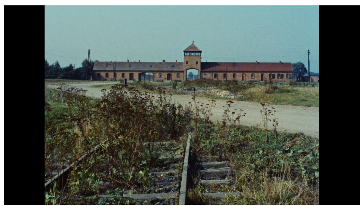
Figure 2.11: Night and Fog. Modern day footage of the Birkenau gatehouse.

With the camera lingering on the exterior of the gatehouse – noticeable by the single train track and the vehicle entrance on the left side – the narrator questions the present-day significance of the site: