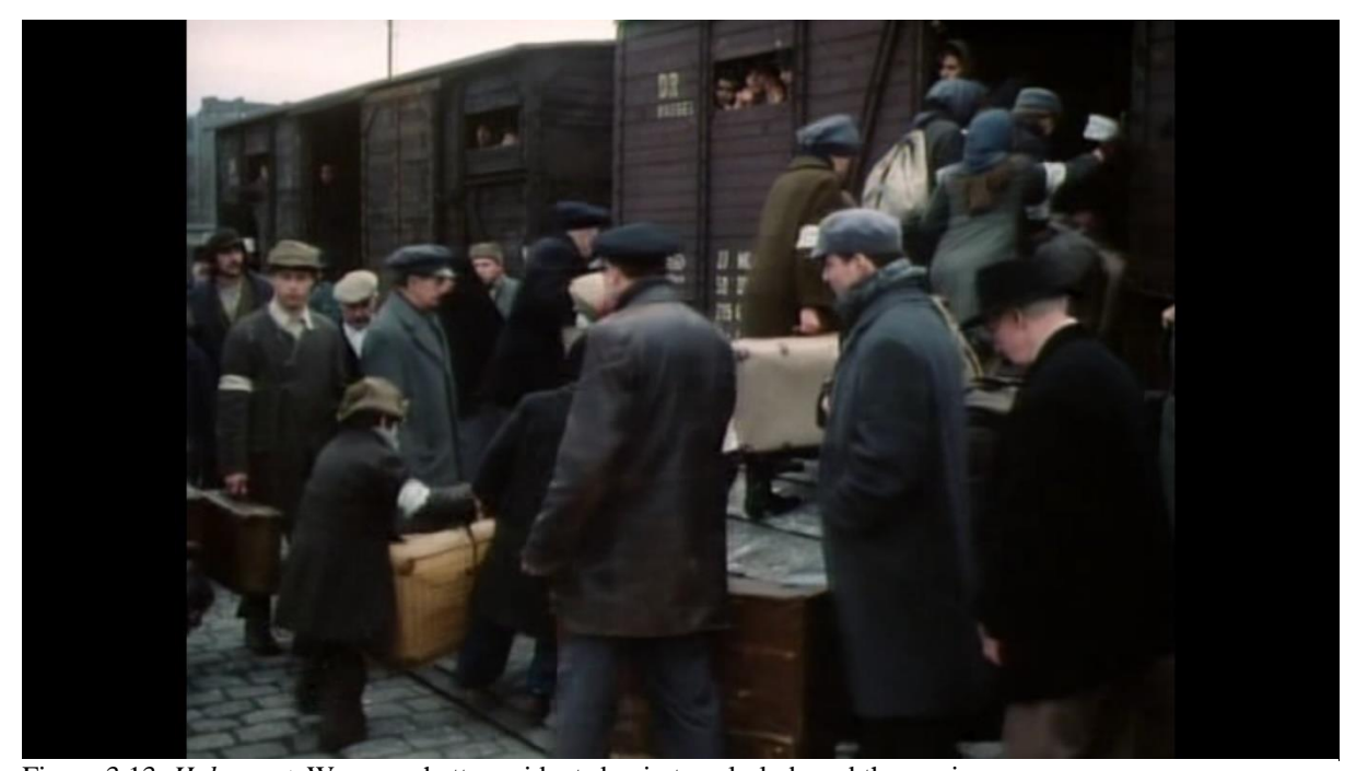
Figure 3.13: Holocaust . Warsaw ghetto residents begin to calmly board the carriages.

and stay in line...fill the cars, no shoving' (Figure 3.13). Unknowingly to Berta who states that 'as long as we are together, they can't destroy us', the camera cuts to the locomotive as an SS officer informs the driver that there has been a 'change of routing...Treblinka is full you are going to Auschwitz'. Not only are the Weiss couple duped into believing they are heading to a family camp in Russia, but they have faith in their protection when they are together as a family. The couple now willingly enter (Figure 3.14) as the camera cuts to an extreme close-up of the train's axle beginning to move (Figure 3.15) and then to a longer wide shot of the wooden freight carriages with individuals waving from the barbed-wire windows as the locomotive slowly recedes into the background of the frame. (Figure 3.16).