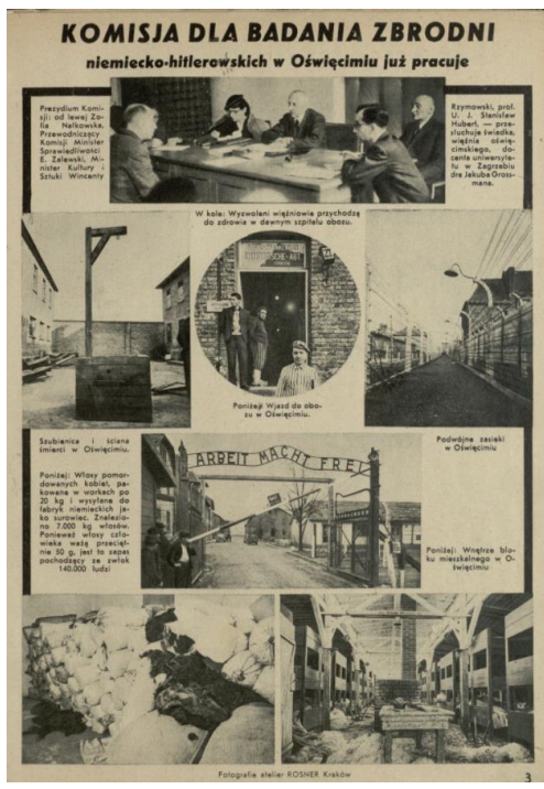
Figure 2.6: Przekrój , Issue 2 (22 April 1945), p. 3.