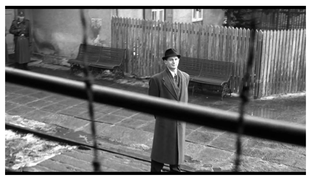
Figure 3.34: Schindler's List. Shot from the inside of the train that reveals a smiling Schindler.

When the male transport rolls into Brünnlitz their first sight is of the tall smiling, Godlike, figure of Schindler (Figure 3.34). Taken from the perspective of the inside, this shot presents a point of identification between Stern and Schindler, which in turn signifies their rescue. While the camera is fixed to a stationary position inside the freight carriage, Schindler's facial expressions follow its movement. This still (Figure 3.34), as a depiction of saviour and saved, enfolds the greatest depths of suffering into heart-warming aspects of human decency.