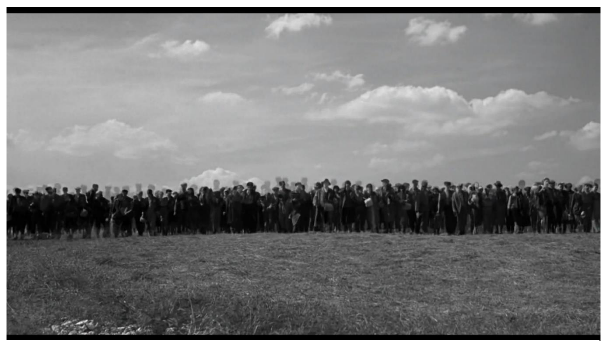
Figure 3.35: Schindler's List . The Schindlerjuden depart from Brünnlitz and the dissolve into the present-day begins.