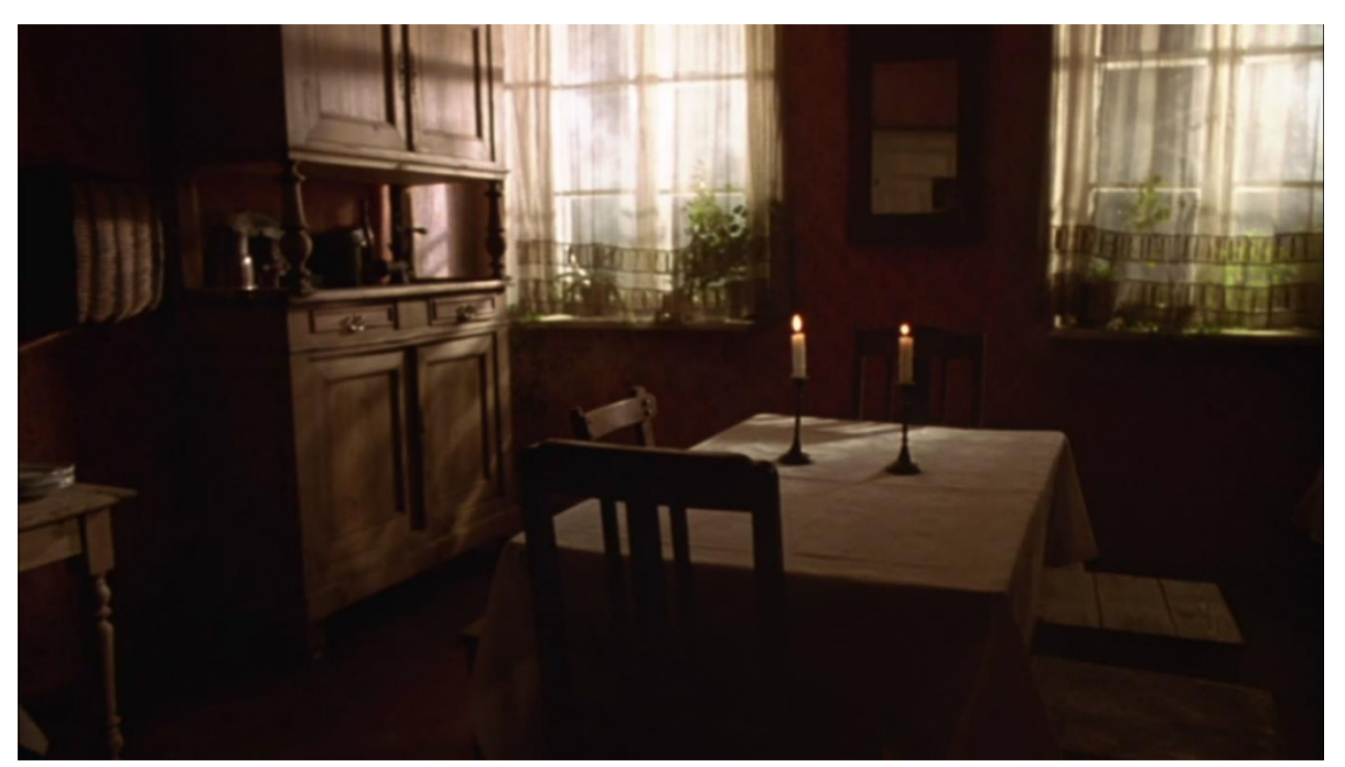
Figure 1.3: Schindler's List. Shot appears again this time devoid of life.

Furthering Horowitz's reading, each dissolve marks a temporal ellipsis to omit the time it takes for the candles to burn, creating an atmosphere of death and loss. The similar proportions between Figure 1.1 and 1.3 are created by the repetition of a low-levelled camera position at the height of the children. To complement this, the interior mise-en-scène includes a wide variety of mahogany-filled furniture which is contrasted by the lighter colours of the table cloth and the thin material of the blinds. Between these two shots and the sequence of dissolves that follow, the candle is always present in frame. This emphasis on the imagery of