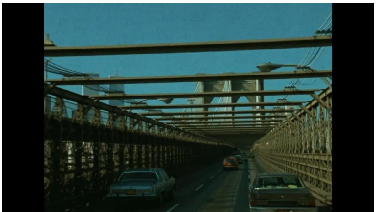
Figure 2.13: Shoah (Claude Lanzmann, 1985). Still of the Brooklyn Bridge from camera attached to car roof.