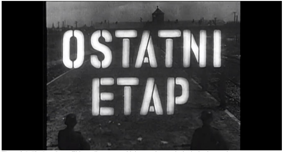
Figure 2.5: The Last Stage. Title credits appear with locomotive smoke in the background.

As the words 'Ostanti Etap' (The Last Stage) begin to appear (Figure 2.5), the grounds of Auschwitz are denoted as a last or final destination. The white text that now appears superimposed on the frame alongside a darkening of the background which conceals the guards but allows the central watchtower and the outline of the gatehouse to remain in focus. Creating continuity with Figure 2.4, the title credits intensify the geometry of the frame. The font, Ostatni Etap, consists of vertical and horizontal lines that never cross, repeating the structure of the straight tracks that lead from the gatehouse to the foreground, and these lines figuratively represent a visual illustration of the railway system. Furthermore, the formation of the words, Ostatni and Etap appear to provoke an unsettling boundary between a fixed geometry and a form that is only fragmentally merged. While reflecting the uniformity and straightness of the railway tracks, the letters also appear to embed a discontinuity with the excess use of gaps. The lines form a type of fractured semblance whereby the words themselves never fully actualise as integral forms (except only for the single '1').