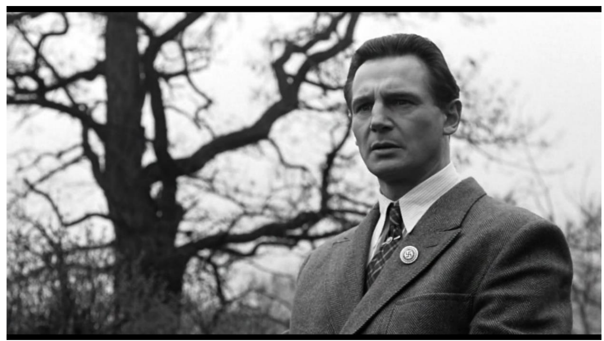
Figure 1.20: Schindler's List. Medium close-up of Schindler looking off-screen.