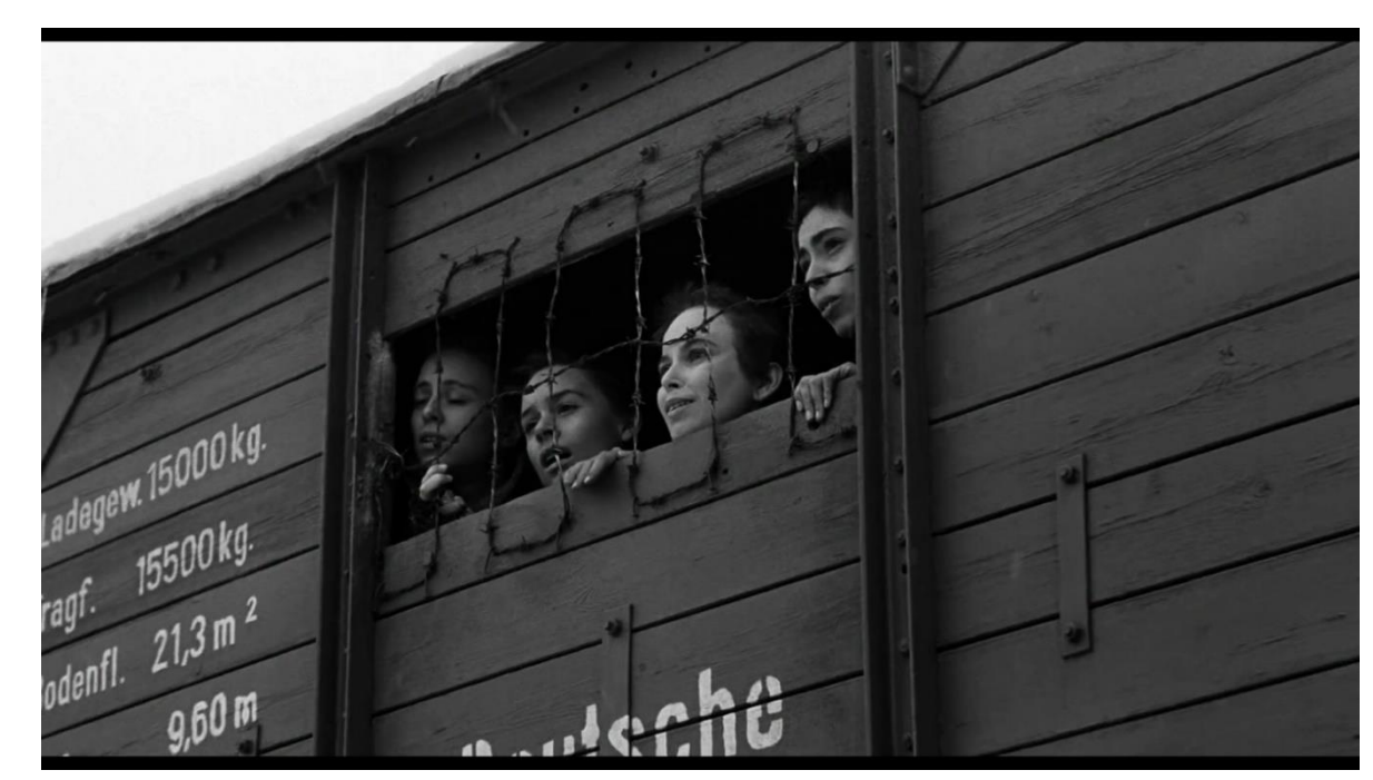
Figure 2.26: Schindler's List . Juxtaposition of the barbed-wire with the reassured faces of the women as they prepare to leave Birkenau.