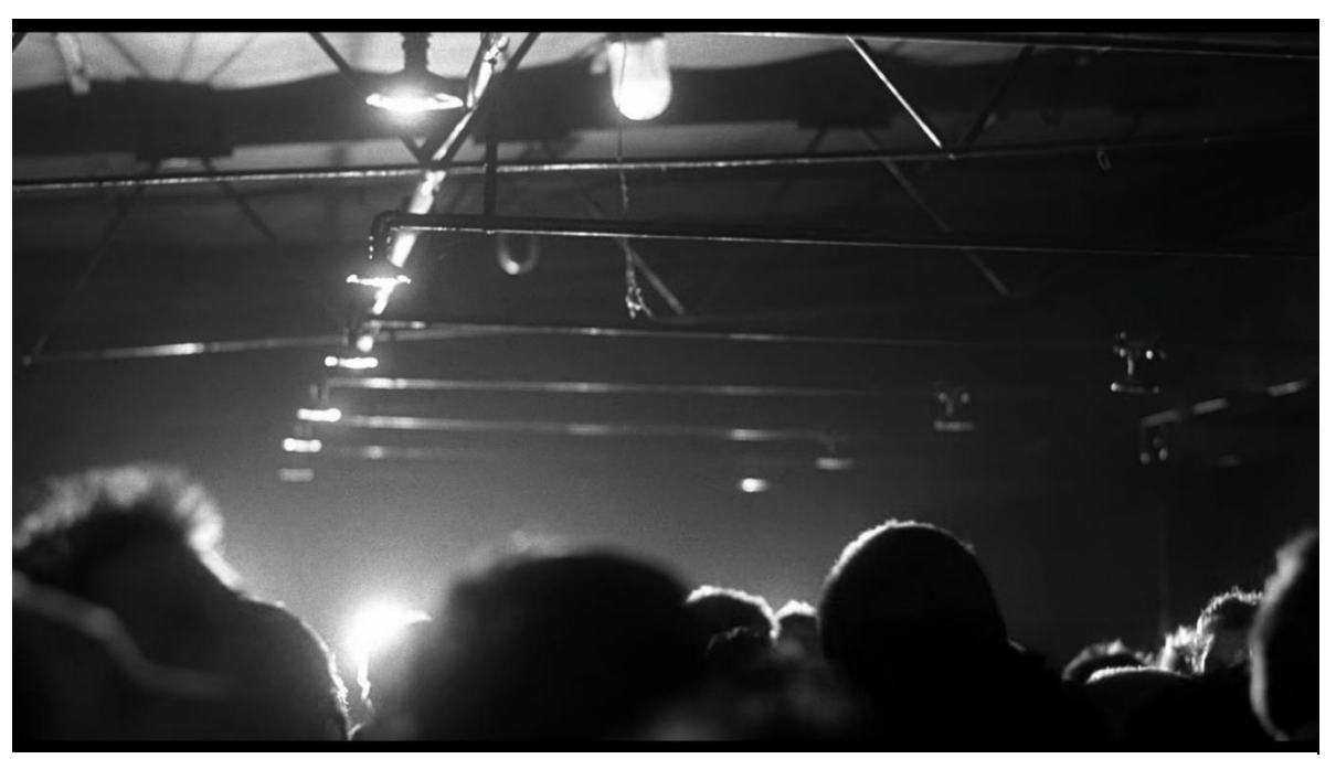
Figure 3.18: Schindler's List. Low-angle shot that depicts the shower heads above the female prisoners.