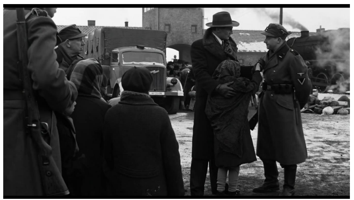
Figure 2.25: Schindler's List. Schindler convinces the guard that the children should also be put on the carriages.

Fundamentally, Spielberg and his crew frame the gatehouse as a backdrop for saviour and saved. In Figure 2.25, the camera is placed at the height of the children, matching their eyesight as Schindler convinces the guard of their essential place in his factory. This puts the viewer in the position of the children and under the protection of Schindler. By placing the camera at such an eye-level, the audience is immersed in the act of saviourhood. This means the viewer is also in the position of witnessing Schindler's actions. To fully capture the paradigm of saviour and saved the scene cuts to a medium close-up of a relieved Schindler and an exterior shot of the women as they peer out of the barbed-wire window (Figure 2.26). Spielberg creates a sense of continuity between arriving and departing, as the women's faces now appear hopeful. Once the camera leaves the grounds of Auschwitz (Figure 2.27), Schindler is framed as almost Shepard-like, leading the women and children to salvation at his factory in Brünnlitz (Figure 2.28).