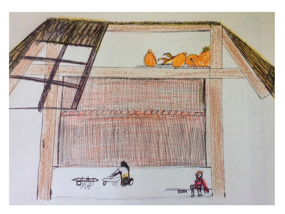
Figure 6. A consensus drawing of the smoky kitchen produced in a collective interview with Nahua Elders (Centro, 2015).

The definitions of the concepts of home and house rooted in modern western society prioritize a dichotomy of inside-private/outside-public spaces. However, in the Nahua