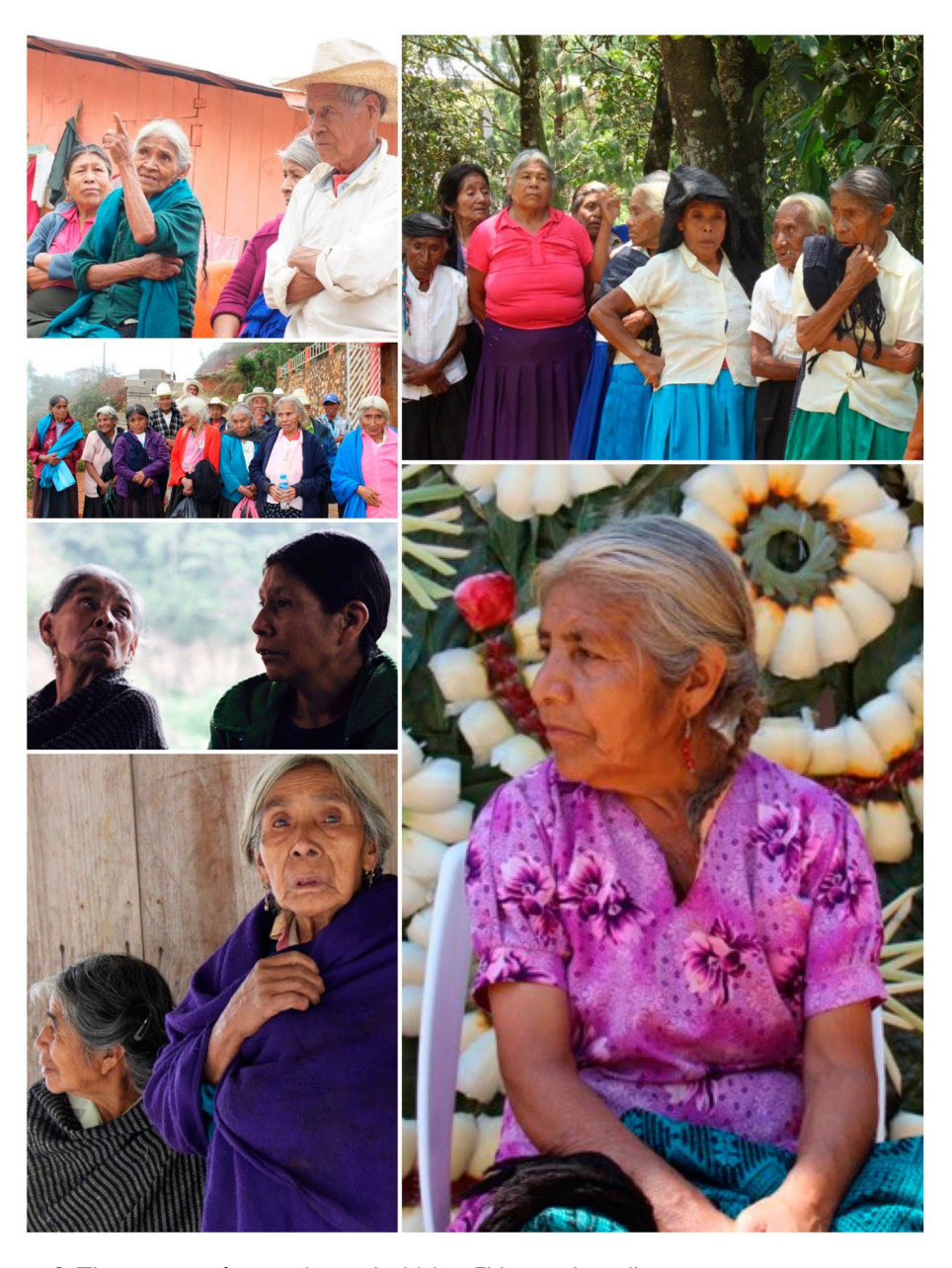
Figure 3. The process of remembering by Nahua Elders in the collective interviews.

conversation. The interviews were conducted as listening sessions, prompted by our questions, such as "what stories do you remember?" and "do you think Mixtla de Altamirano has changed?" Additionally, we were able to recreate a smoky kitchen in a drawing during an interview in the Centro of Mixtla de Altamirano, an exercise in consensus-building that reunited the Elders and created comradery among all the participants. Although the interview questions were planned, the conversation flowed in multiple directions, as it was the Elders who encouraged each other in the process of