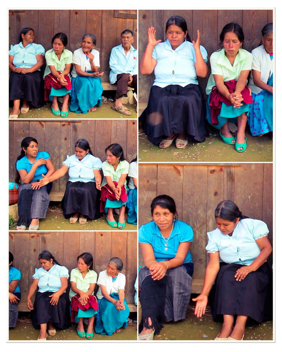
Figure 5. Women remembering the metlatxontil stone.

anthropological literature, these spaces are known as cocinas de humo or "smoky kitchens" (Pazarelli 2016, 52; Vargas and Casillas 2008, 114). However, it is not clear if the name was ascribed by people who have visited Native communities across Latin America (e.g. authorities, academics, and non-governmental organization workers, among others) or if it is the way Native people referenced these spaces. The truth is that across the interviews, Nahuas presented these spaces as much more than a simple kitchen. In their words, "it is where life develops," and these spaces are the heart of the community (Figure 6).