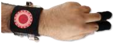
Figure 4: All three layers were joined by using self-adhesive materials because of their easy application. The displays are controlled by a 5V Arduino Nano and made wearable by mounting them on a Velcro band. To capture emotional arousal, Arduino was connected to galvanic skin response (GSR) sensor with electrodes attached on fingers to measure changes in skin conductance.

meaning: "I know what colors means but for someone else it is color coded" [P3]. They were also interested in sharing publicly positive feelings and privately negative ones: "for friends or family to know my mood" [P5].