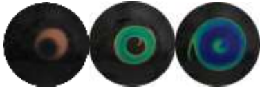
Figure 1: The Spiral display uses a spiral shaped nichrome wire for generating heat. A 35–40 °C self-adhesive thermochromic liquid crystal sheet is added on the top. The whole assembly is placed on polypropylene substrate for insulation. Increase in arousal is conveyed by varying current in nichrome wire, which generates color changing from red (left), green (middle) to blue (right) in a spiral shape from inside out.