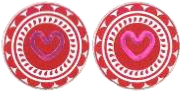
Figure 2: The Heart display involves a digitally created art design printed on adhesive tattoo paper. The design was transferred to paper and a 30–35 °C thermochromic pigment was applied at the center. A heart shaped nichrome wire was placed on polypropylene substrate. The thermochromic and heating layers were integrated with clear tattoo paper. Increase in arousal is represented by the change in heart’s color from purple (left) to pink (right).

represent affective data in time-series graphs [8] which provide limited user engagement for reflection. This paper explores the feasibility of smart materials for developing novel, thin and flexible wrist-worn displays for real time visualization of affective data to better motivate reflection [10]. We report the design and evaluation of two prototypes exploiting the value of ambiguous representations of emotional intensity.