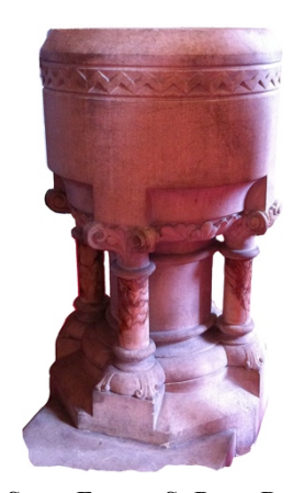
Figure 1. The Stone Font at St Peter De Beauvoir Town Church, Hackney, London, UK.

The "Font of Solace" digital font comprises the existing stone font that is housed within the church (Figure 1), a Samsung Galaxy Note Tablet with S-Pen stylus and the Android operating system, a Microsoft Kinect, a projector, and a computer with the Windows operating system and running the 'ubidisplays' software application [10].