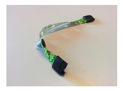
Fig. 2. Original prototype bracelet with an NFC tag embedded in a widget

With the NFC tags suitably housed the next step was to create a means to turn this individual item into a playlist. A simple bracelet was chosen as shown in Fig. 2 below, as each widget could then be customized to produce something akin to a charm bracelet.