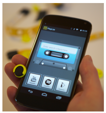
Fig. 3. The Android Application, Buttons can be seen for the three services.

Of course the utility of the App is not limited only to the initial writing of the data to the tag, it can also be used to re-write the tag so playlists can be edited on the fly to personalize them even further.